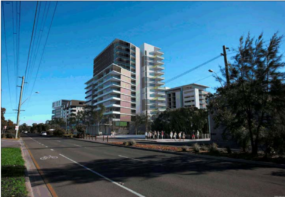
Figure 6 - View from east along Captain Cook Drive - as exhibited