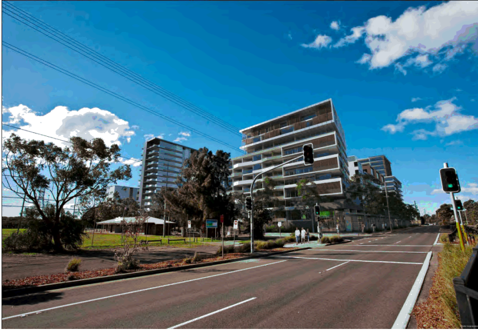
Figure 8 - View from west along Captain Cook Drive - as exhibited