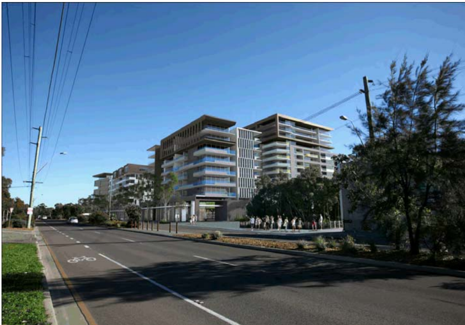
Figure 7 - View from east along Captain Cook Drive - as amended