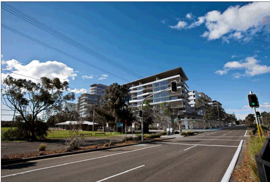
Figure 9 - View from west along Captain Cook Drive - as amended