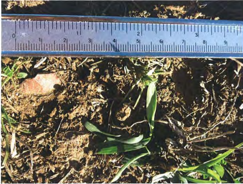
Red silcrete flake located next the vehicle track on the south side of the large dam bank.