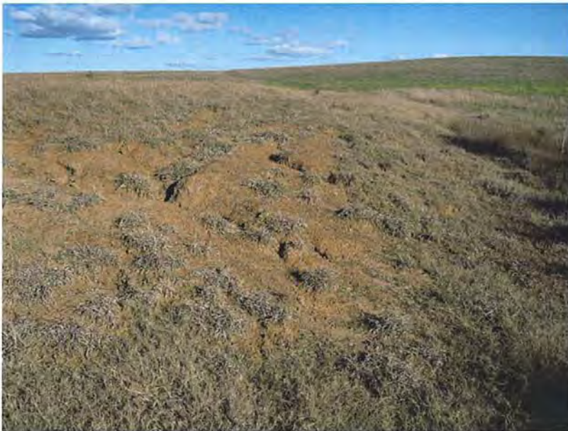
Eroded dam bank close to the where the silcrete flake was located.