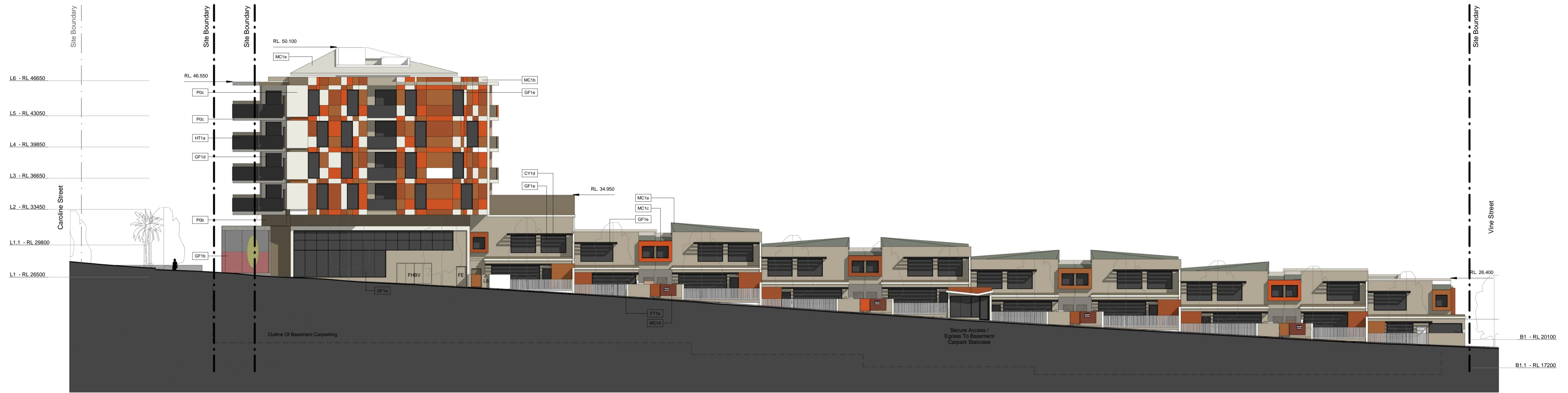
3 Eveleigh Street (East Elevation) 1 : 200