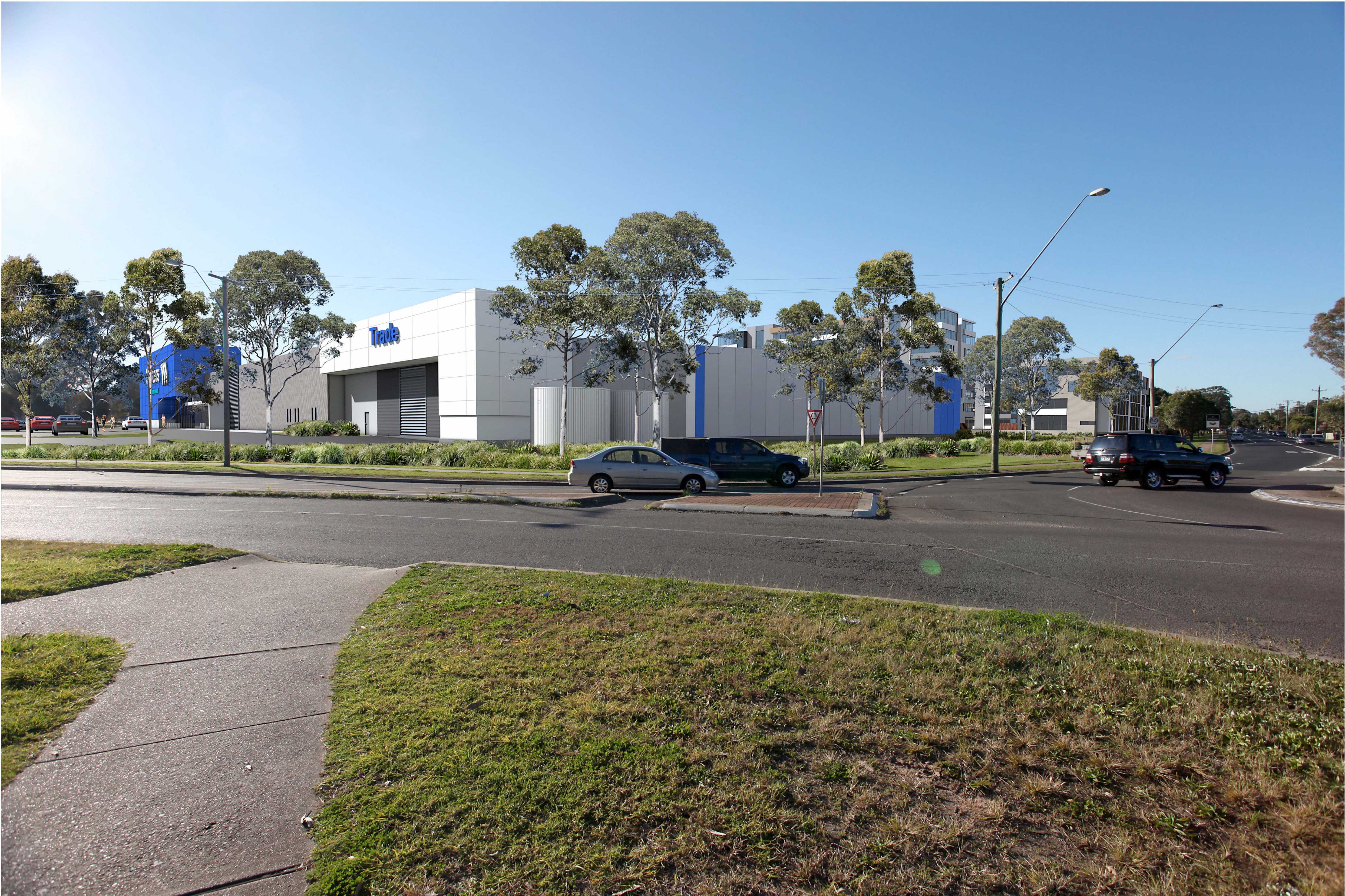
VIEW ALONG WOODRIF STREET / JAMISON ROAD FROM THE SOUTH