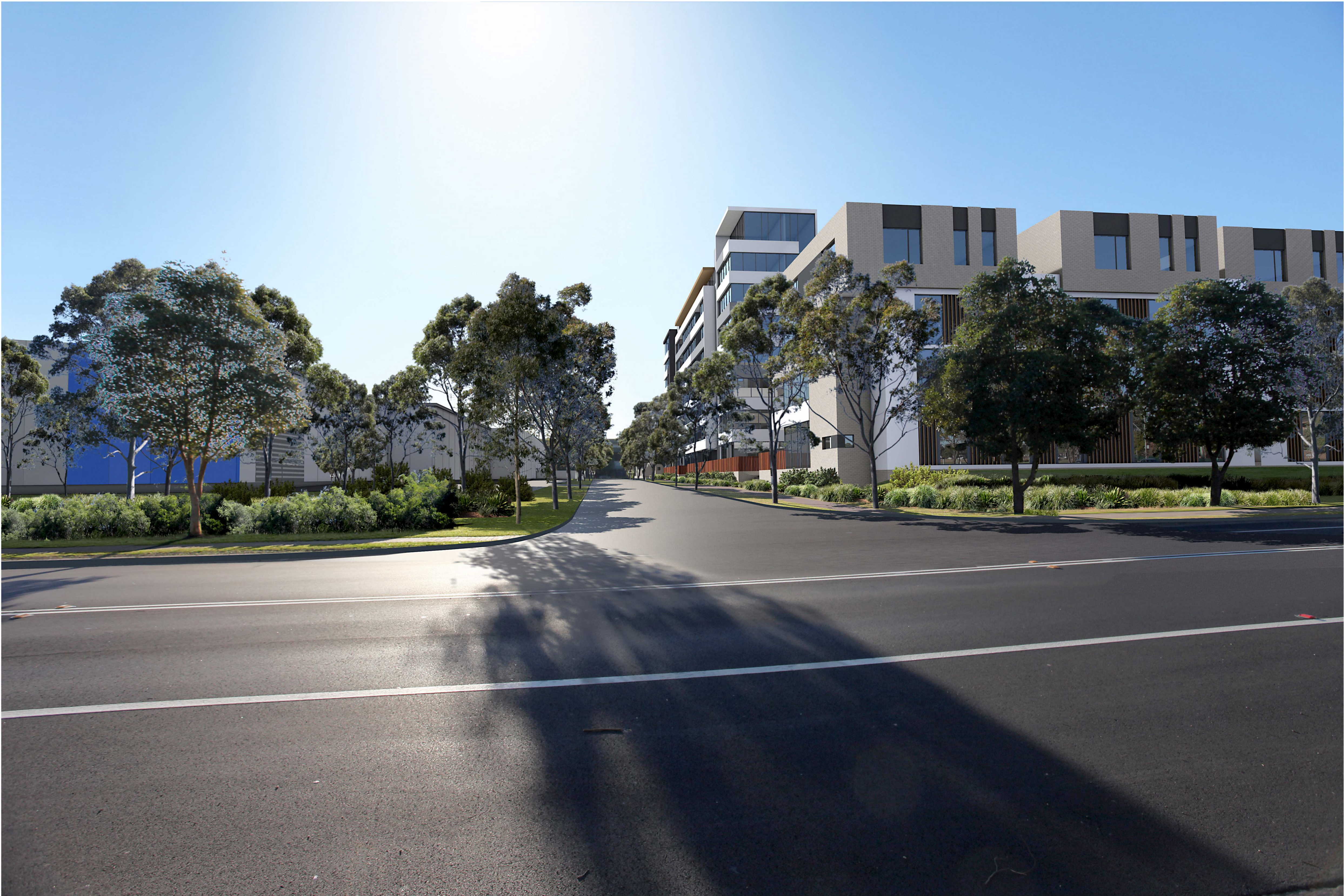
VIEW ALONG NEW STREET FROM WOODRIF STREET