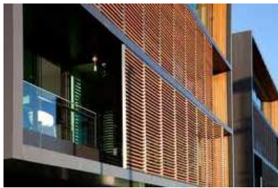
SLIDING SCREENS TO BALCONYS