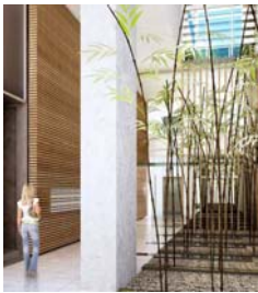
VOIDS BETWEEN LEVELS