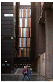
WALL TREATMENTS - TIMBER COMPOSITE PANELS + ALUMINIUM CLADDING