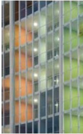
LOUVRED VENTILATION TO CORRIDORS