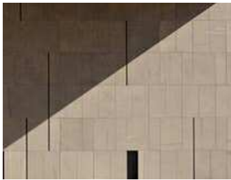
EXTERIOR WALLS - SANDSTONE