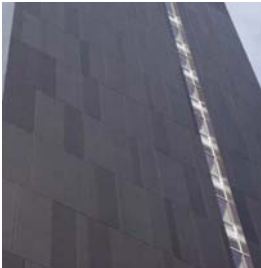
COMPOSITE PANEL CLADDING