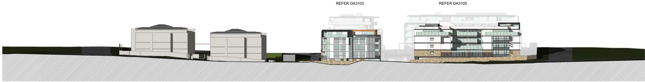
2 CLISSOLD STREET 1 : 500