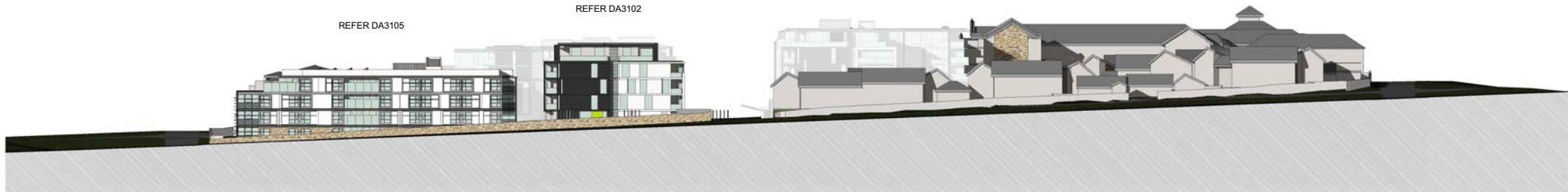
1 QUEEN STREET 1 : 500