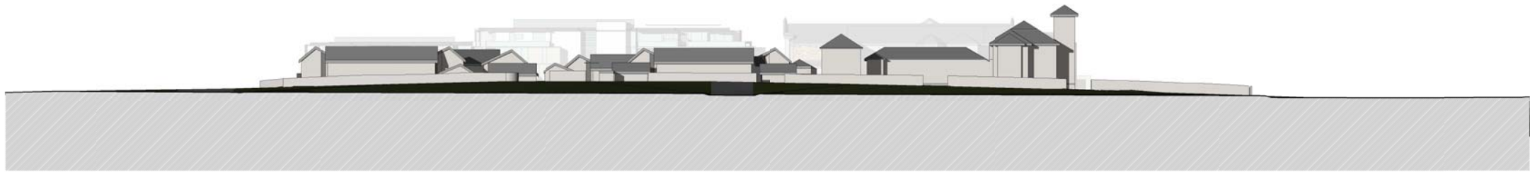
4 SEAVIEW STREET 1 : 500