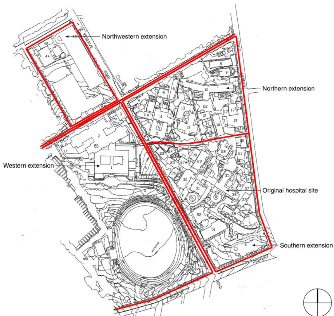
Figure 1.2 Royal North Shore Hospital Areas used in this report—approximate boundaries.