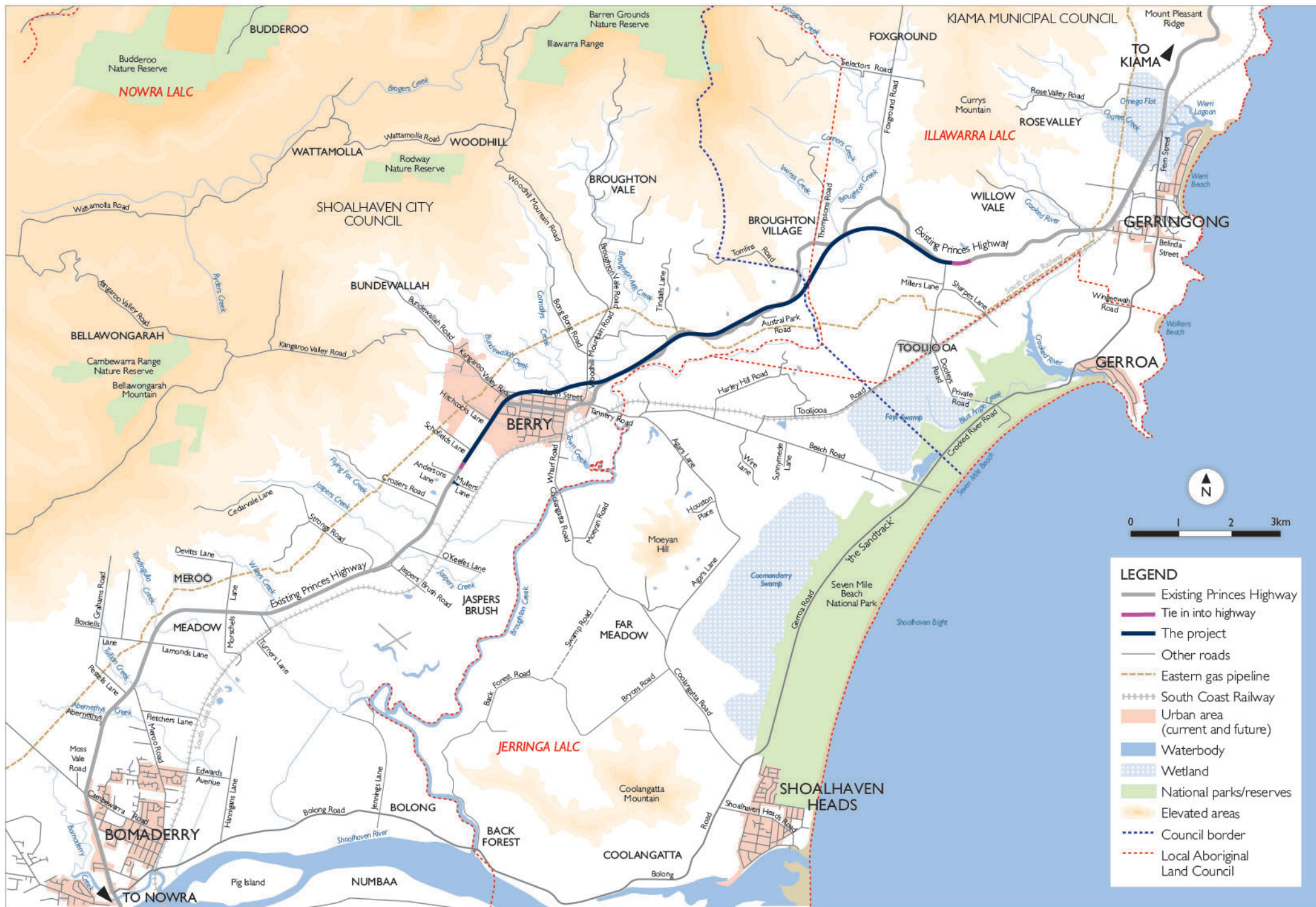
Figure 1-2 Regional context of the project