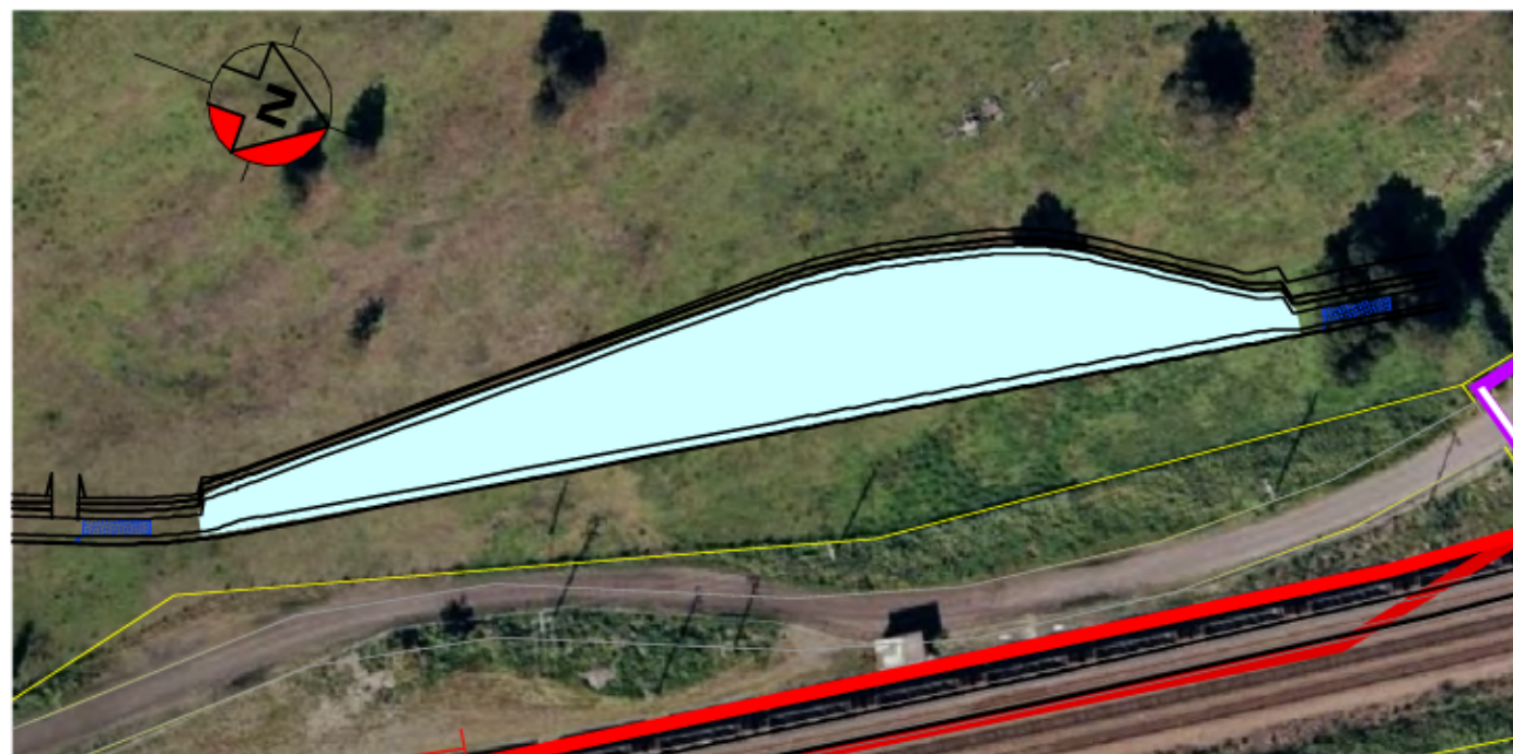
BASIN 1 SCALE 1:1250