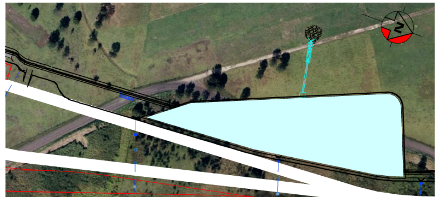
BASIN 2 SCALE 1:1250