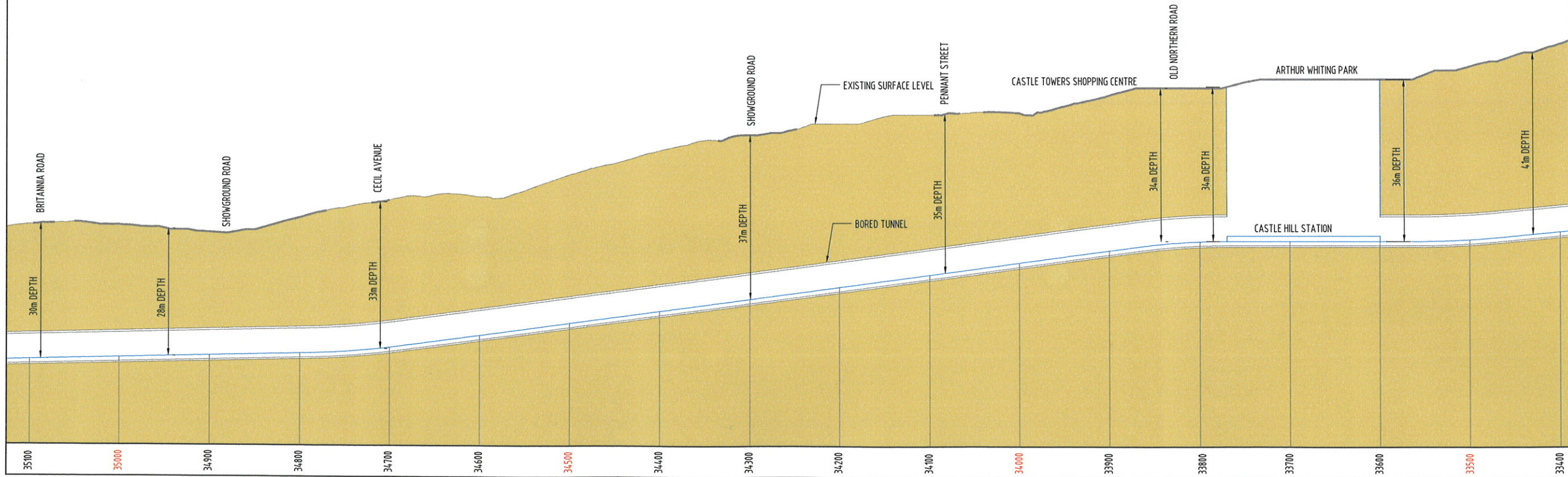
LONG SECTION INDICATIVE ONLY AND SUBJECT TO DETAILED DESIGN SCALE 1:5000 H SCALE 1:1000 V AT A3