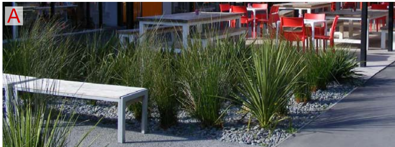
Outdoor Seating / temporary market zone