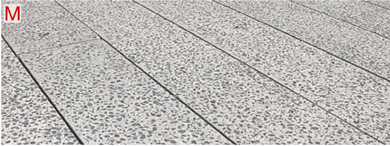
Large format concrete paving