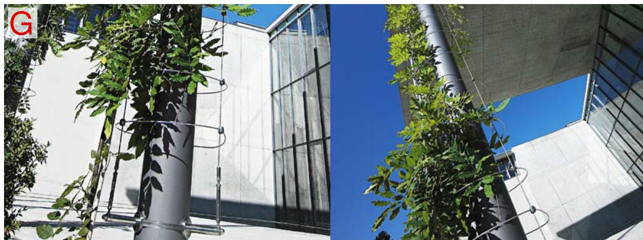
Feature trellis to building facade