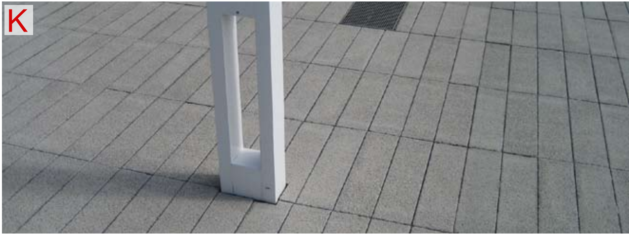
Small format concrete paving