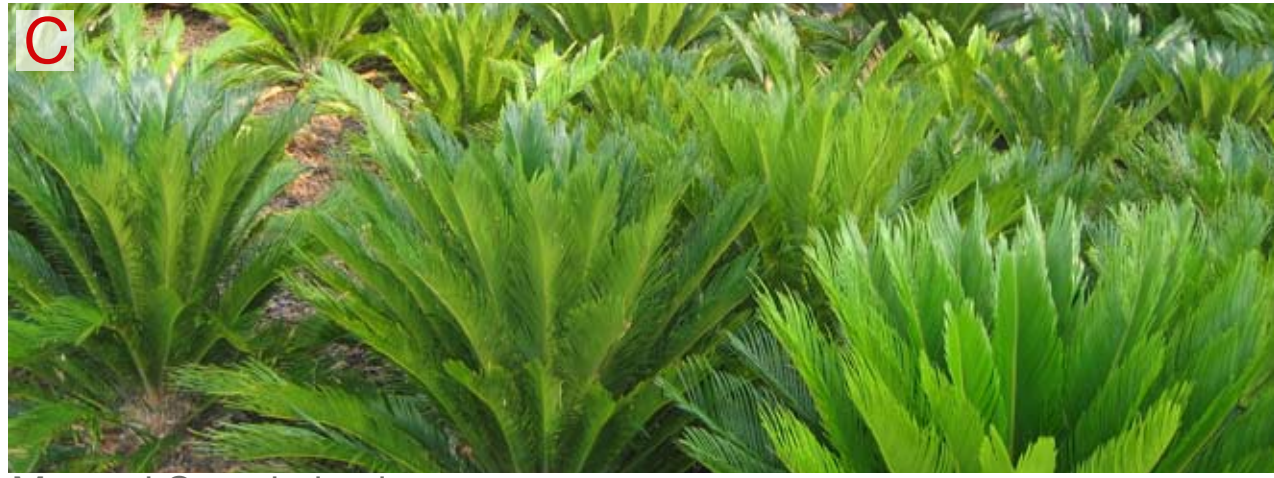
Massed Cycad planting