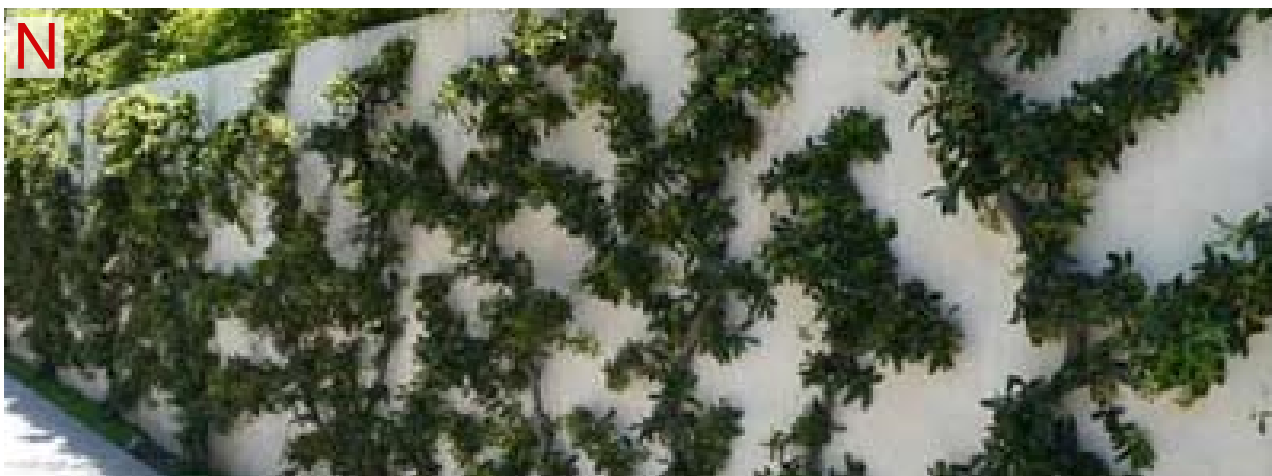
Espalier / Pleached trees along building facade

© 2012 Site Image (NSW) Pty Ltd ABN 44 801 262 380 as agent for Site Image NSW Partnership. All rights reserved. This drawing is copyright and shall not be reproduced or copied in any form or by any means (graphic, electronic or mechanical including photocopy) without the written permission of Site Image (NSW) Pty Ltd Any license, expressed or implied, to use this document for any purpose what so ever is restricted to the terms of the written agreement between Site Image (NSW) Pty Ltd and the instructing party.