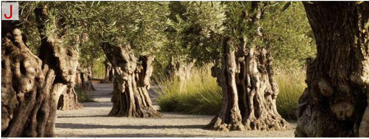
Tree grove planted amongst gravel and feature grasses