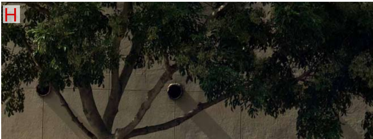
Eg. Evergreen Ash ( Fraxinus griffithii ) planting to street verge