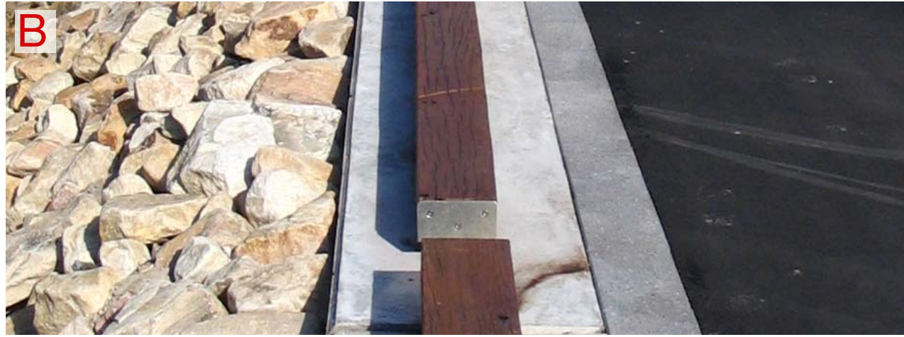
Timber Kick Rail