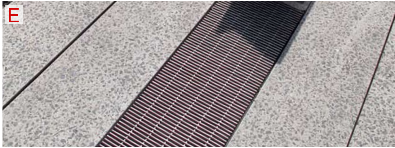
Steel Tree Grill flush with Paving