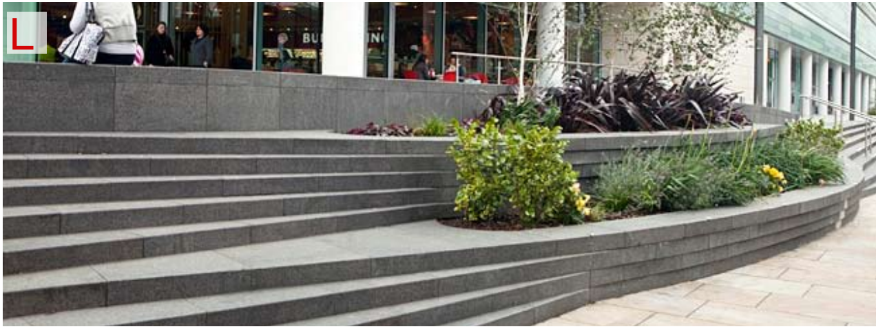
Feature Concrete steps