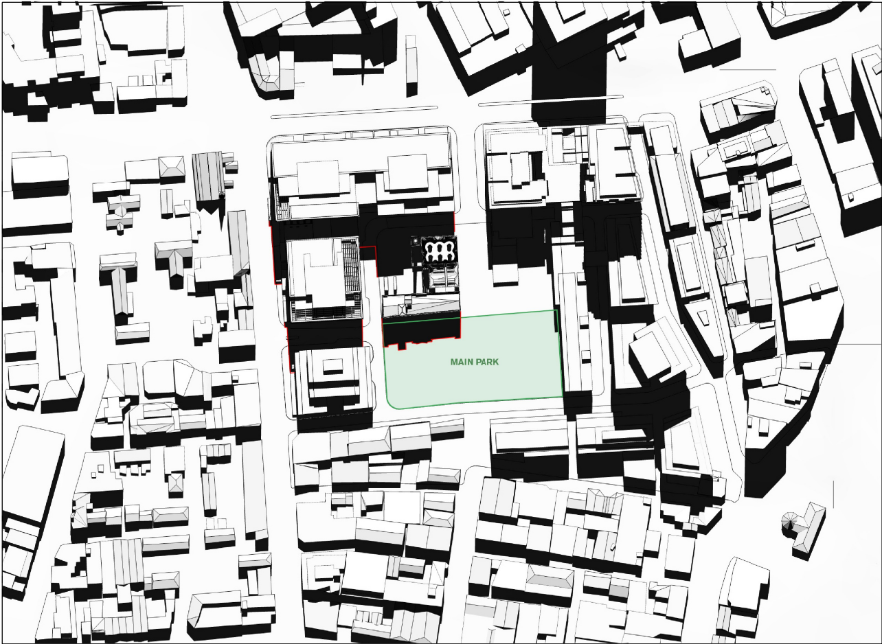
01 21 March 12pm