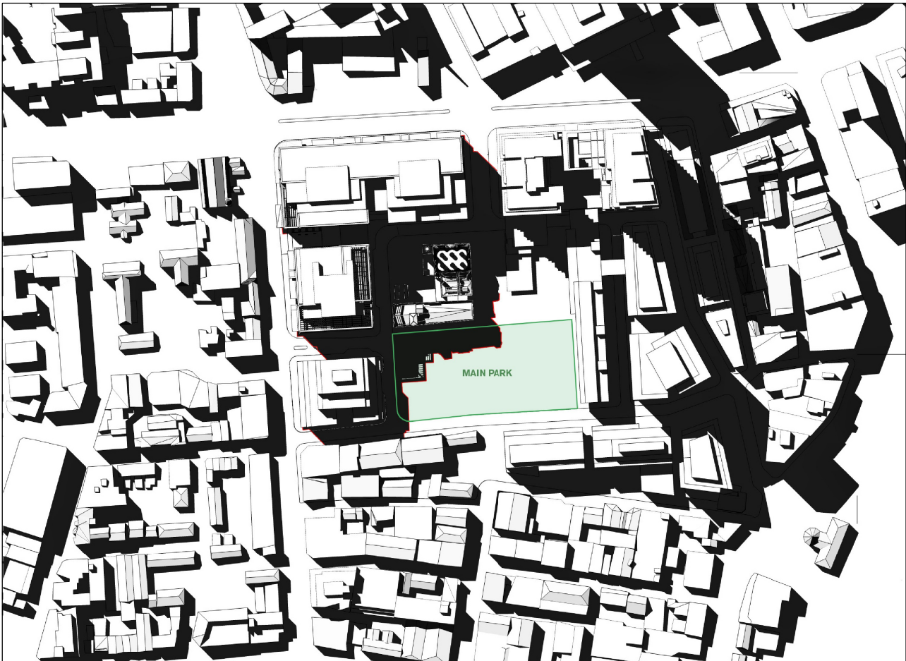
03 21 March 2pm