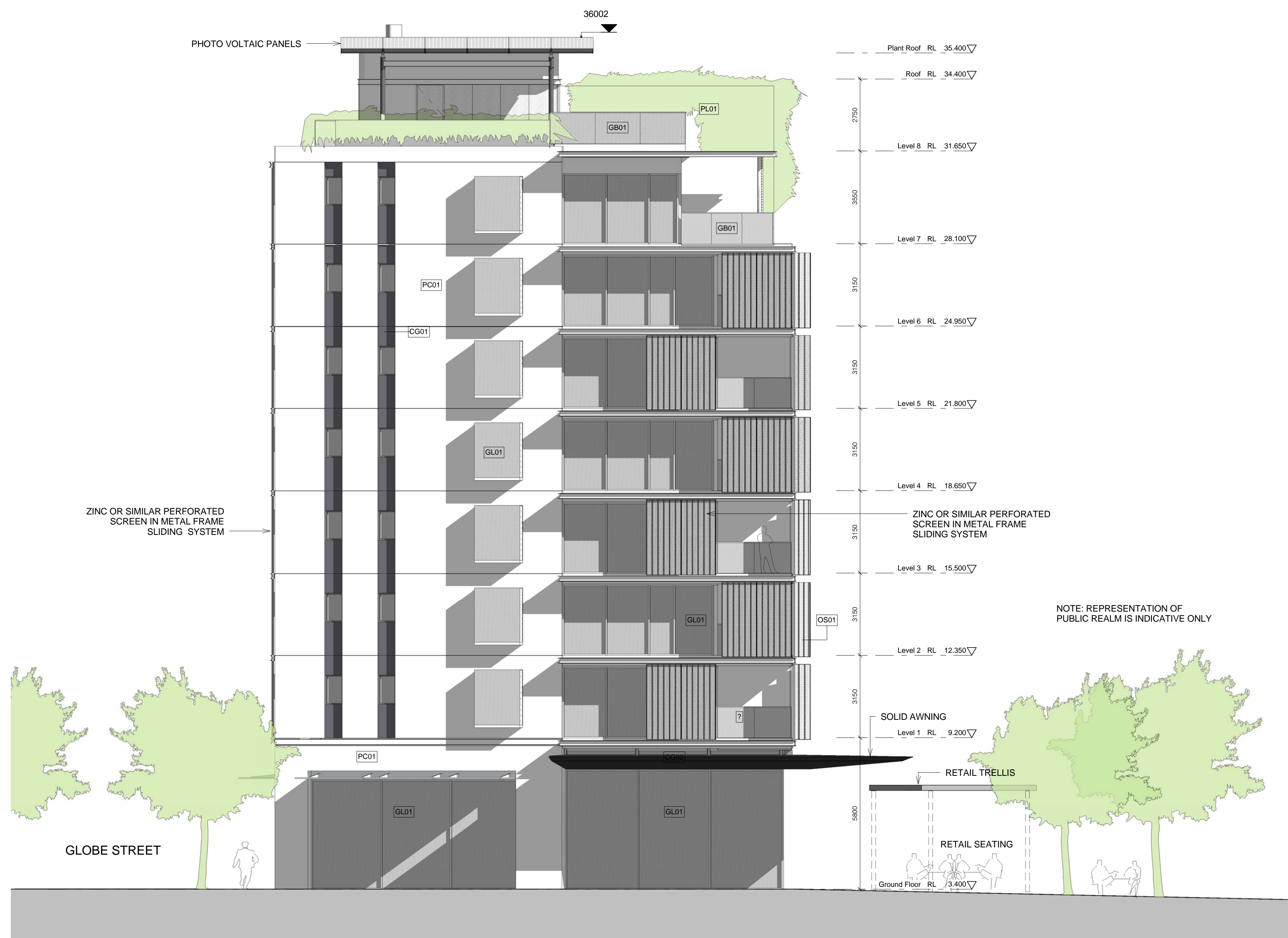
1 North Elevation 1 : 100