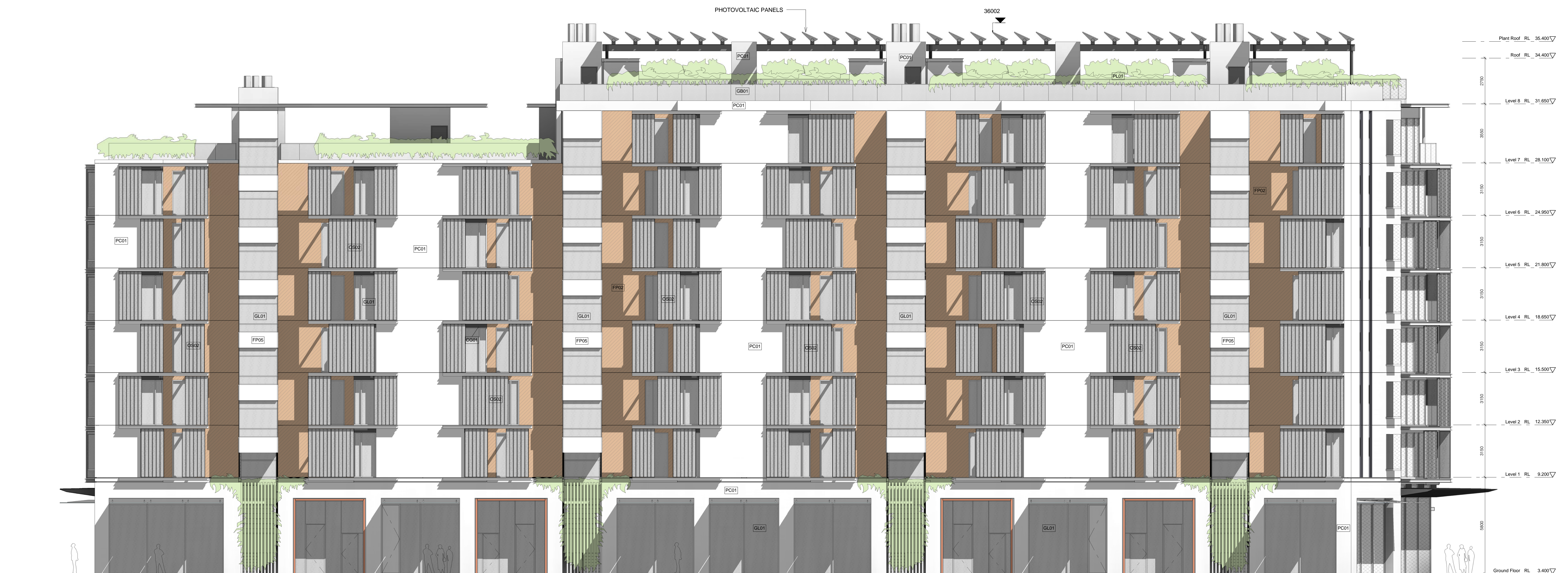
1 East Elevation 1 : 100