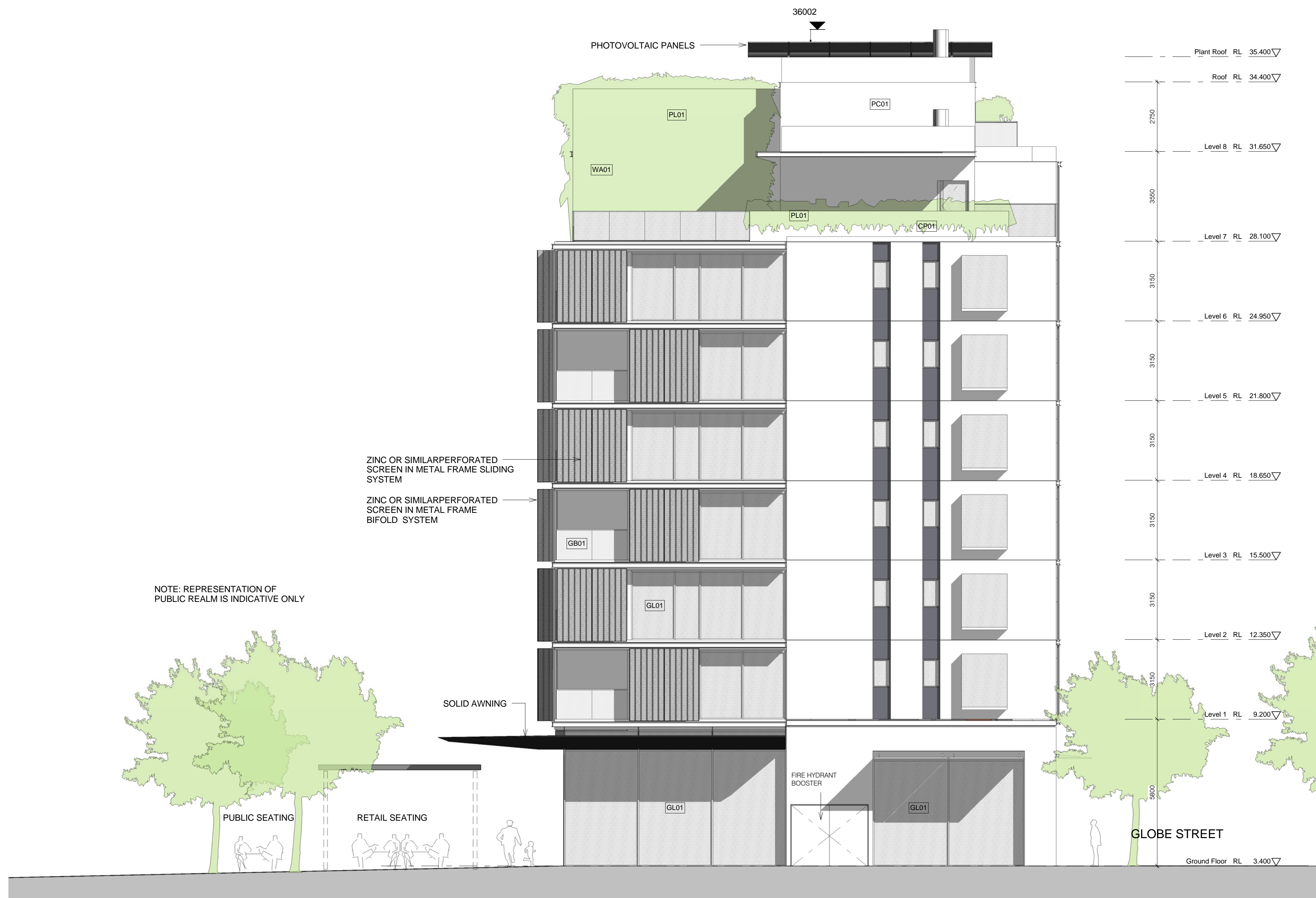
1 South Elevation 1 : 100