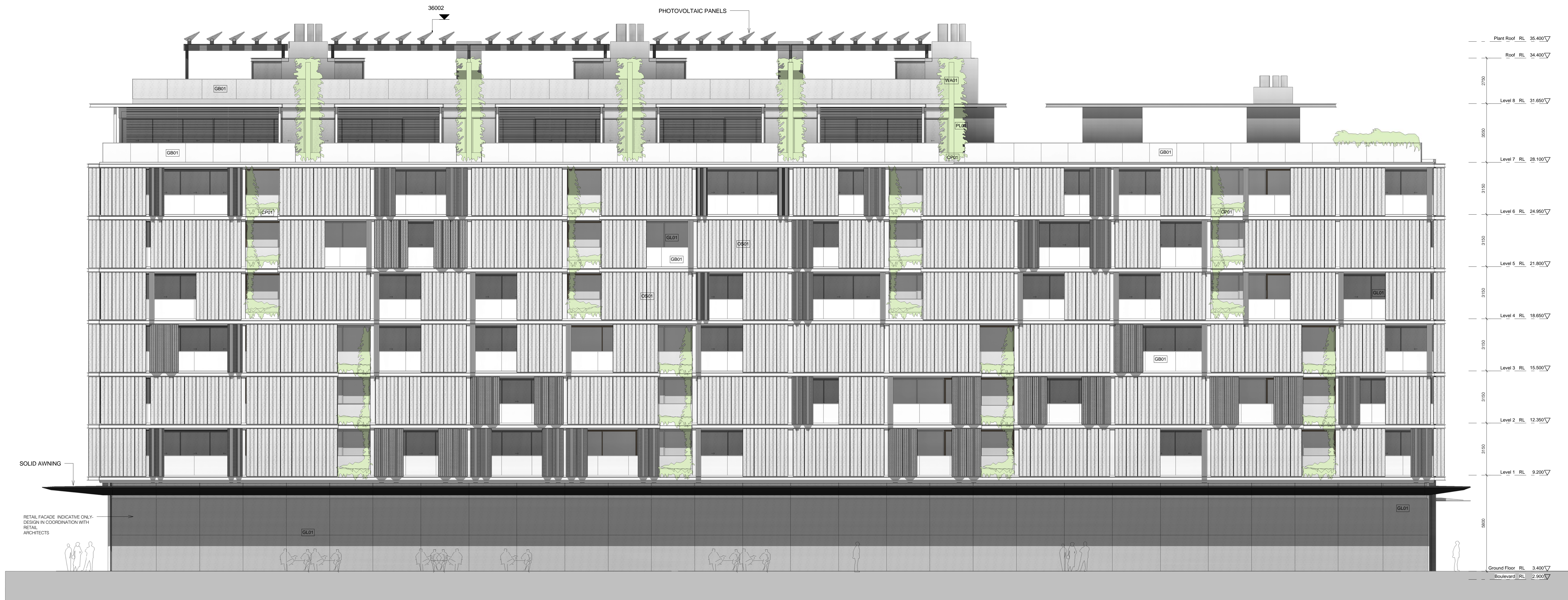
1 West Elevation 1 : 100