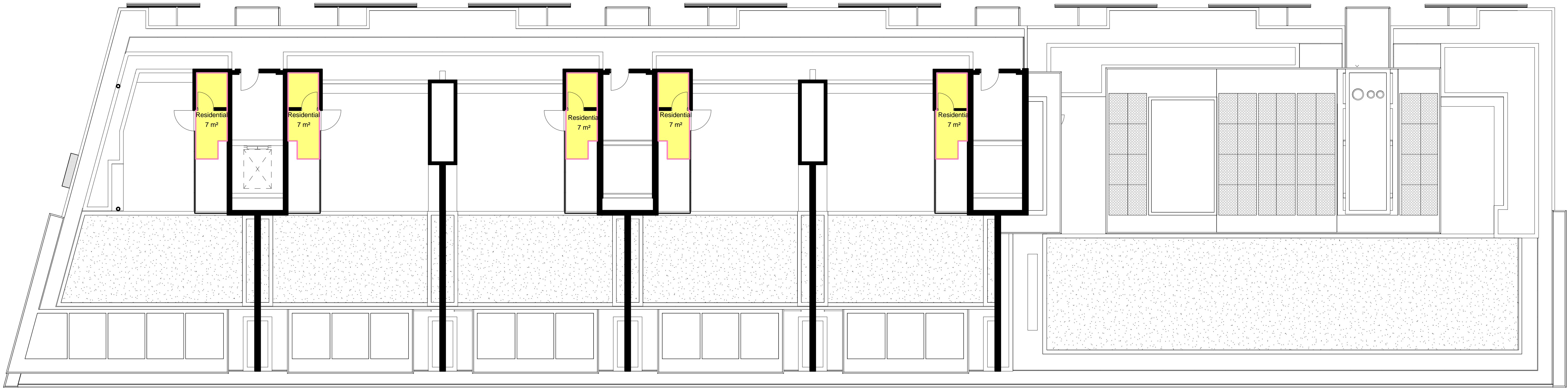
2 Level 8 1 : 100