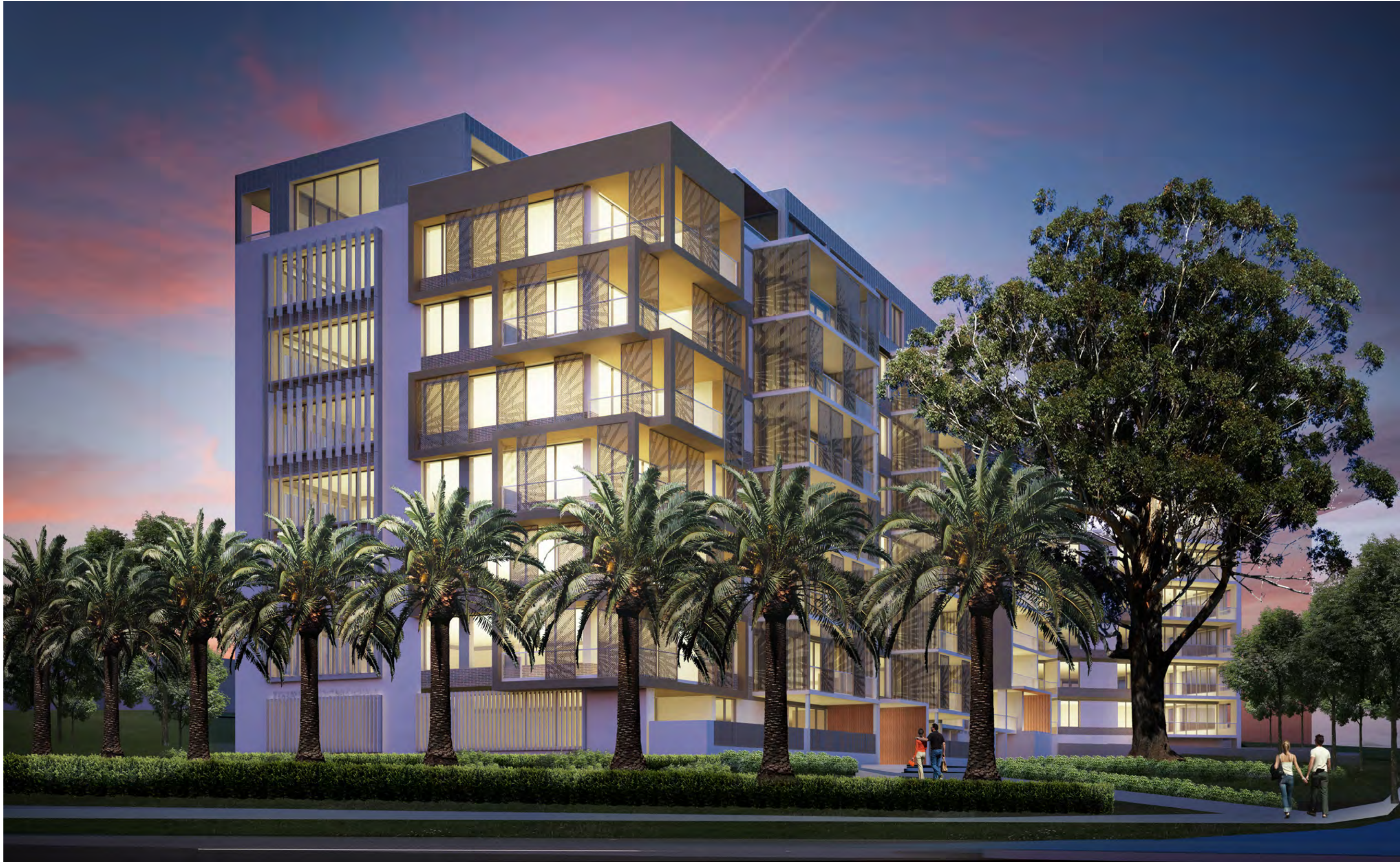
View from Victoria Road