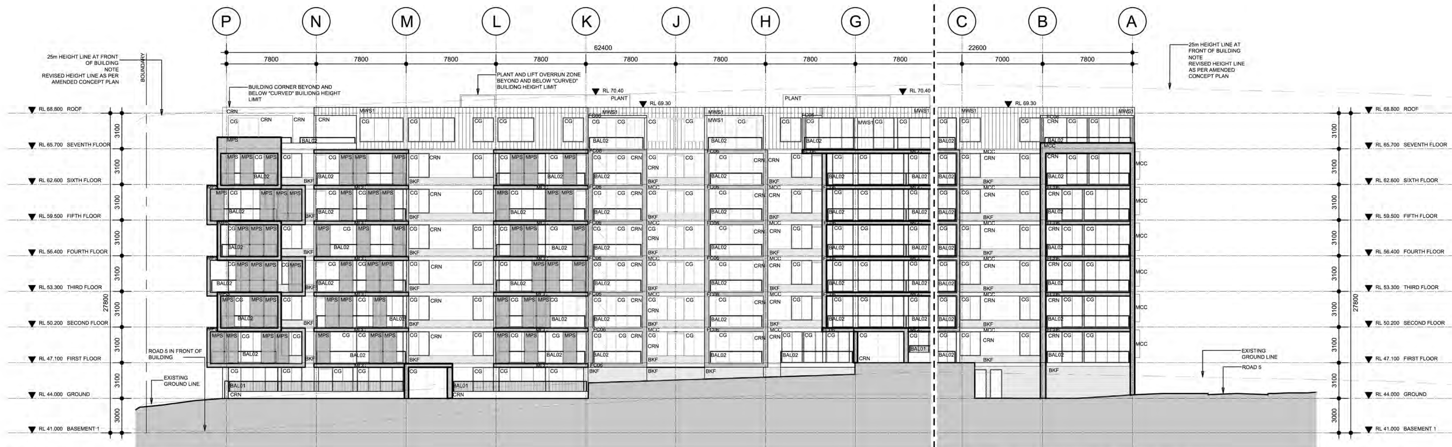
01 NORTH ELEVATION 1:200