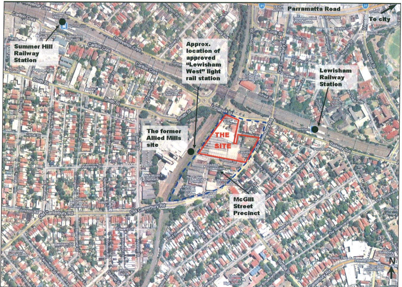
Figure 1: Local Context Plan

The site is within the Marrickville Local Government Area (LGA), approximately 6 kilometres west of the Sydney CBD ( Figure 1 ). The site is also near the boundary of Ashfield LGA.