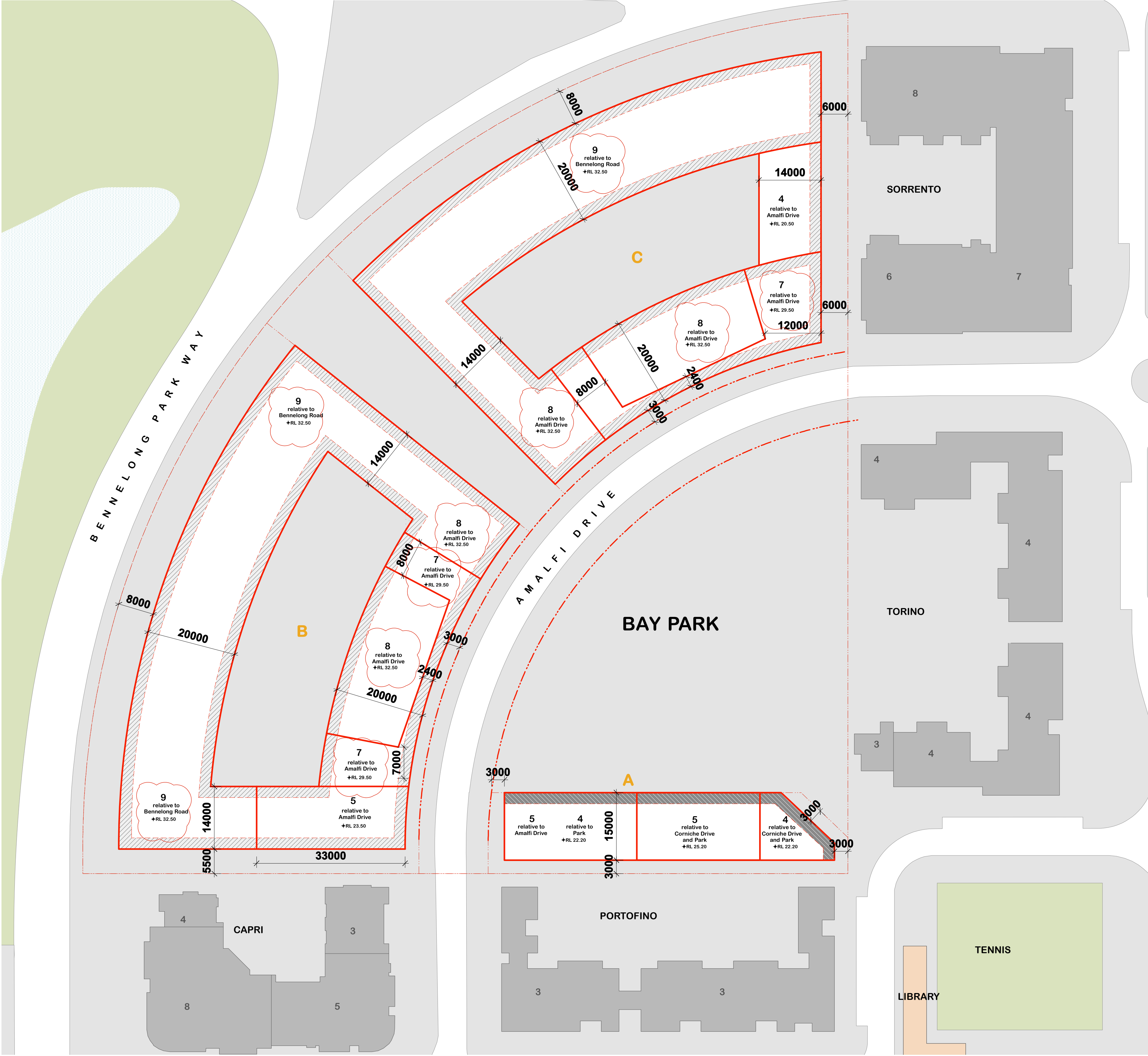
BAY PARK ENVELOPE - PLAN