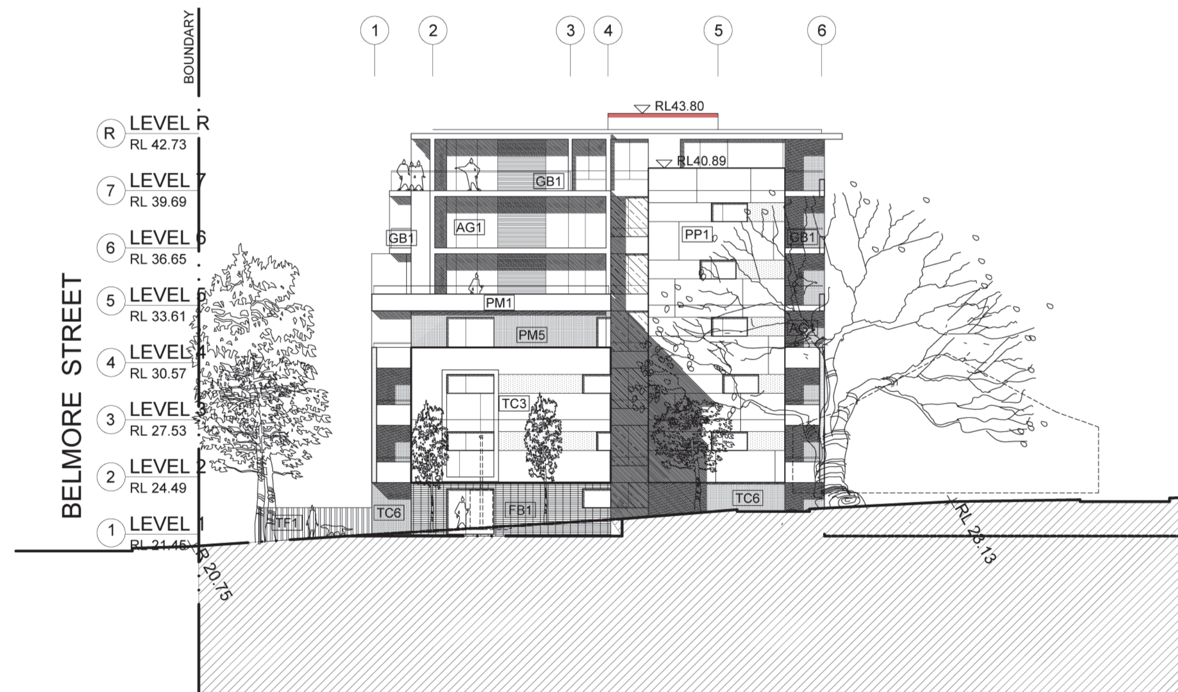
B SOUTH ELEVATION - BUILDING B A302 1:200