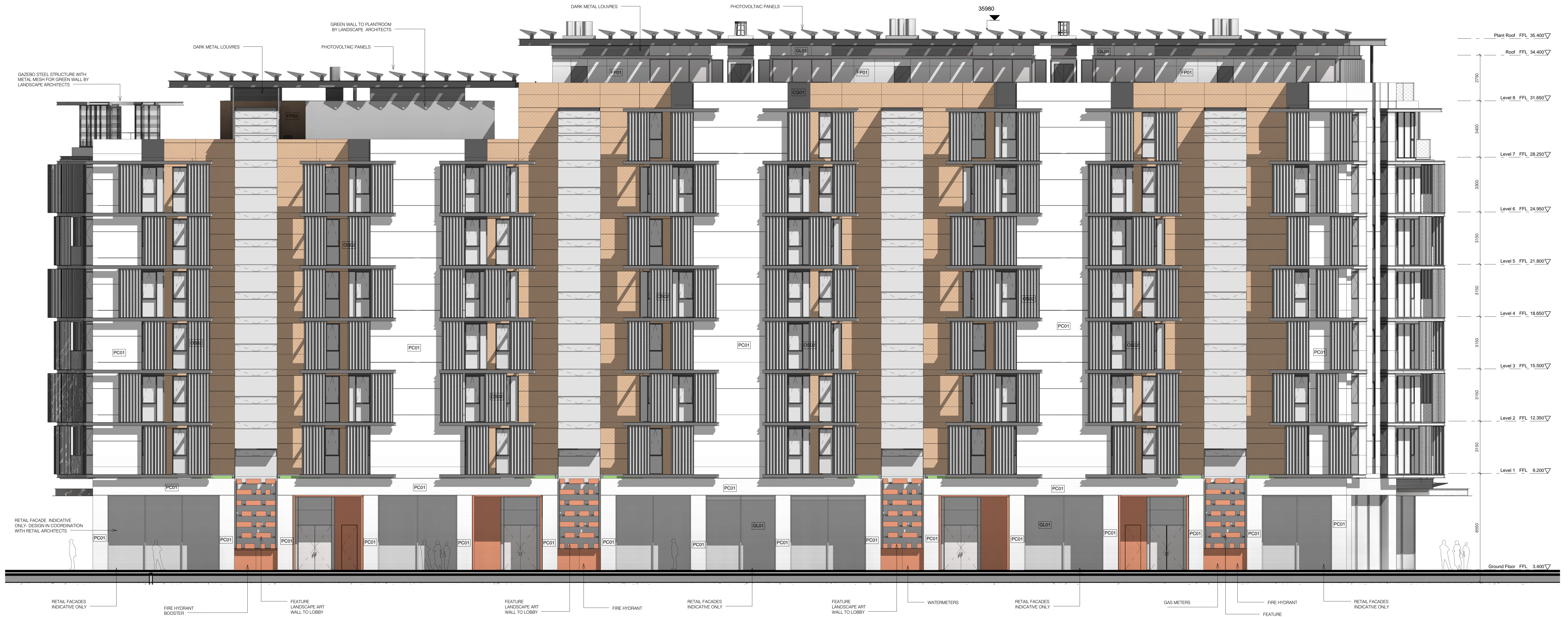
1 East Elevation 1 : 100