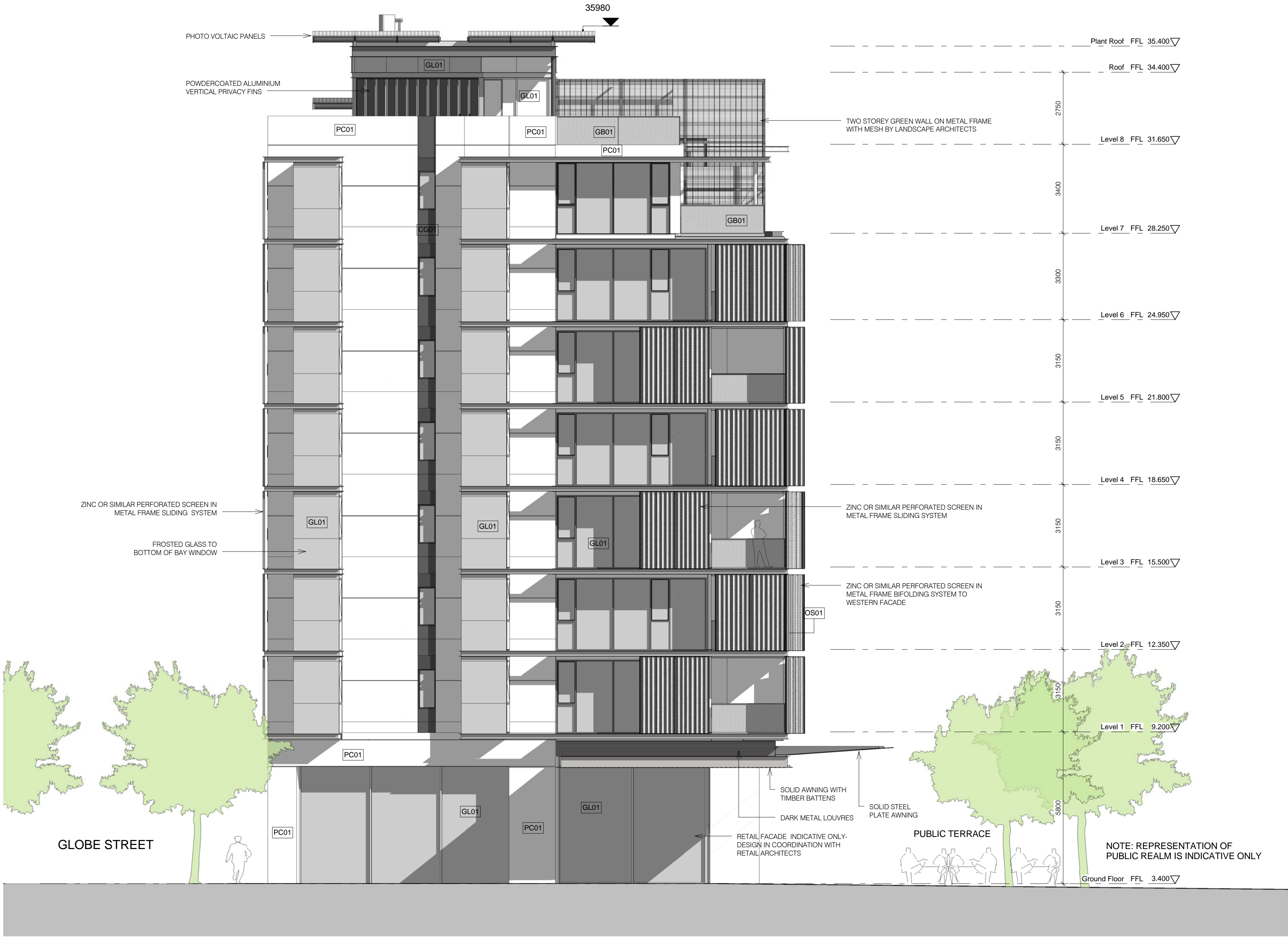
1 North Elevation 1 : 100