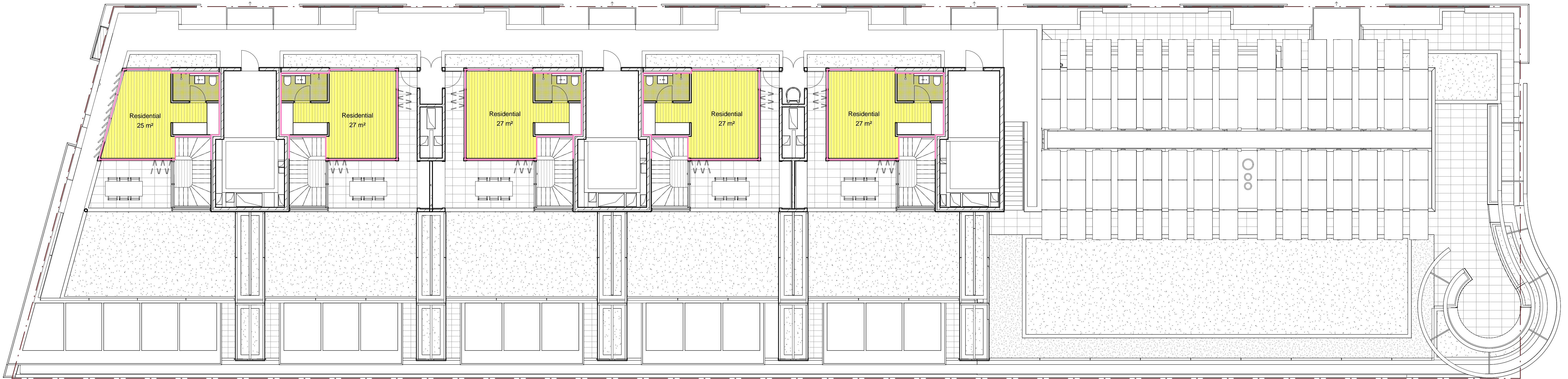
2 Level 8 1:100