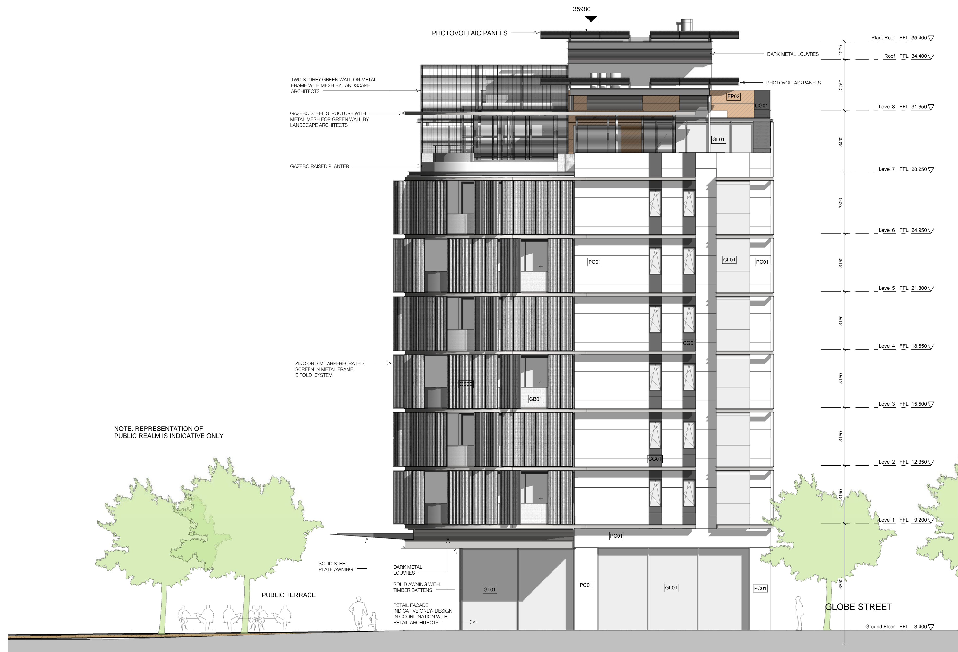
1 South Elevation 1 : 100