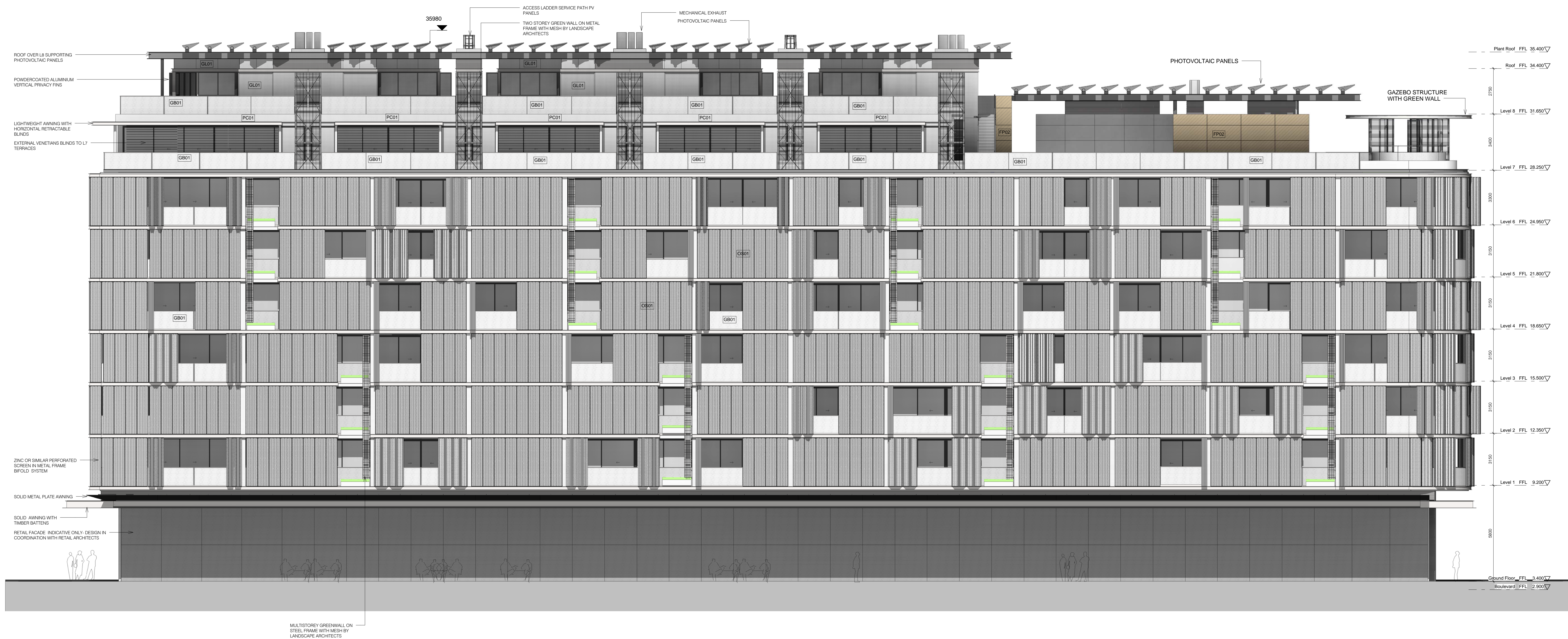
1 West Elevation 1 : 100