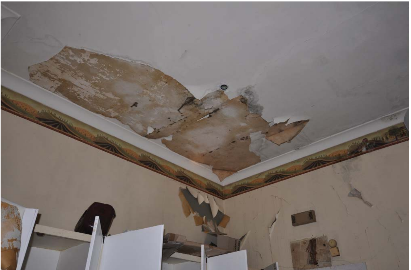
LG07 KITCHEN 03