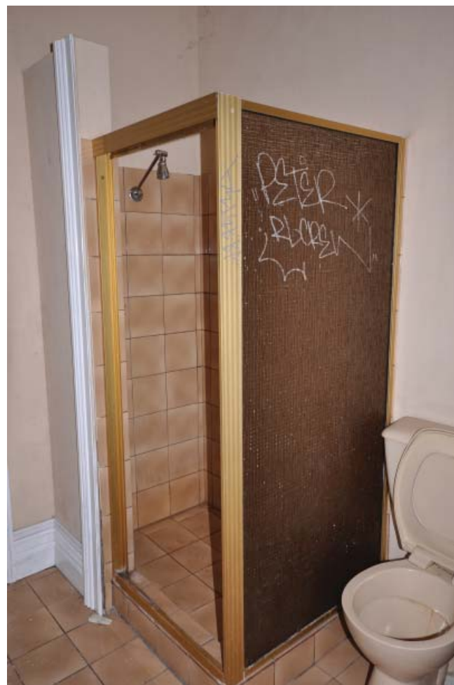
G09 BATHROOM 03