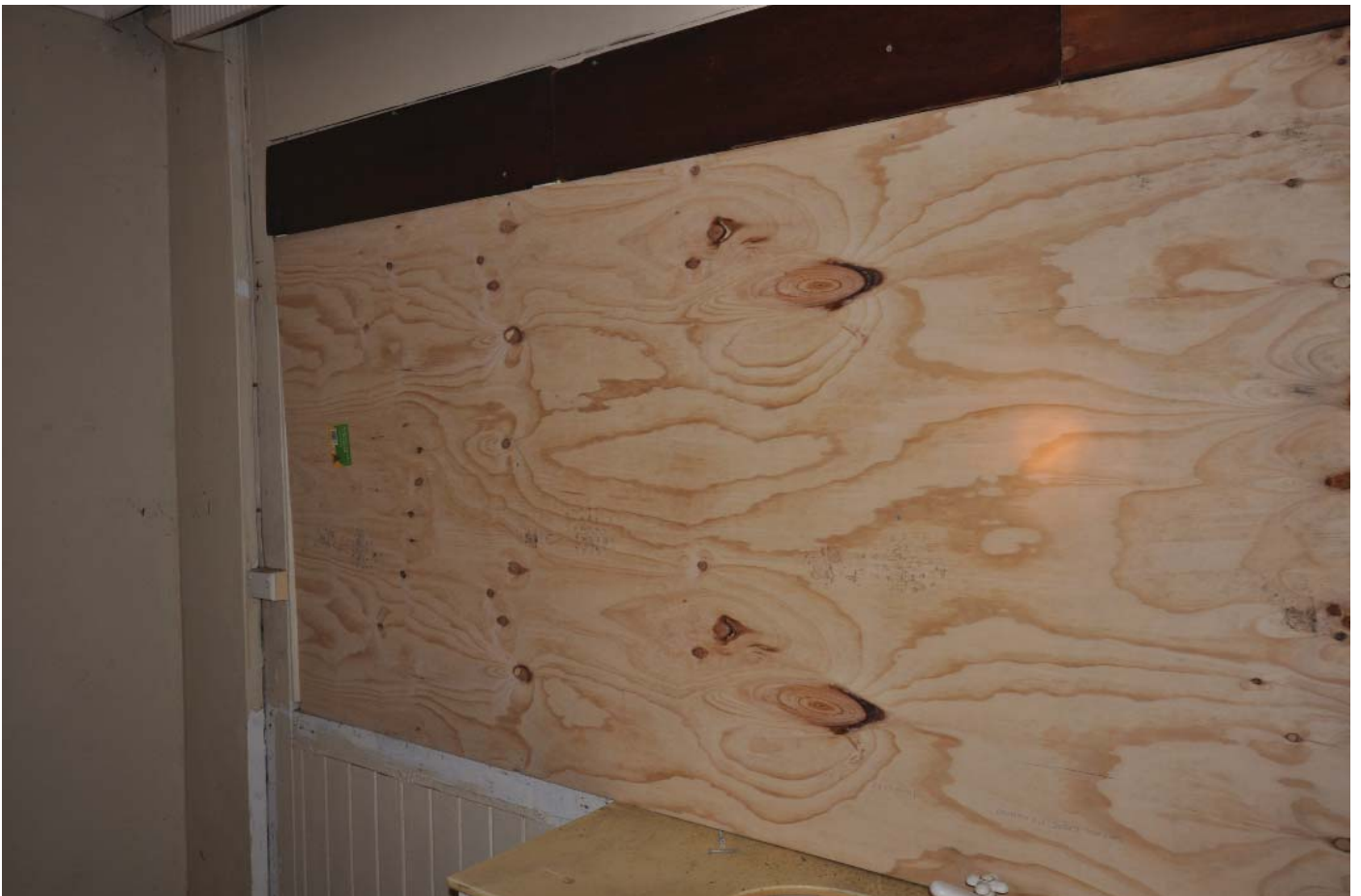
G11 BATHROOM 02