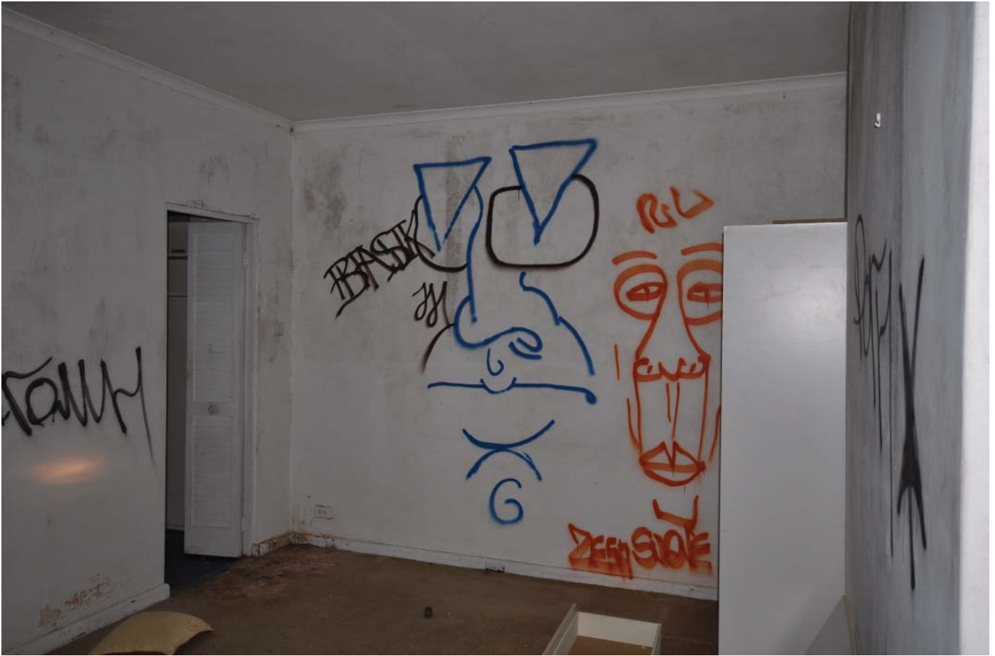
LG01 BEDROOM 01