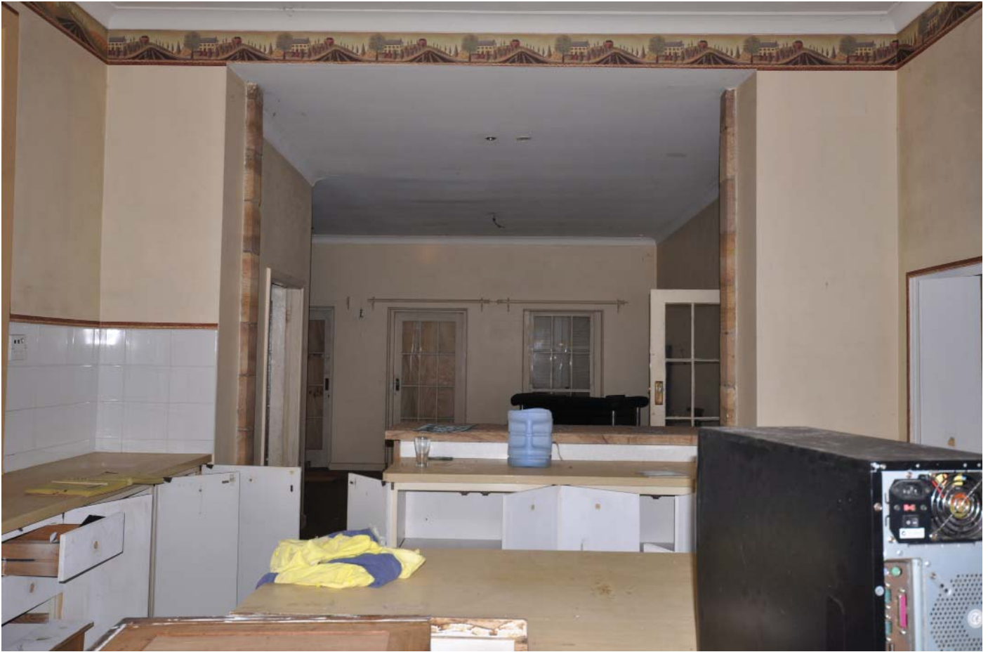
LG07 KITCHEN 02