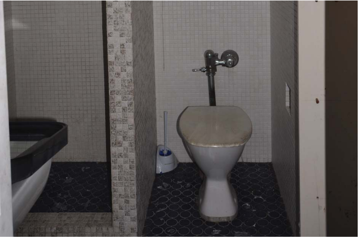
LG02 ENSUITE 01