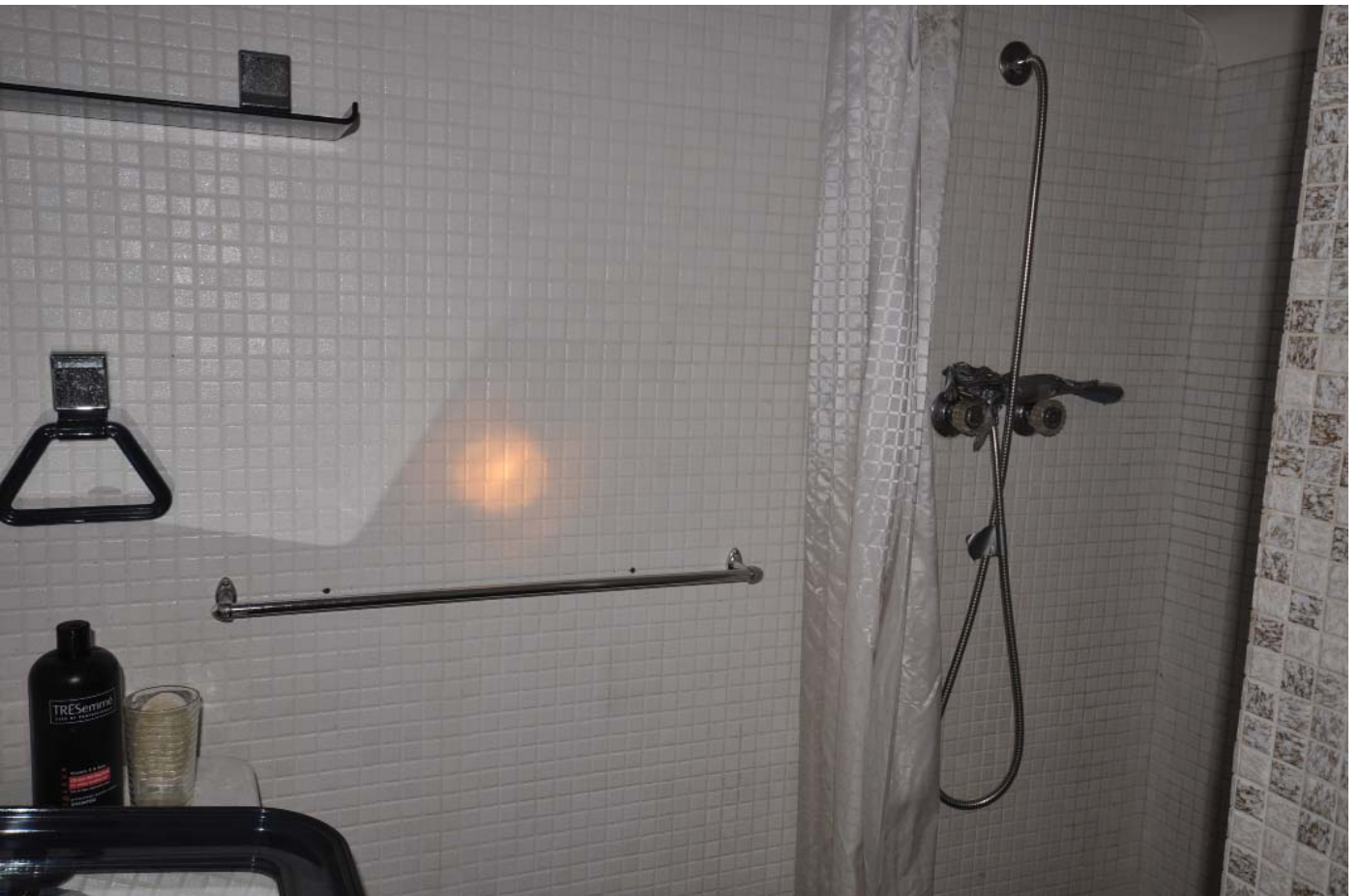
LG02 ENSUITE 02