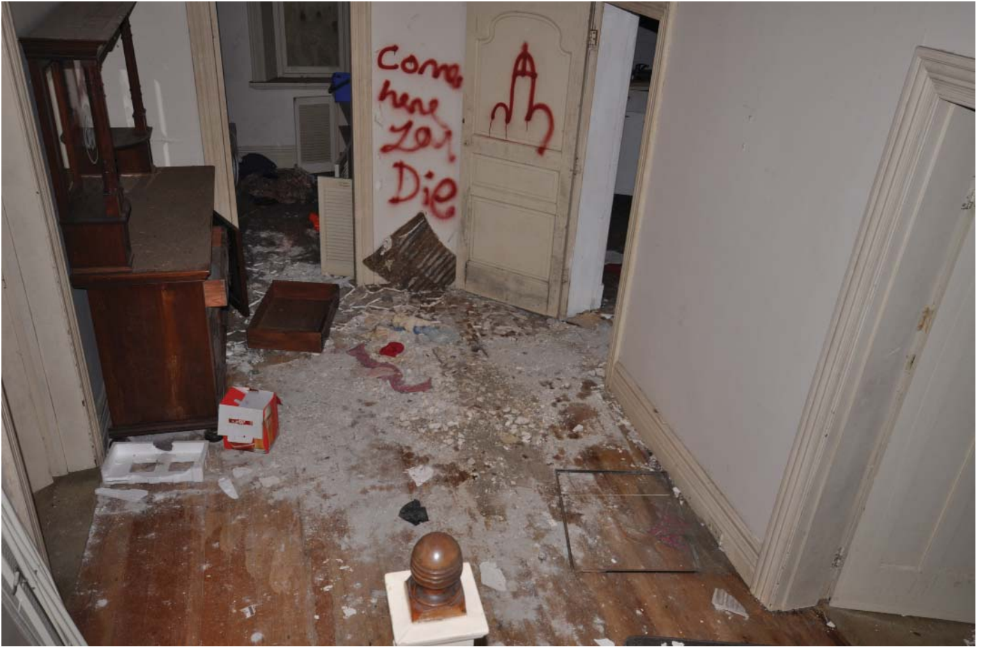
LG05 STAIR/HALL 01