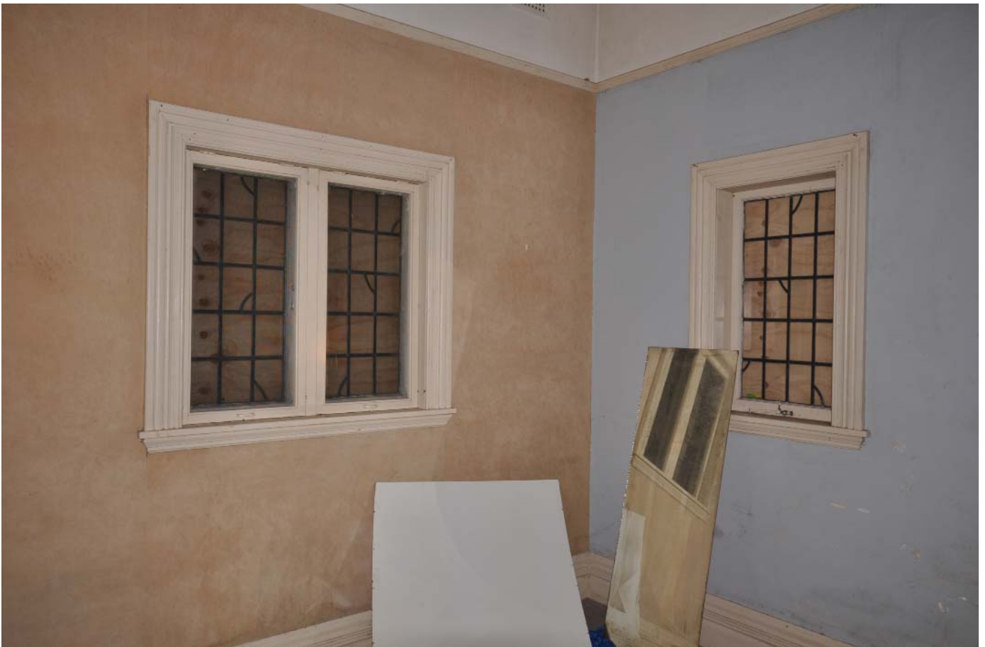
G01 STUDY 02