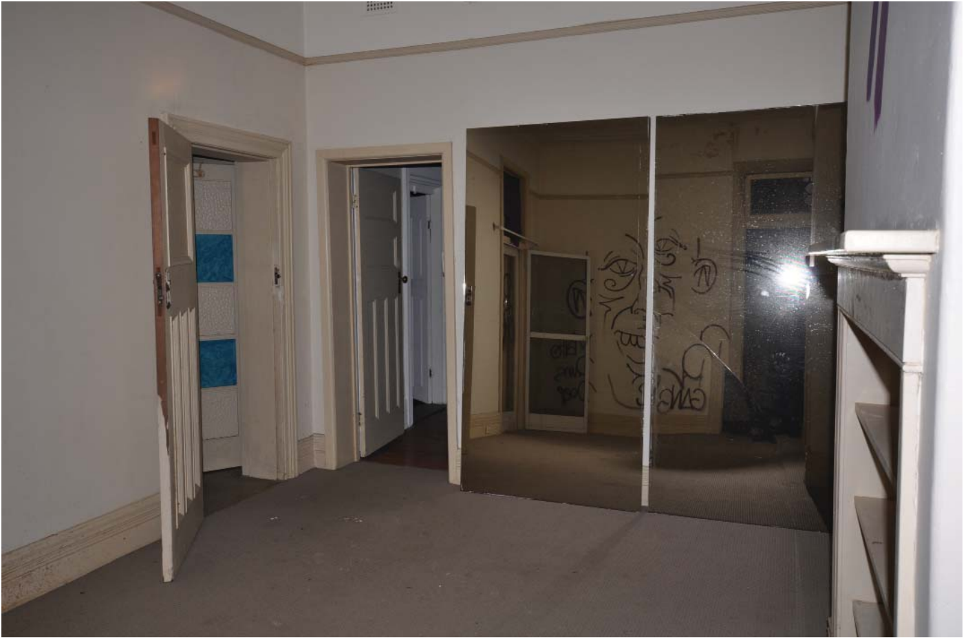
G05 MAIN BEDROOM 01