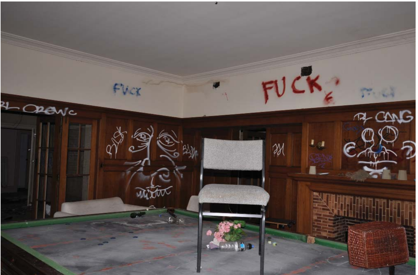
LG13 GAMES ROOM 02