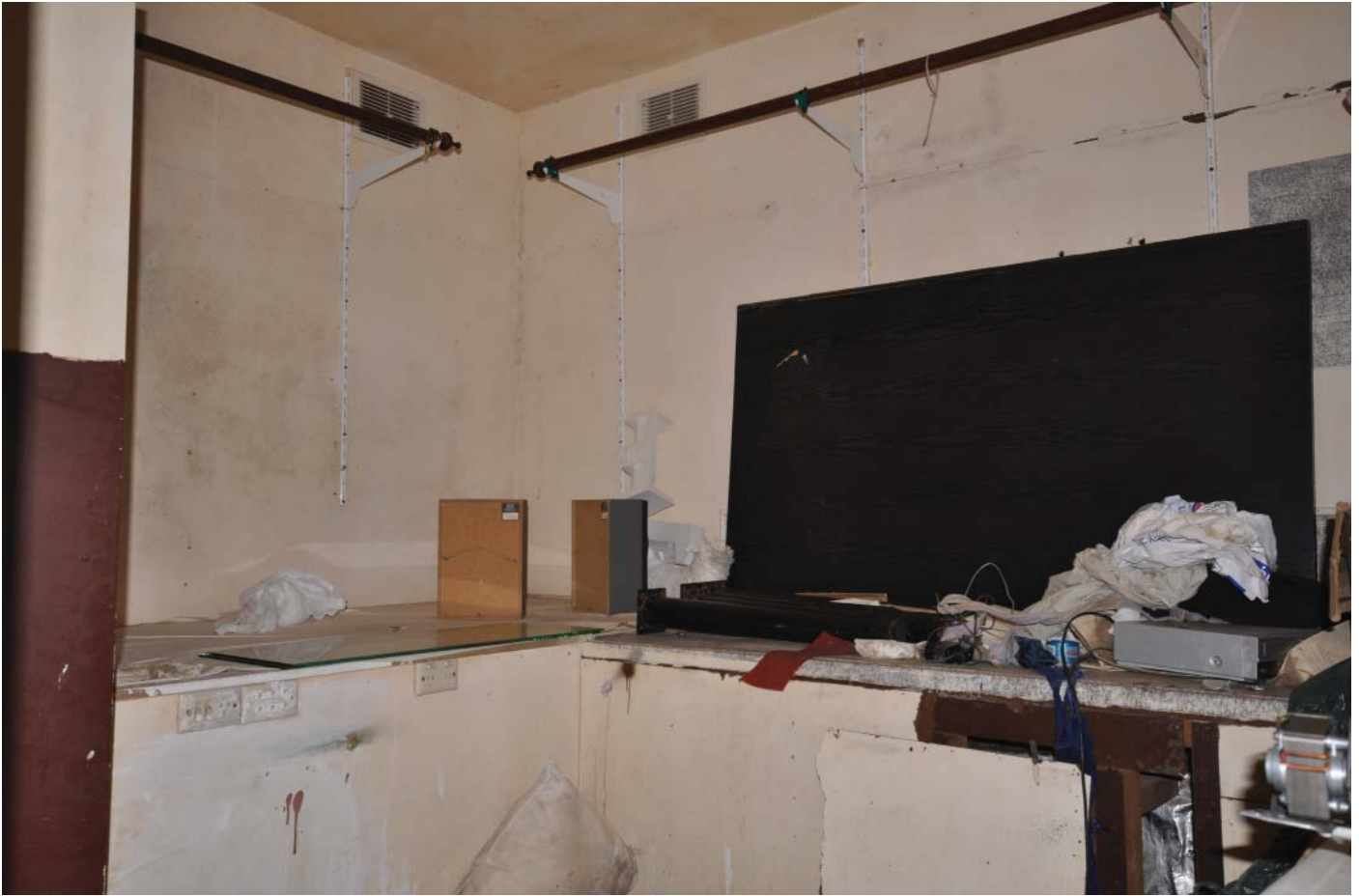
LG04 HOBBY ROOM 01