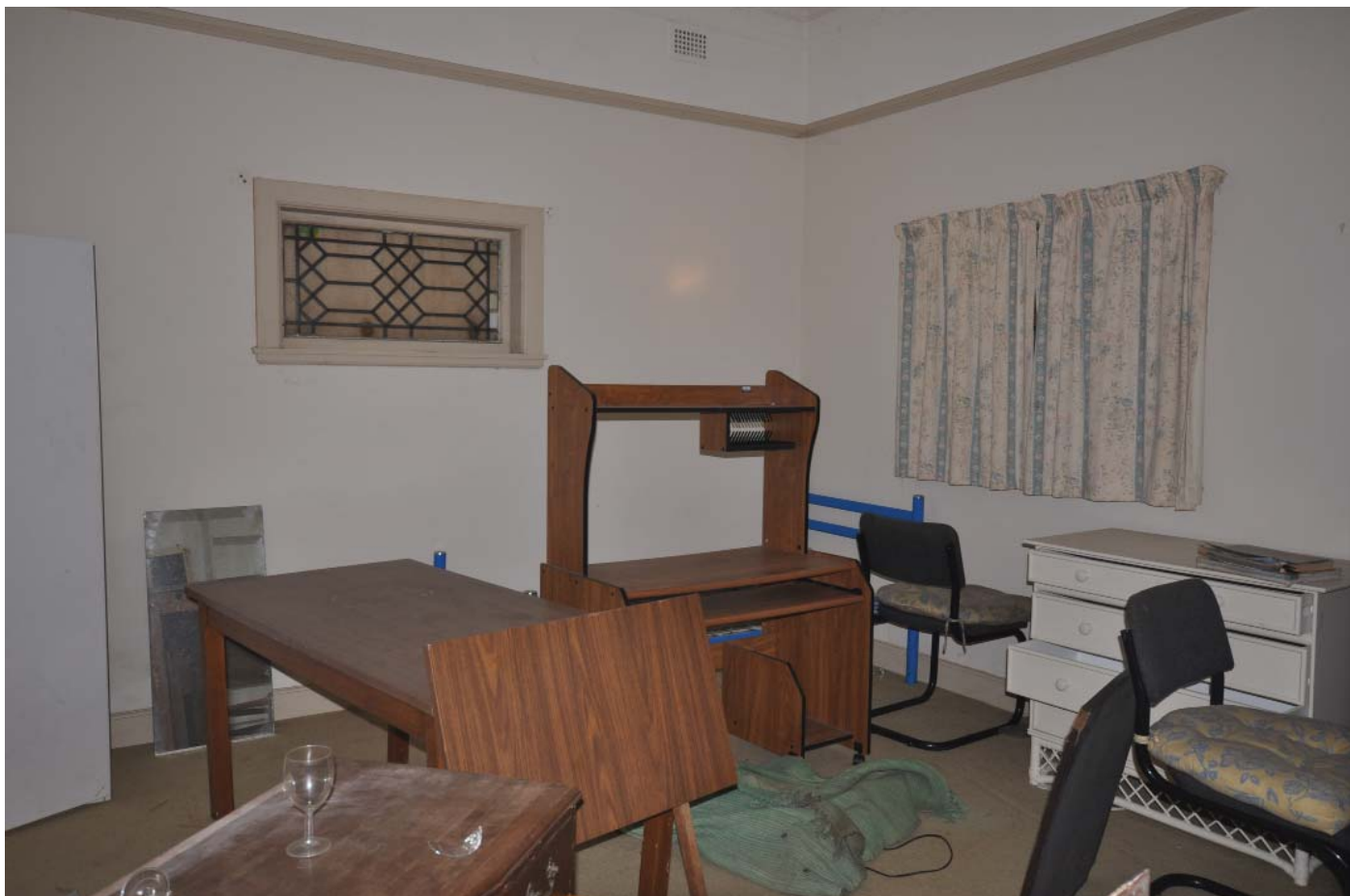
G08 BEDROOM 01