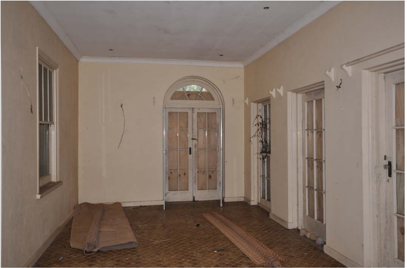
LG08 DINING ROOM 01