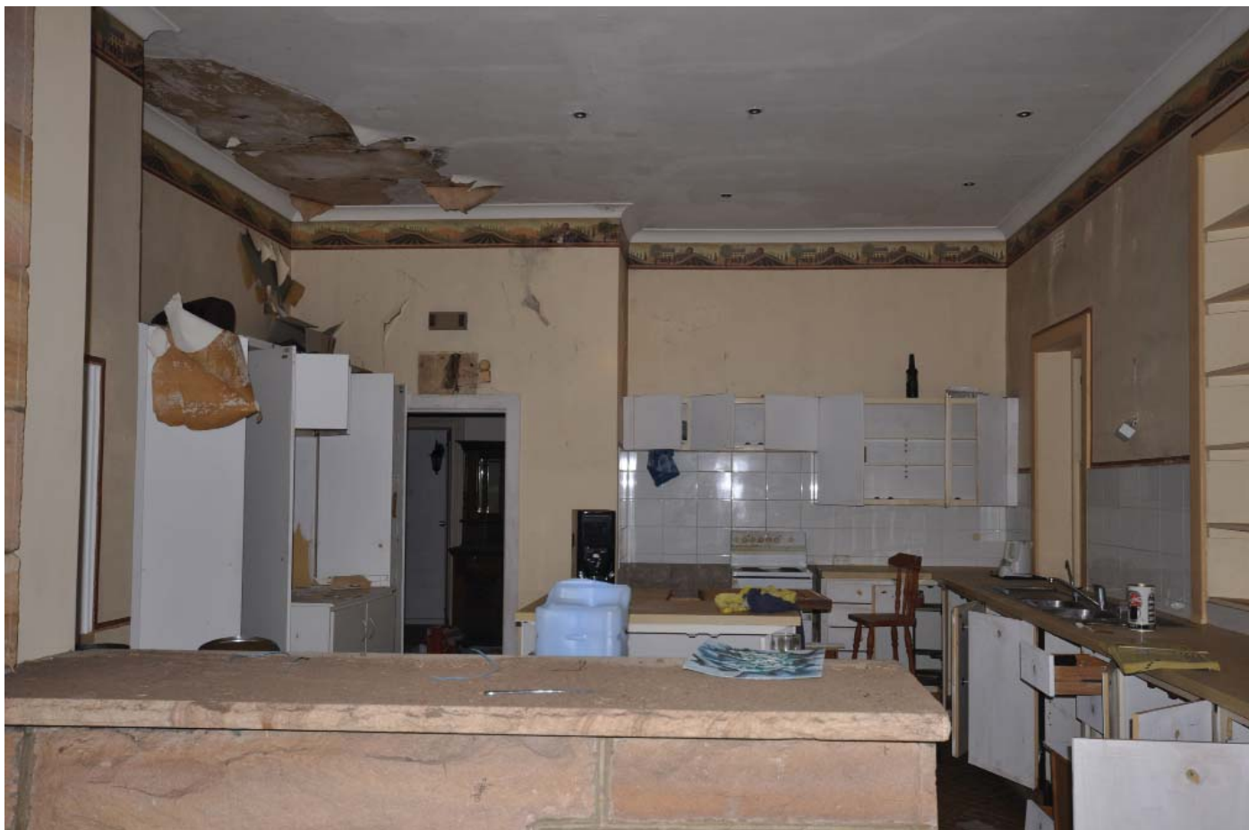
LG07 KITCHEN 01