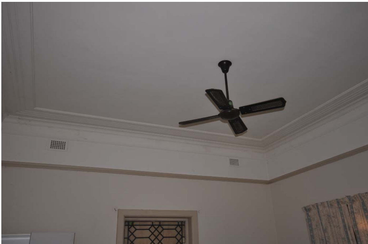
G08 BEDROOM 02