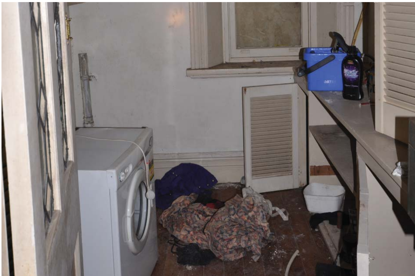
LG06 STORE ROOM 01