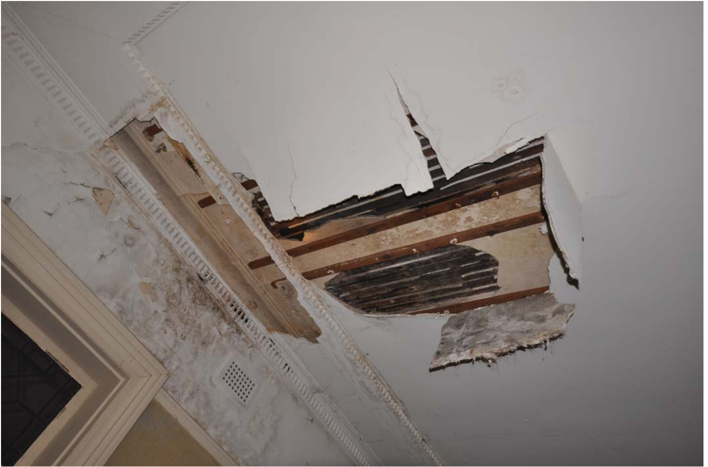
G07 STAIR/HALL 03