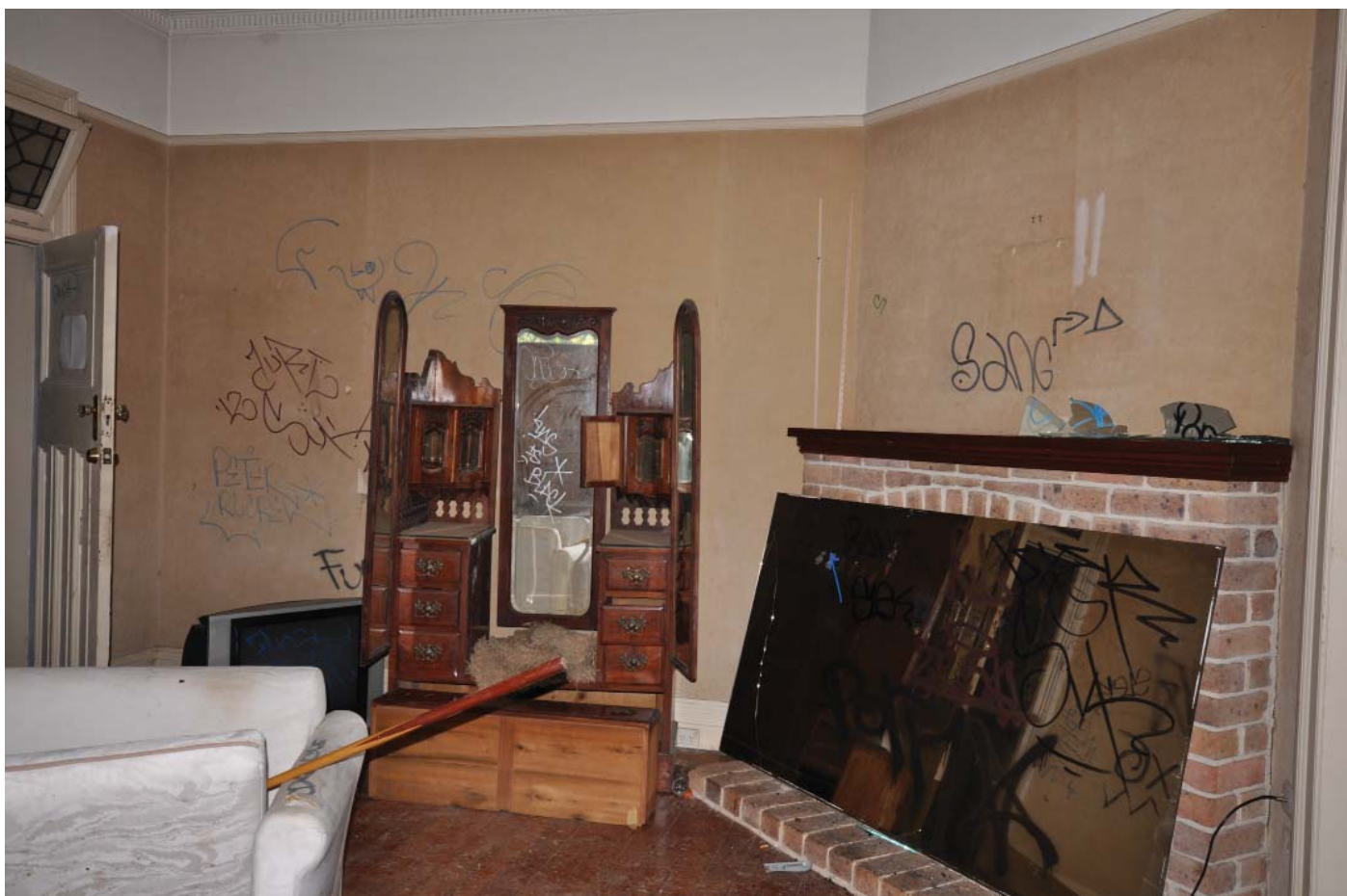
G15 LIVING ROOM 01