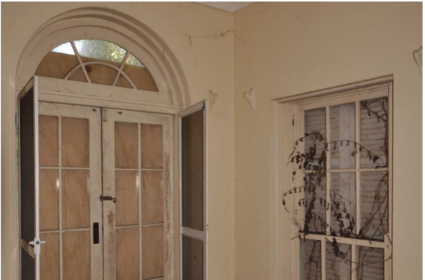
LG08 DINING ROOM 02