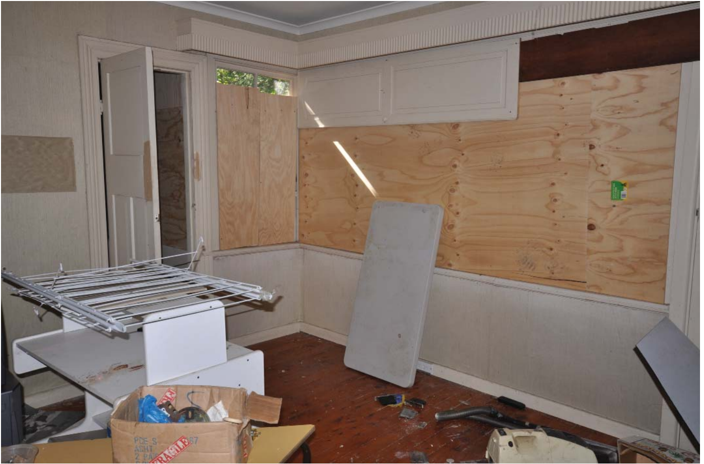
G12 KITCHENETTE/ BAR ROOM 01