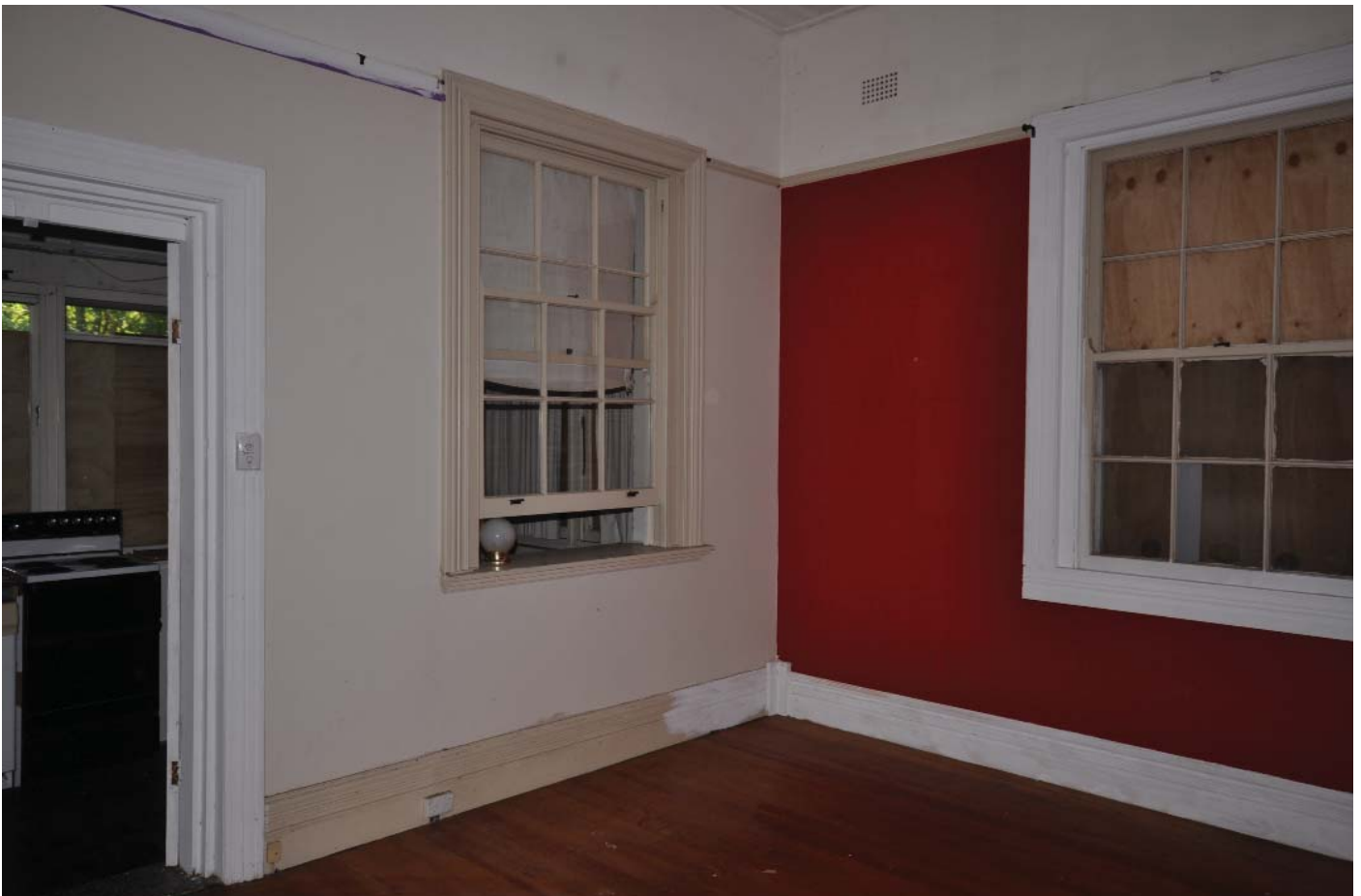
G02 BEDROOM 04