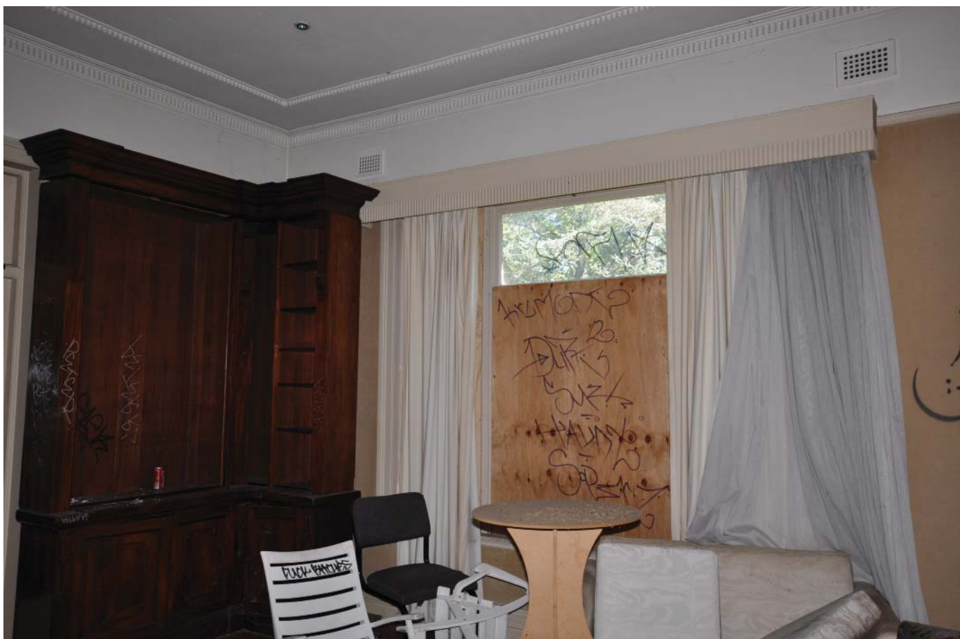
G15 LIVING ROOM 02