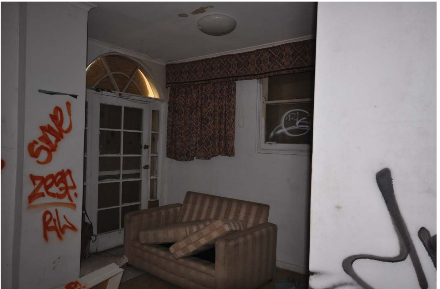
LG01 BEDROOM 02