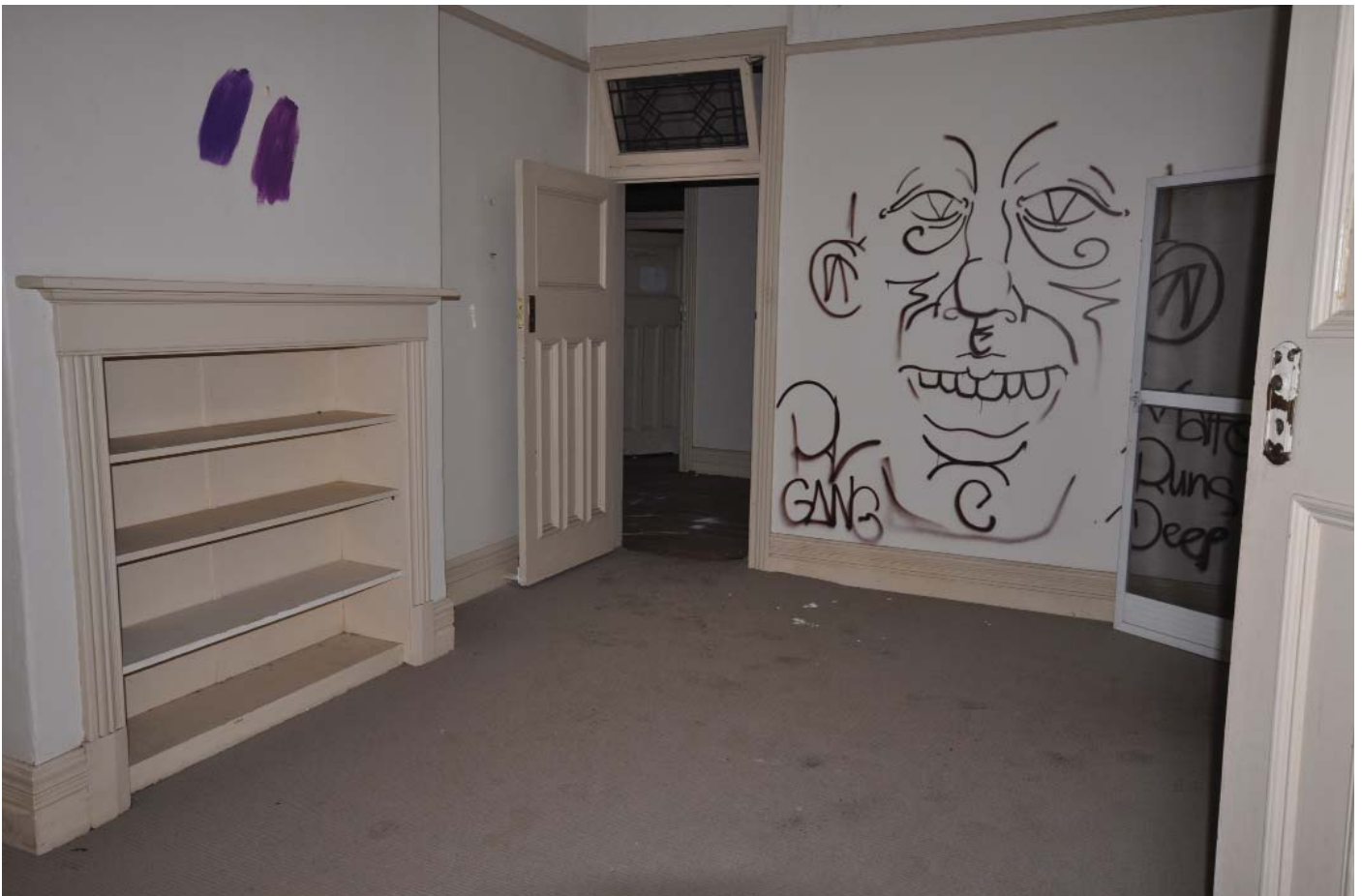
G05 MAIN BEDROOM 02