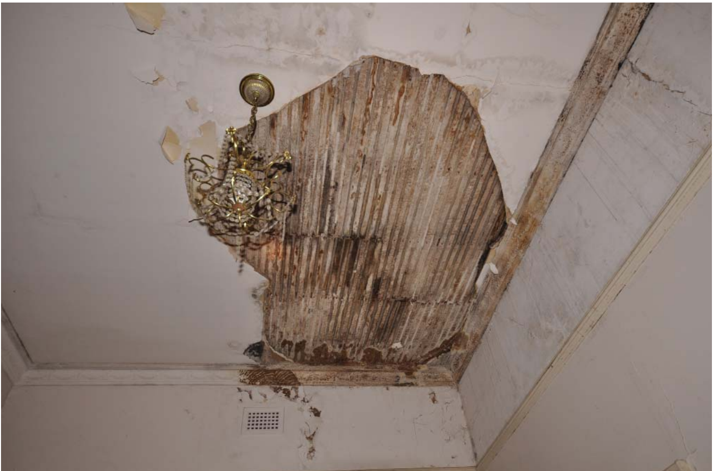
LG04 HOBBY ROOM 02