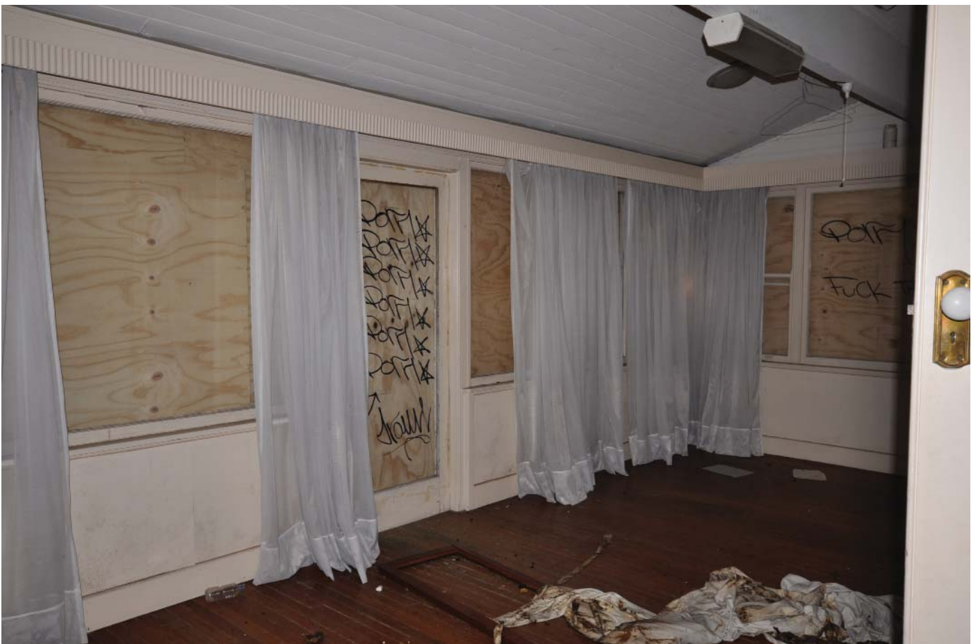
G14 SUNROOM 01