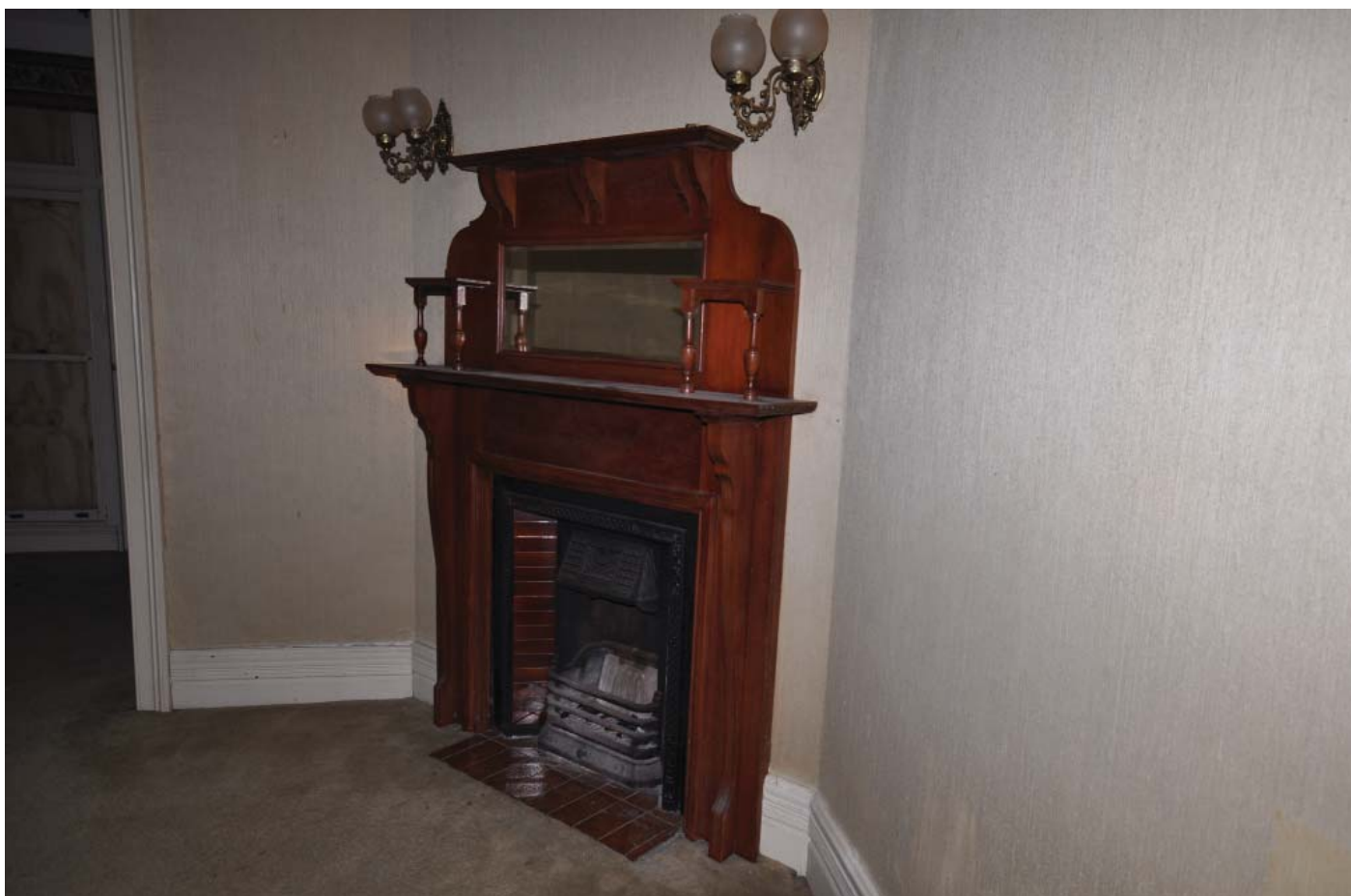
G10 MUSIC ROOM 02