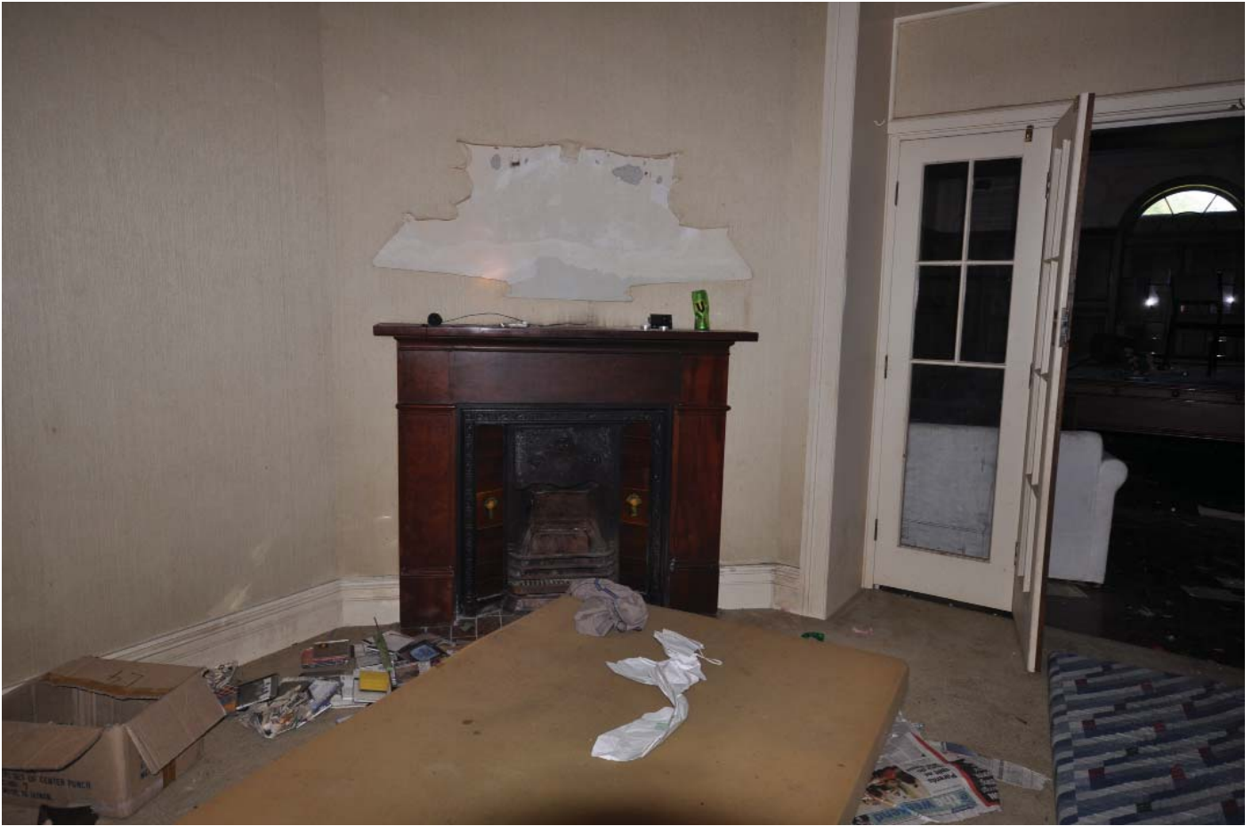
LG12 BEDROOM 01