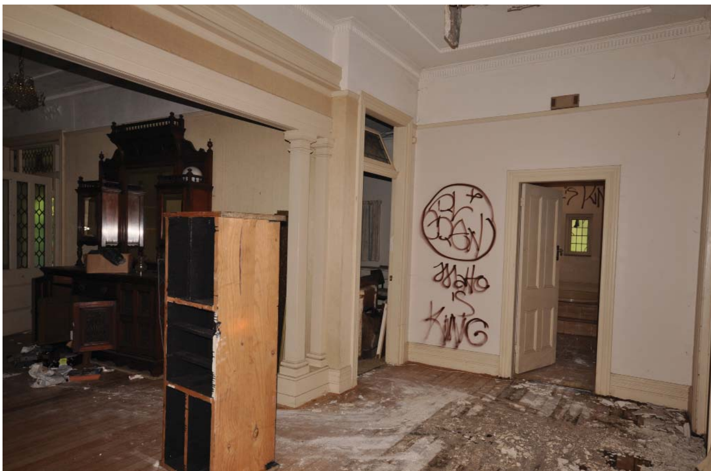
G07 STAIR/HALL 02