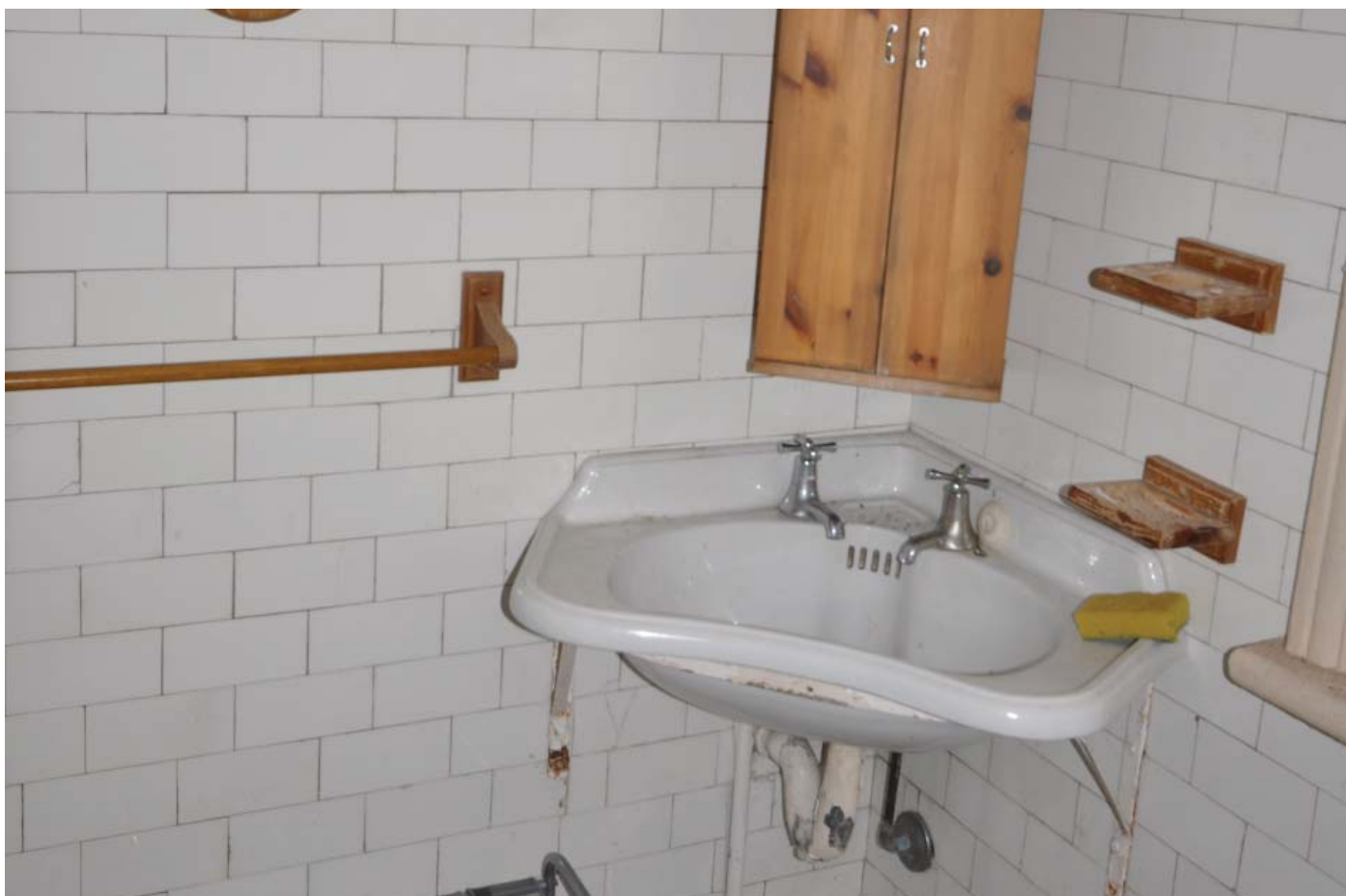
G04 ENSUITE 02