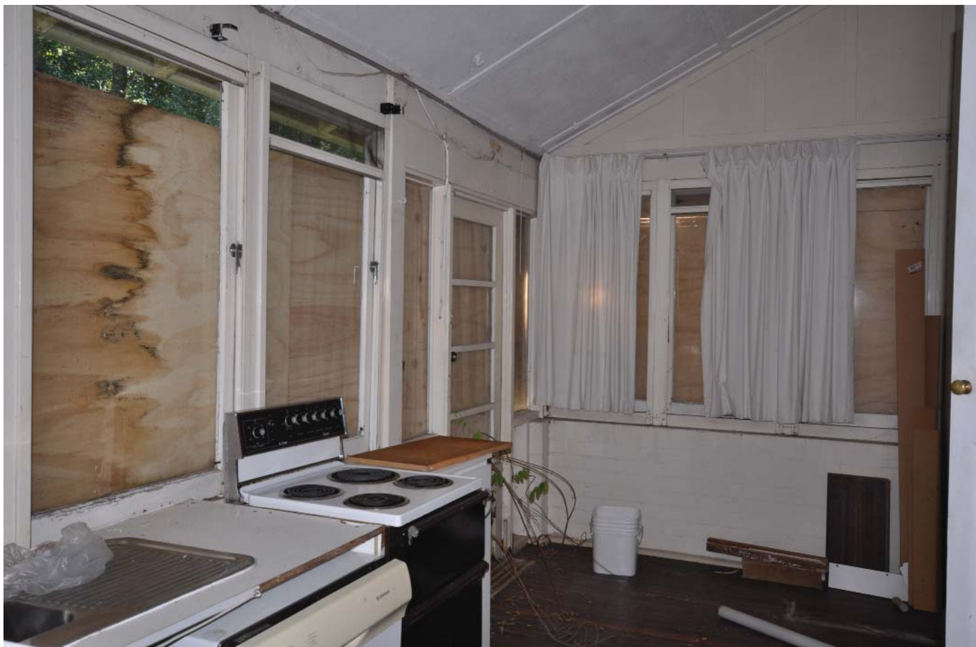
G03 SUNROOM 01