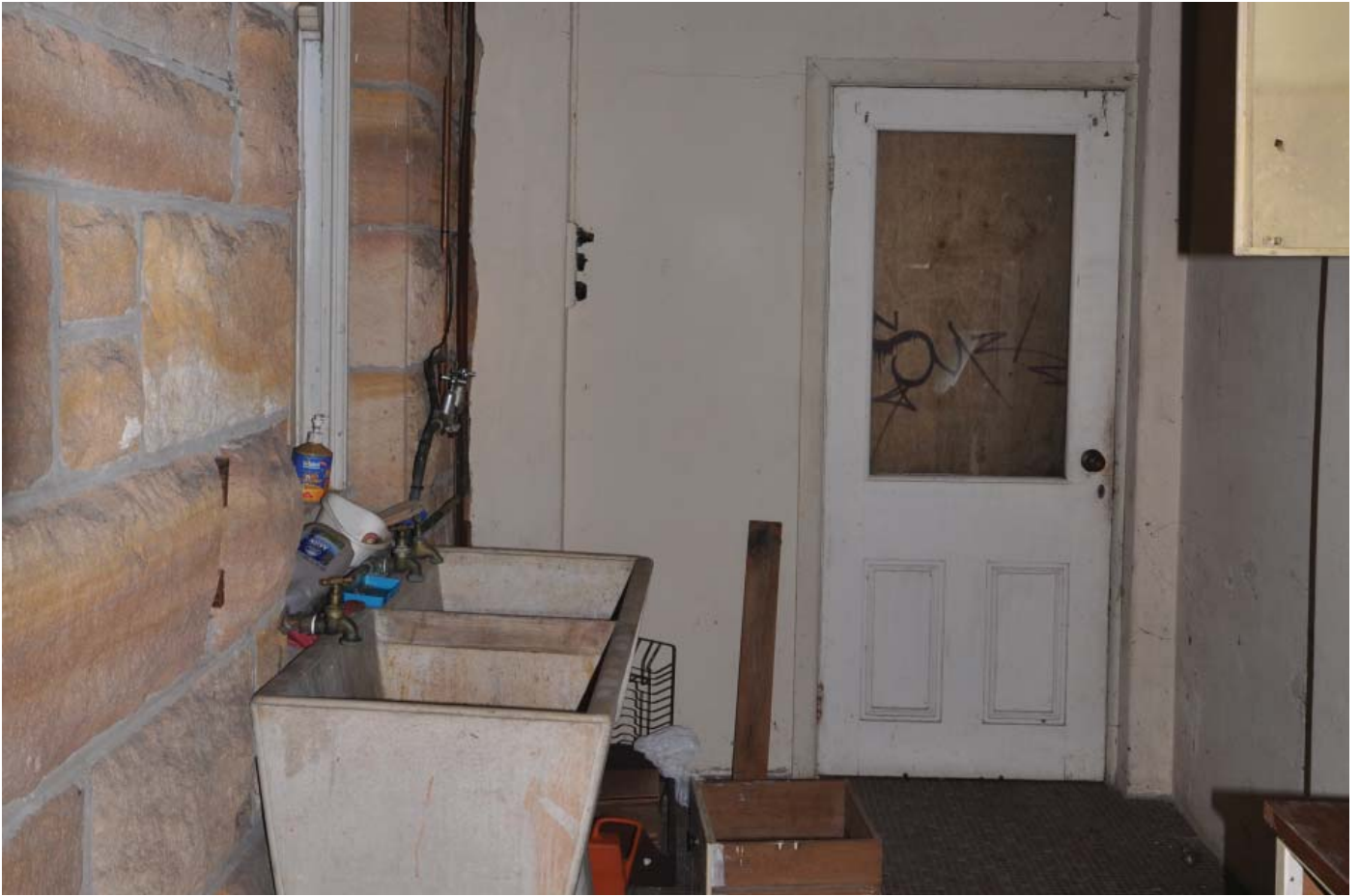
LG09 LAUNDRY 01