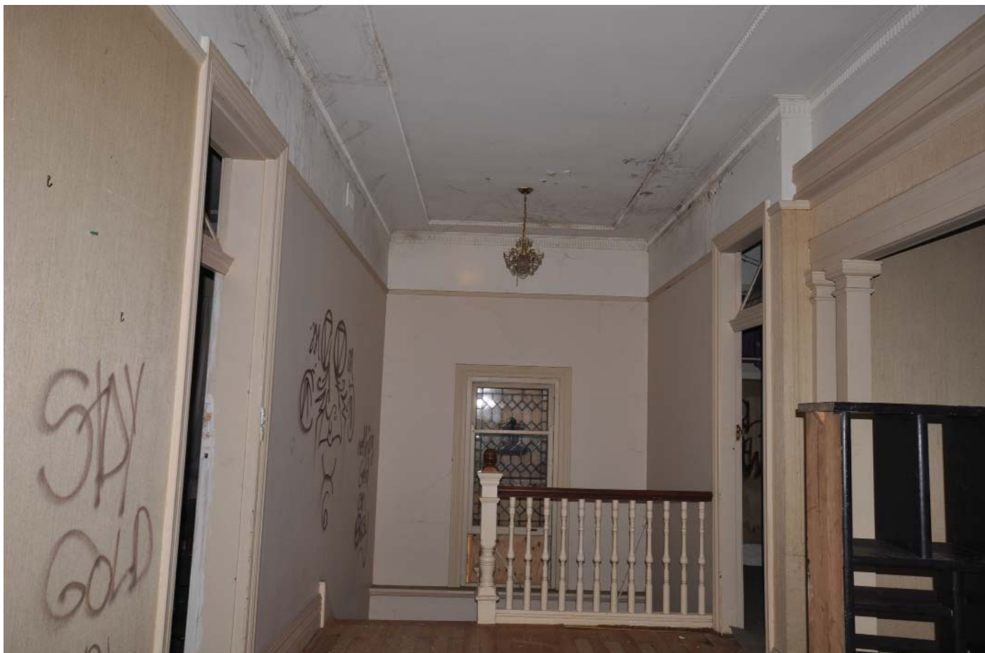
G07 STAIR/HALL 01