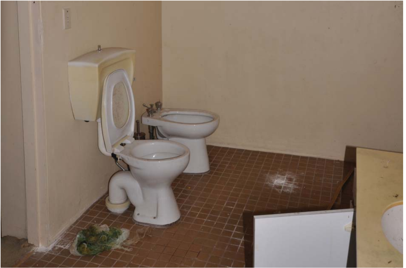
G11 BATHROOM 01