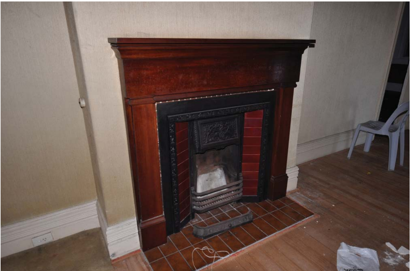
G06 ENTRY FOYER 02