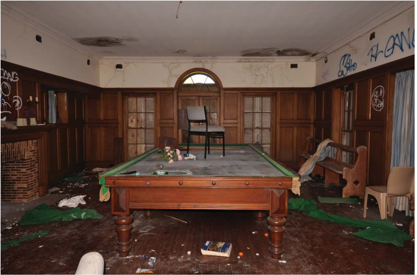
LG13 GAMES ROOM 01