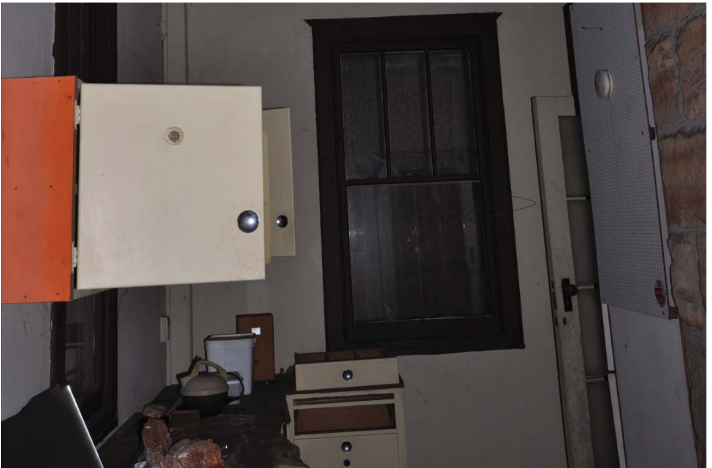
LG09 LAUNDRY 02