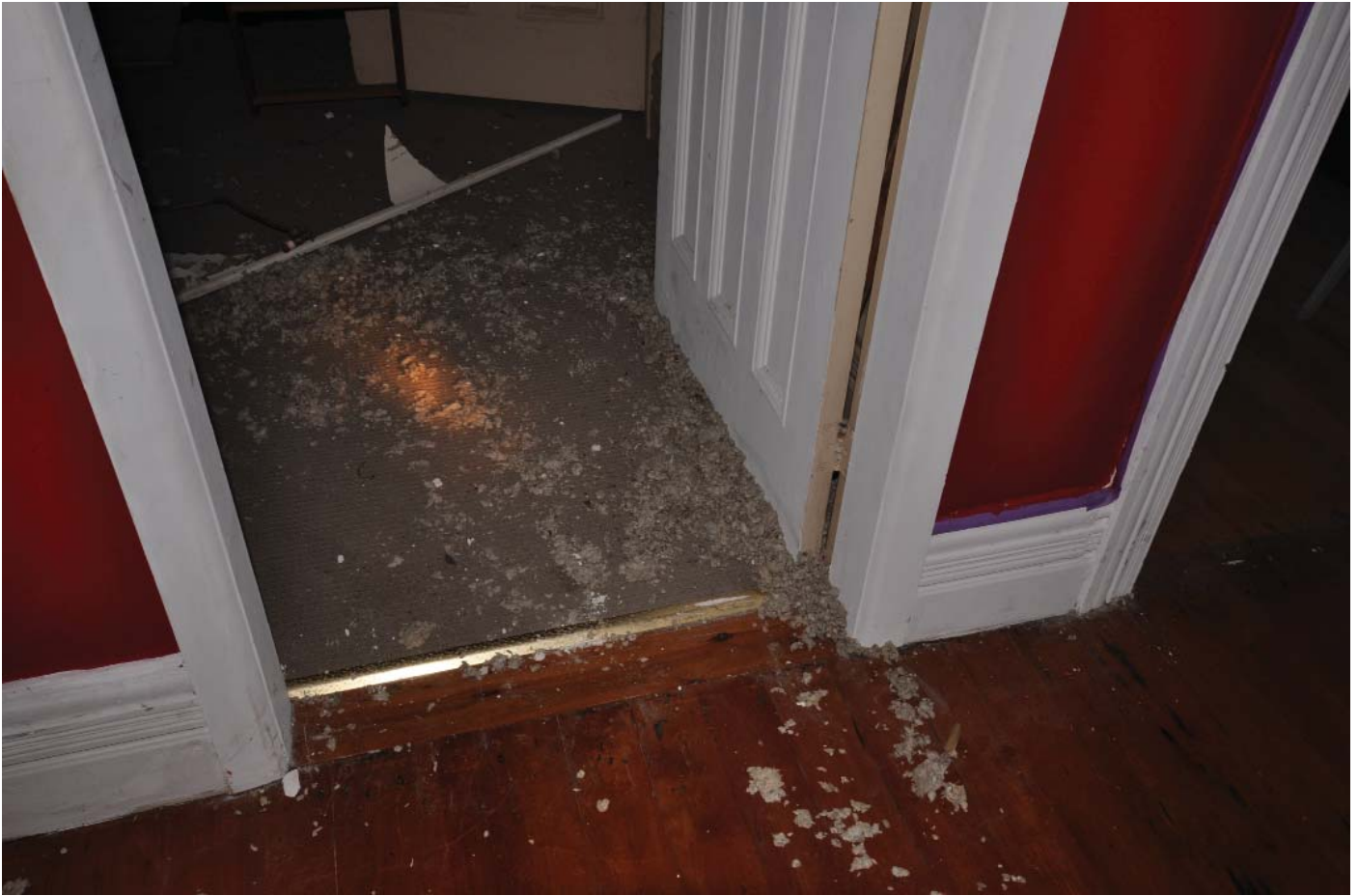
G02 BEDROOM 03