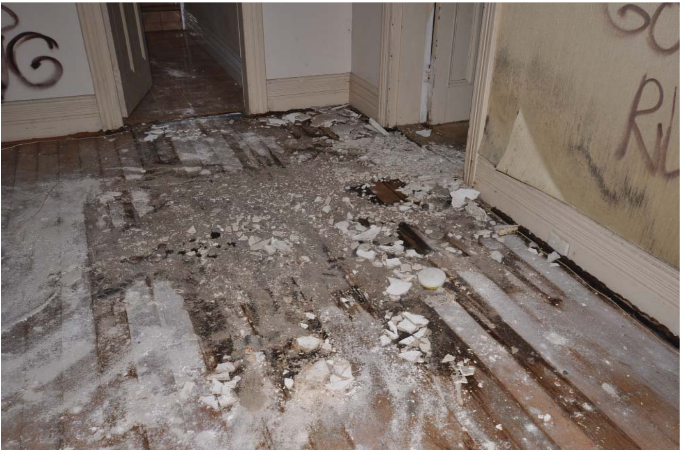
G07 STAIR/HALL 04