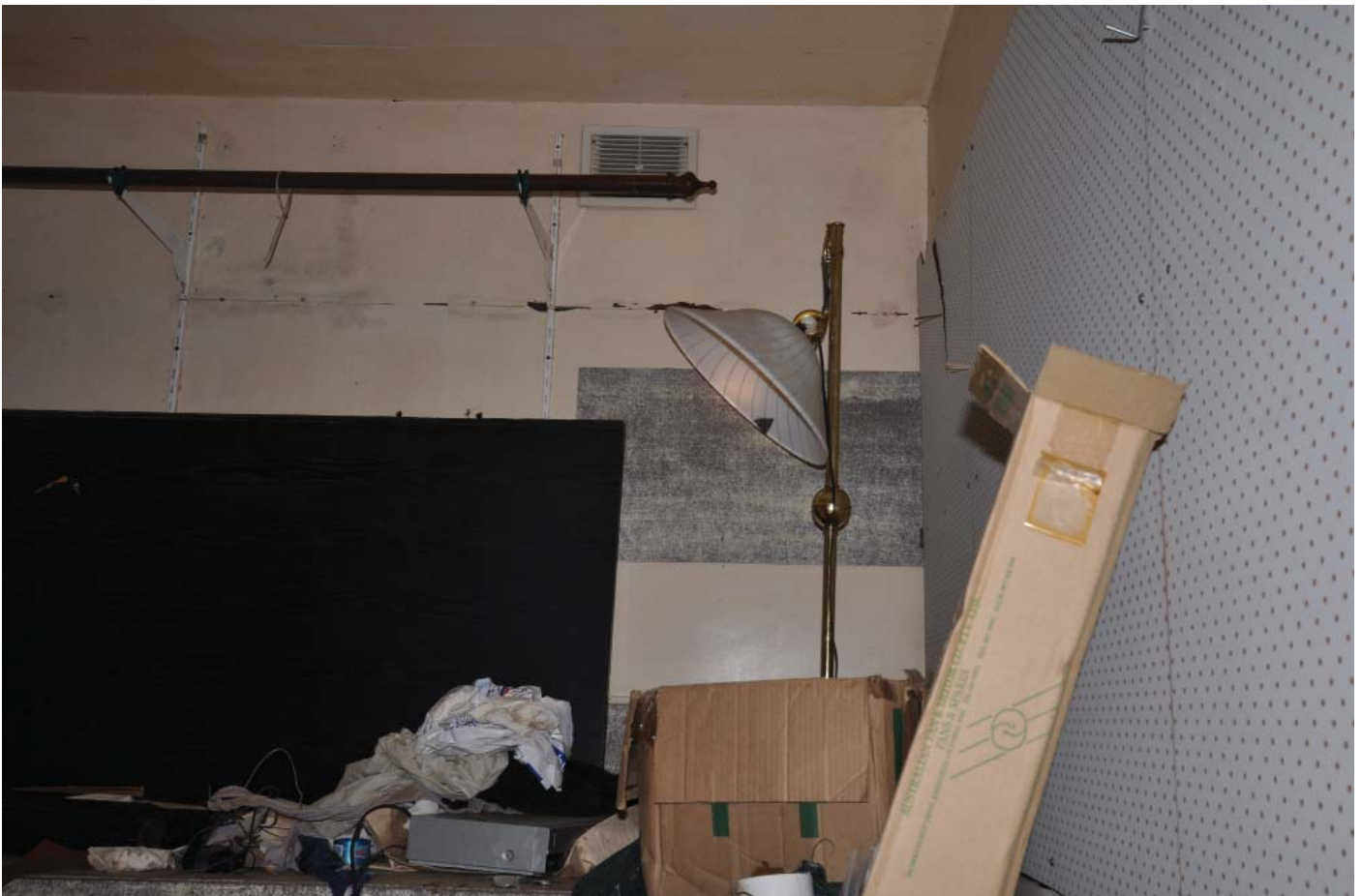
LG04 HOBBY ROOM 02