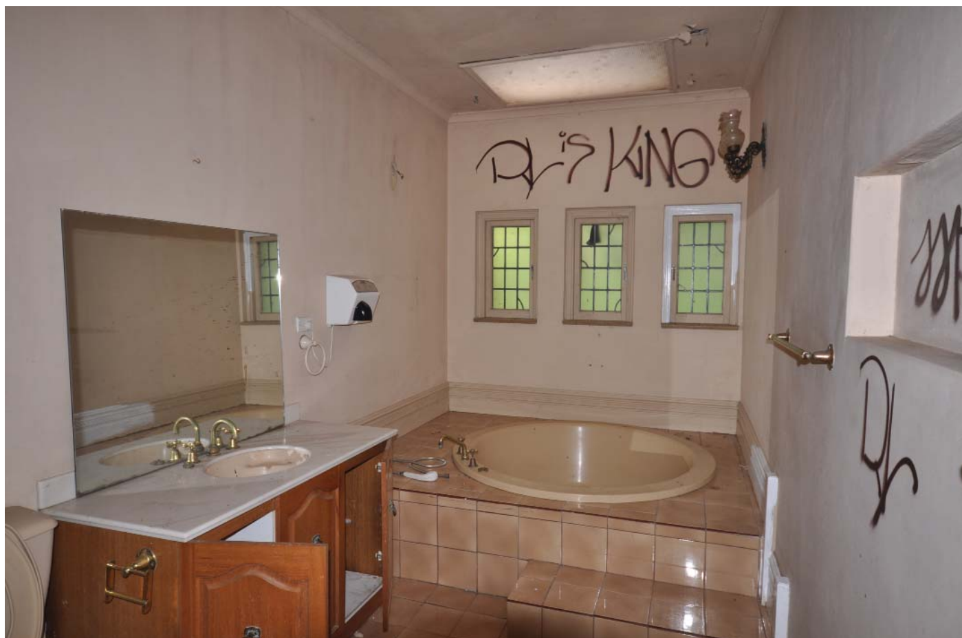
G09 BATHROOM 01