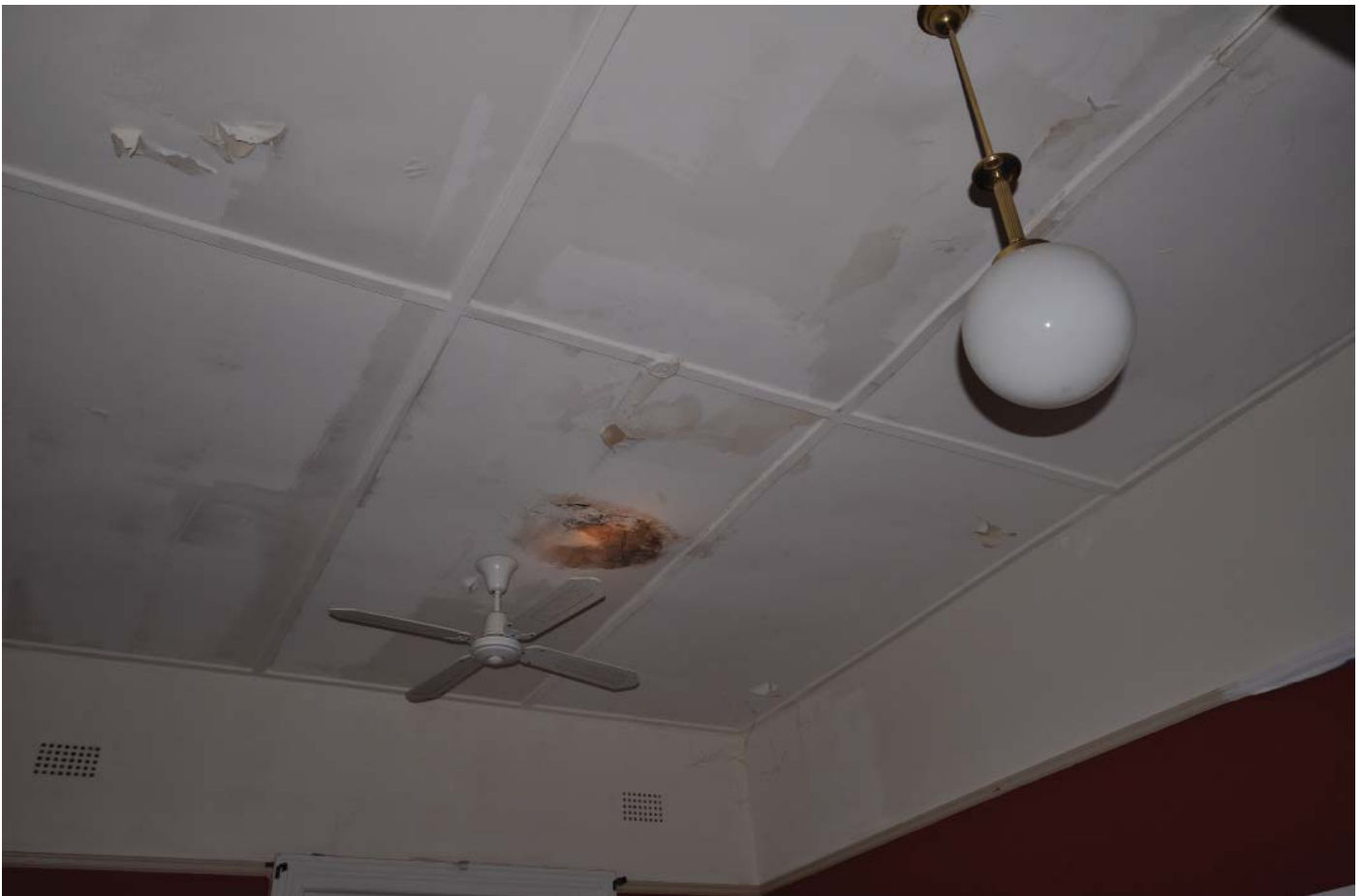
G02 BEDROOM 02