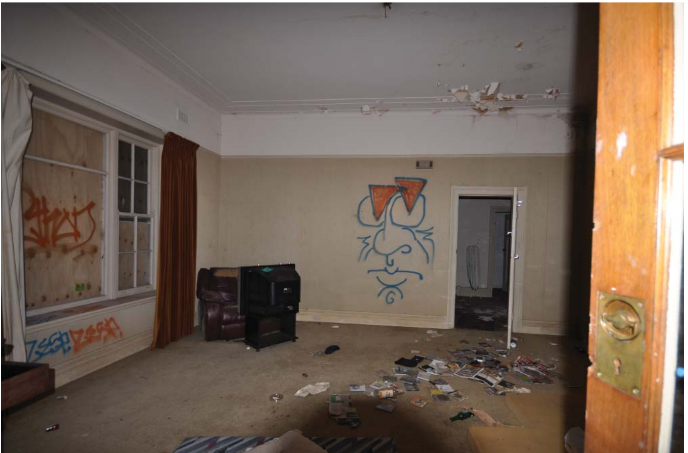
LG12 BEDROOM 02