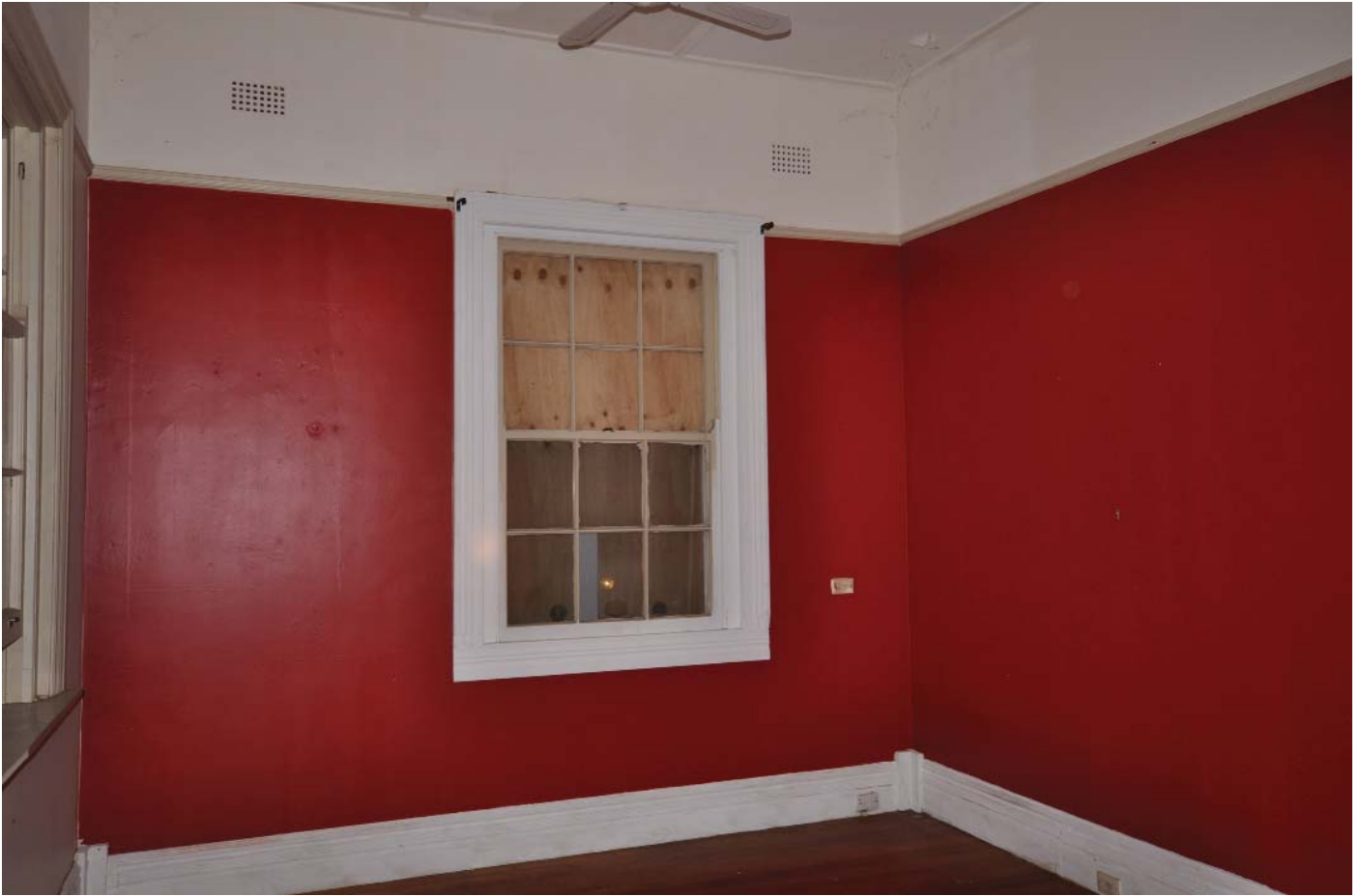
G02 BEDROOM 01