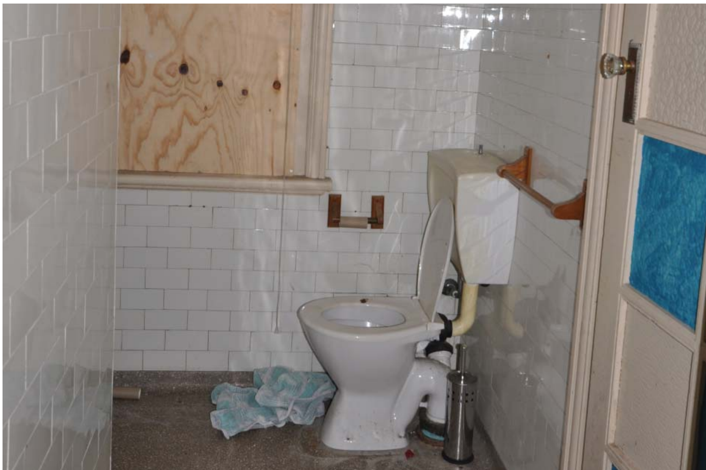
G04 ENSUITE 01