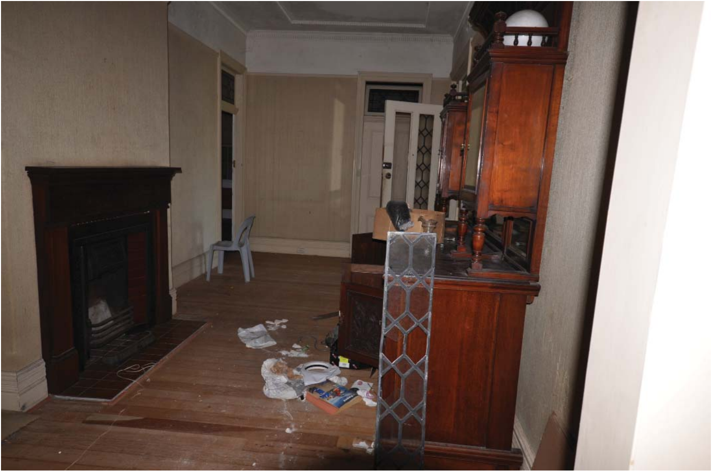
G06 ENTRY FOYER 01