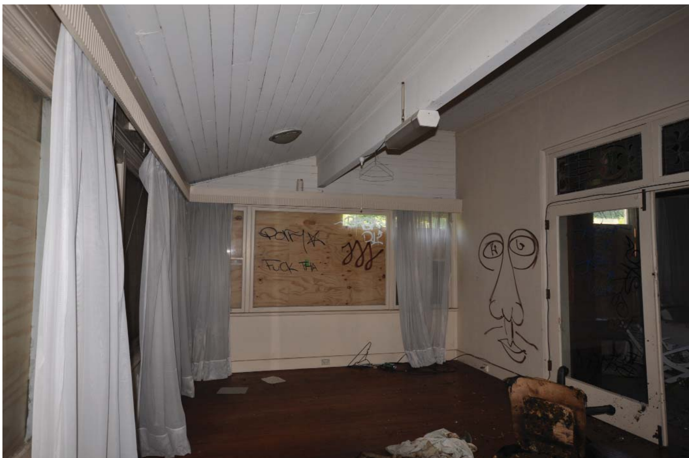
G14 SUNROOM 03