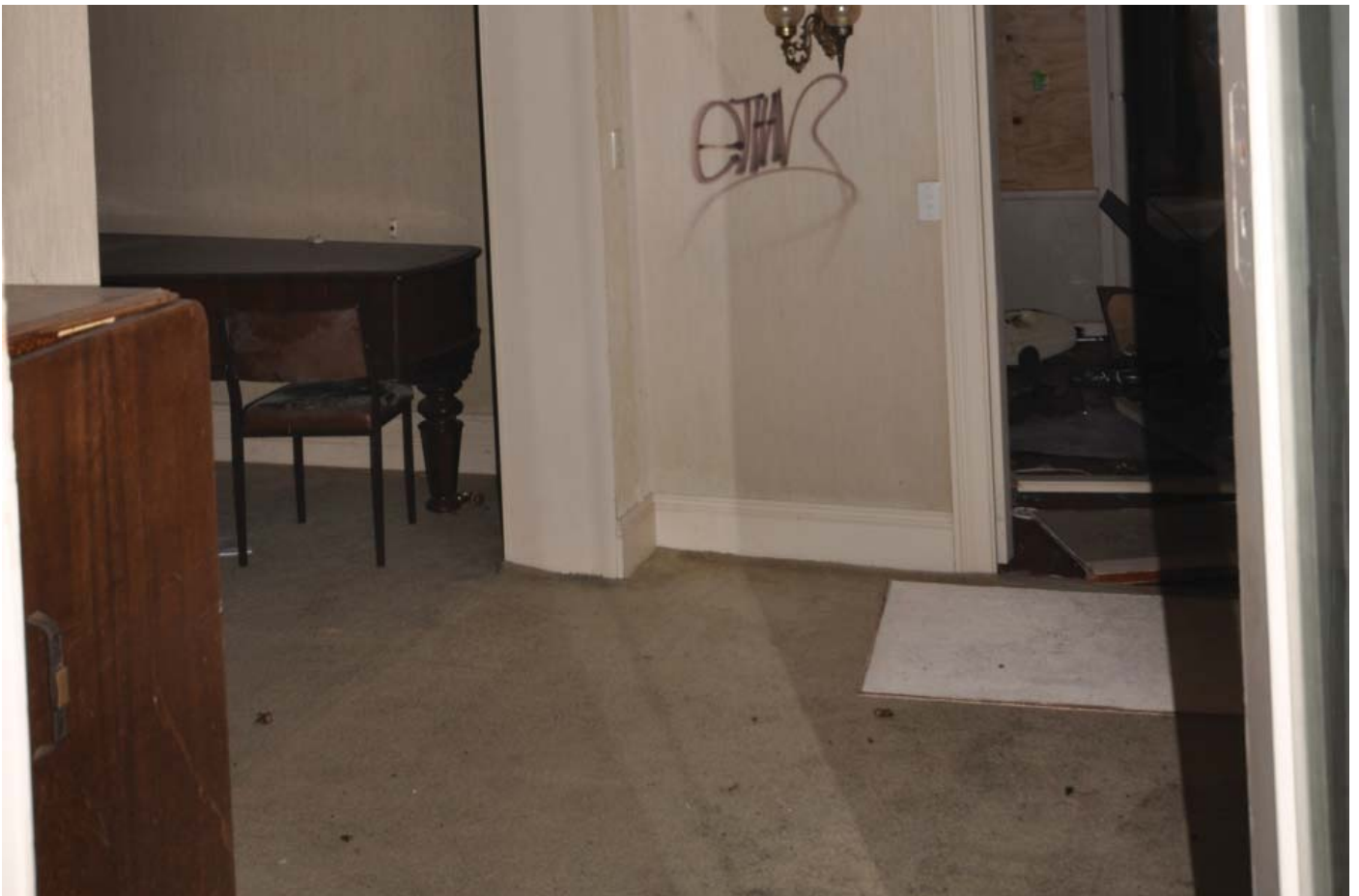
G13 WEST END OF MUSIC ROOM