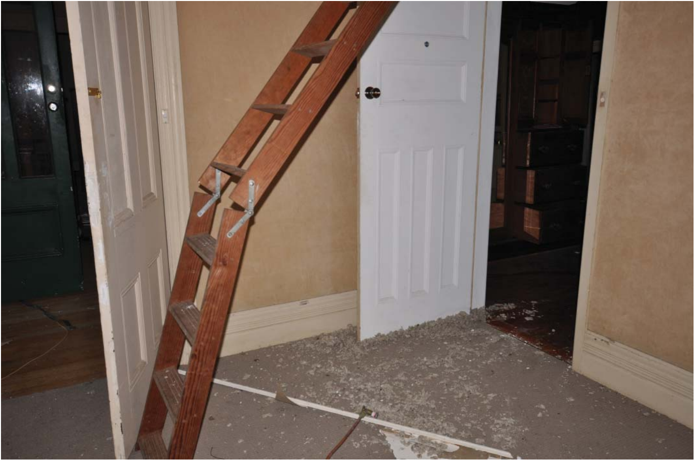
G01 STUDY 01