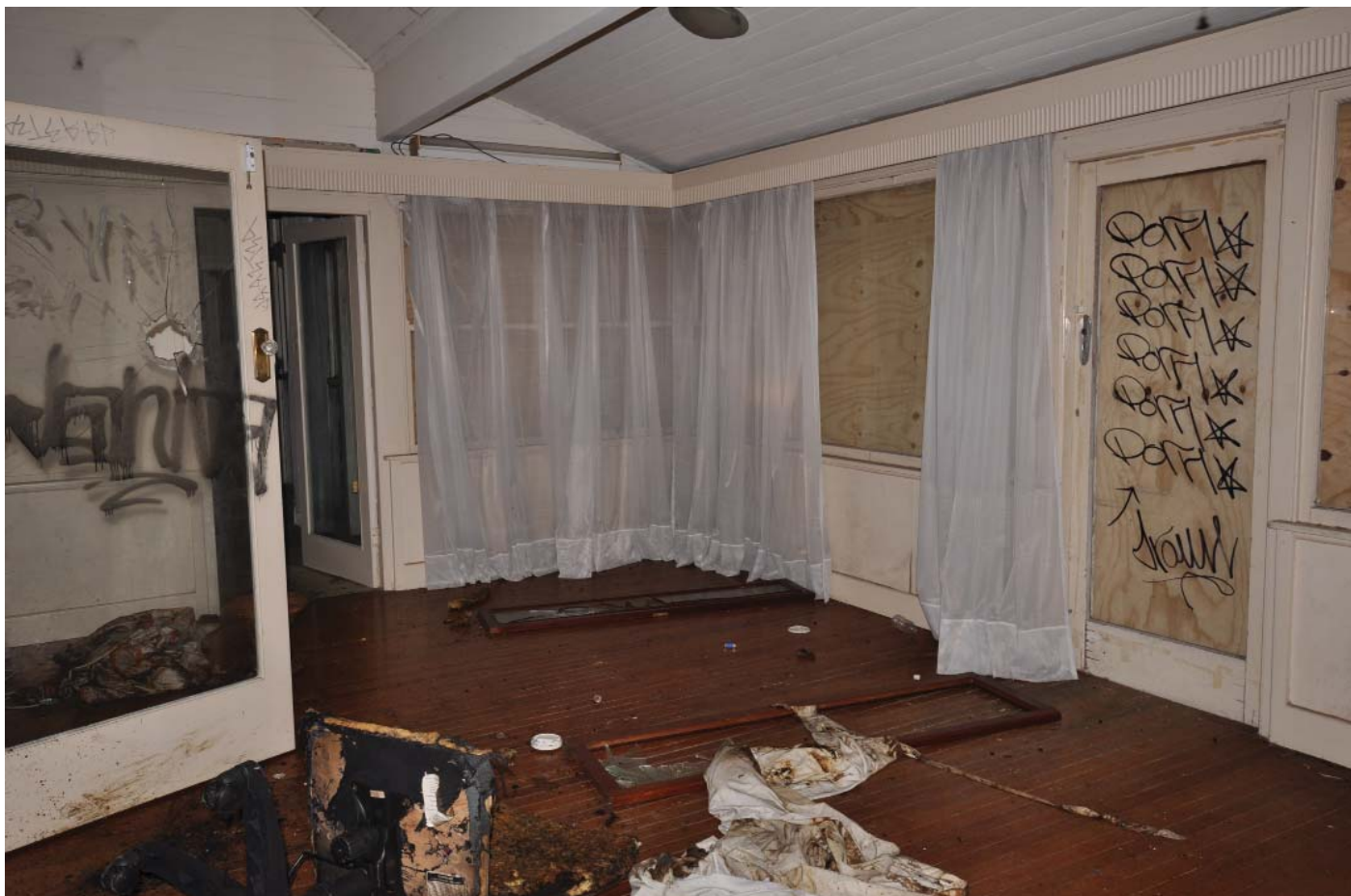
G14 SUNROOM 02