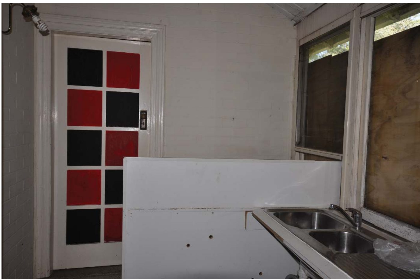
G03 SUNROOM 02