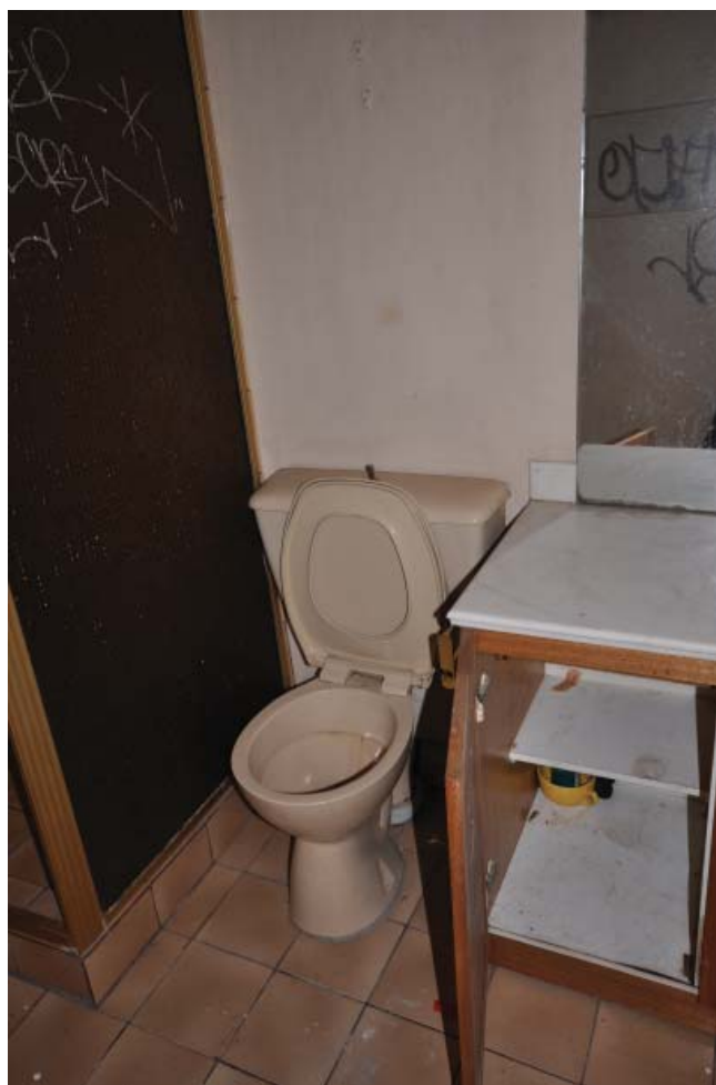
G09 BATHROOM 02