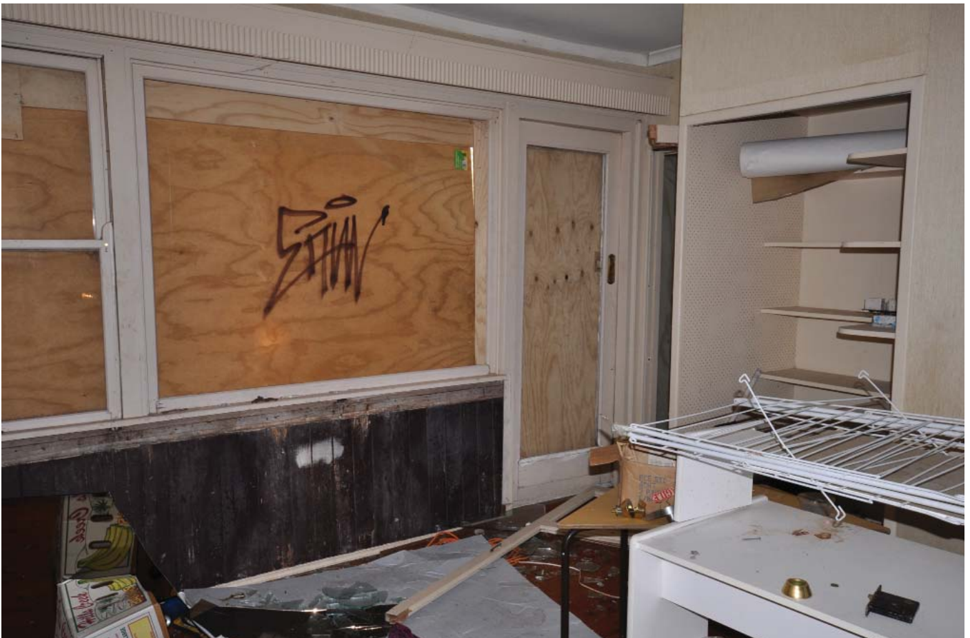
G12 KITCHENETTE/ BAR ROOM 02