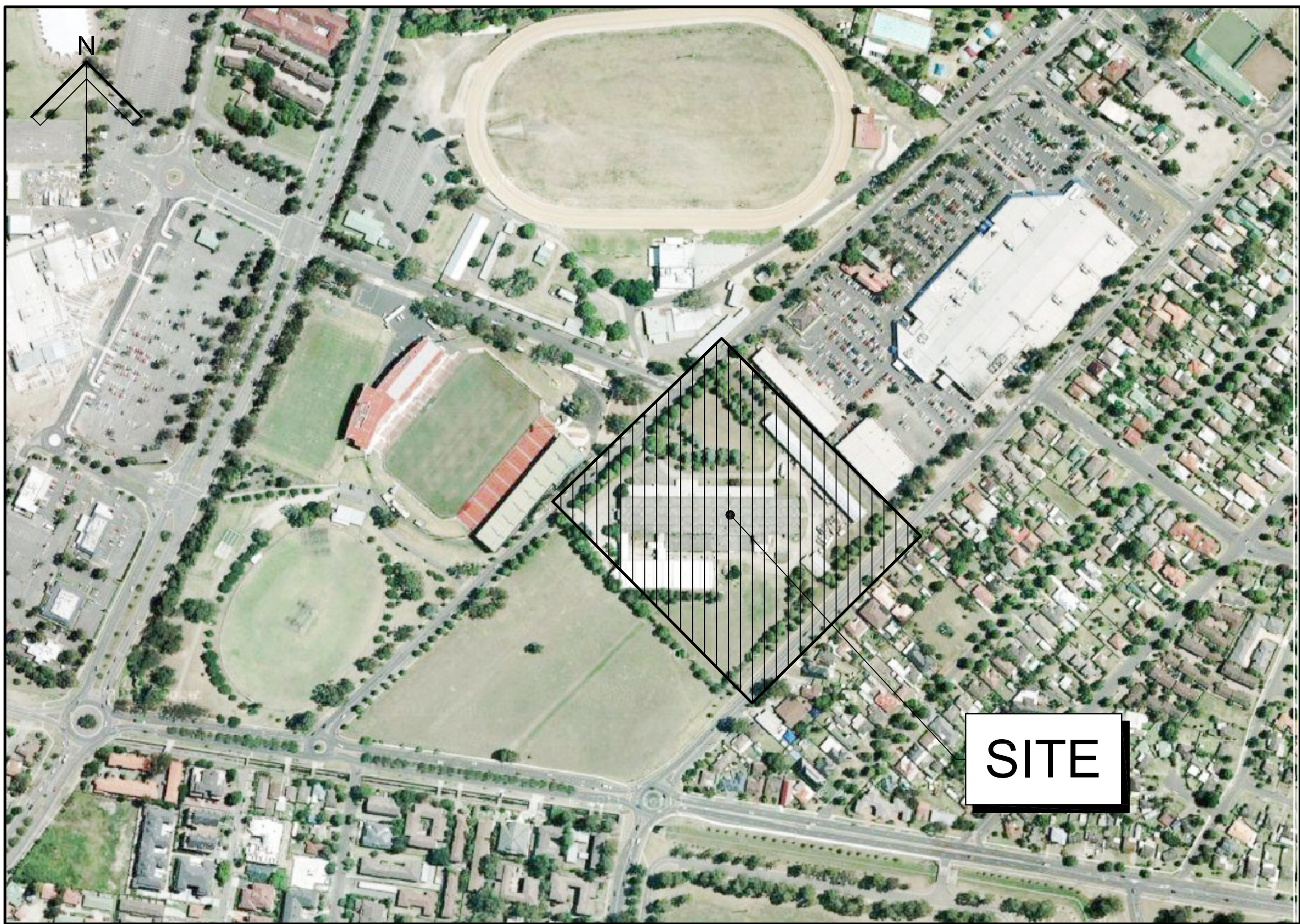
PENRITH LOCALITY SKETCH Not To Scale