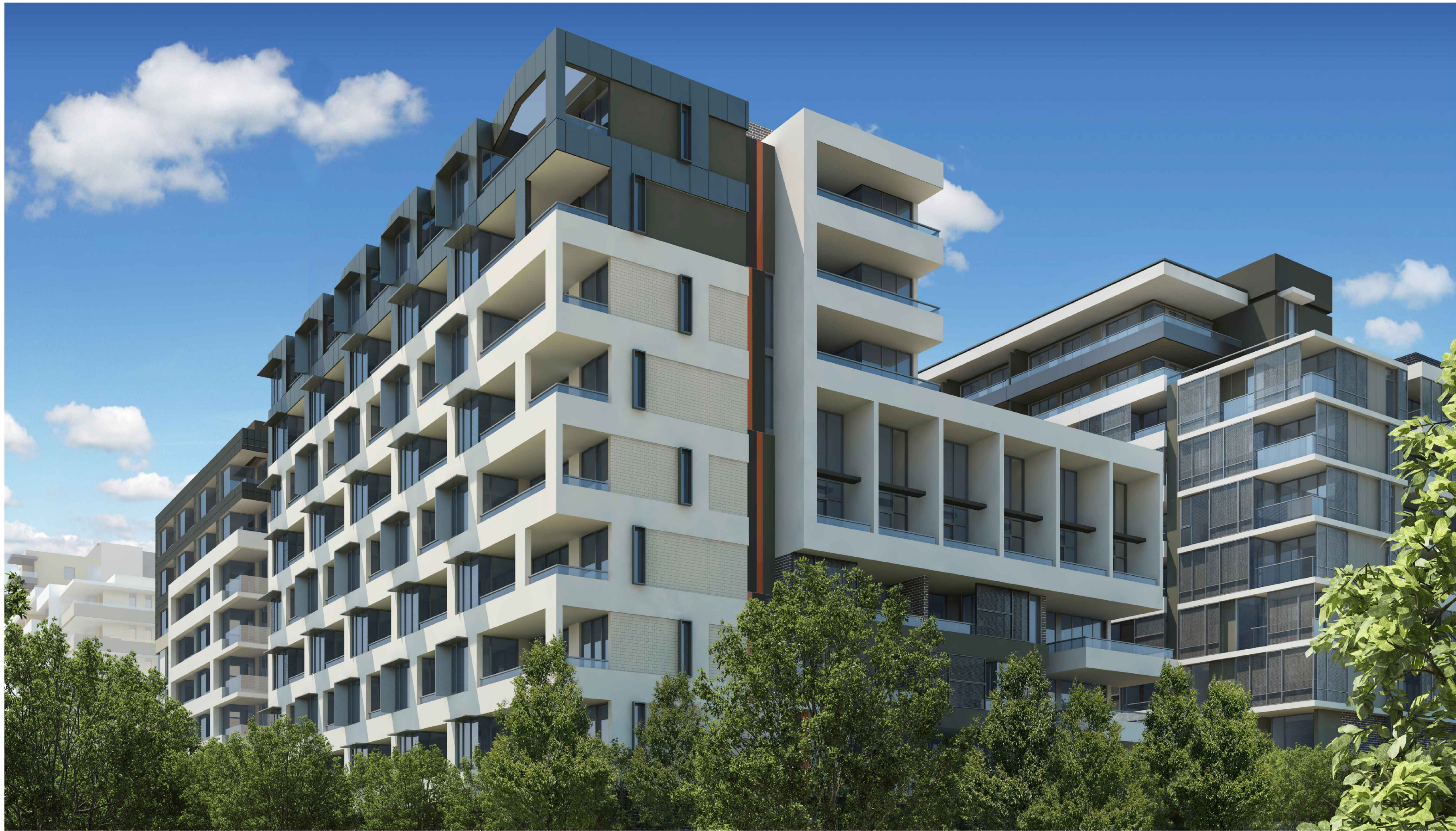
6 VIEW FROM NORTH WEST CORNER NTS