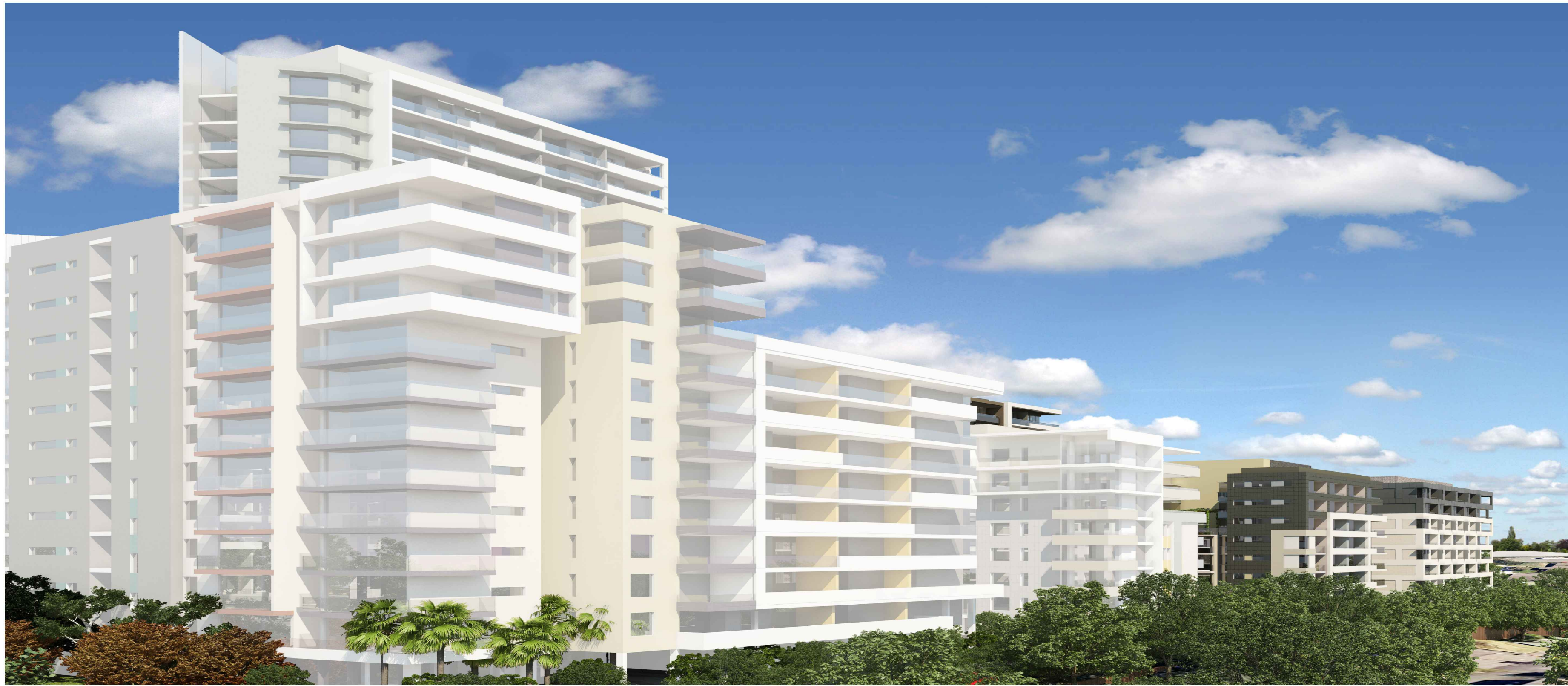
5 VIEW FROM HERRING ROAD LOOKING WEST NTS

NOTE: STAGE 2 BUILDINGS, SHOWN GHOSTED, DO NOT FORM PART OF THIS SUBMISSION