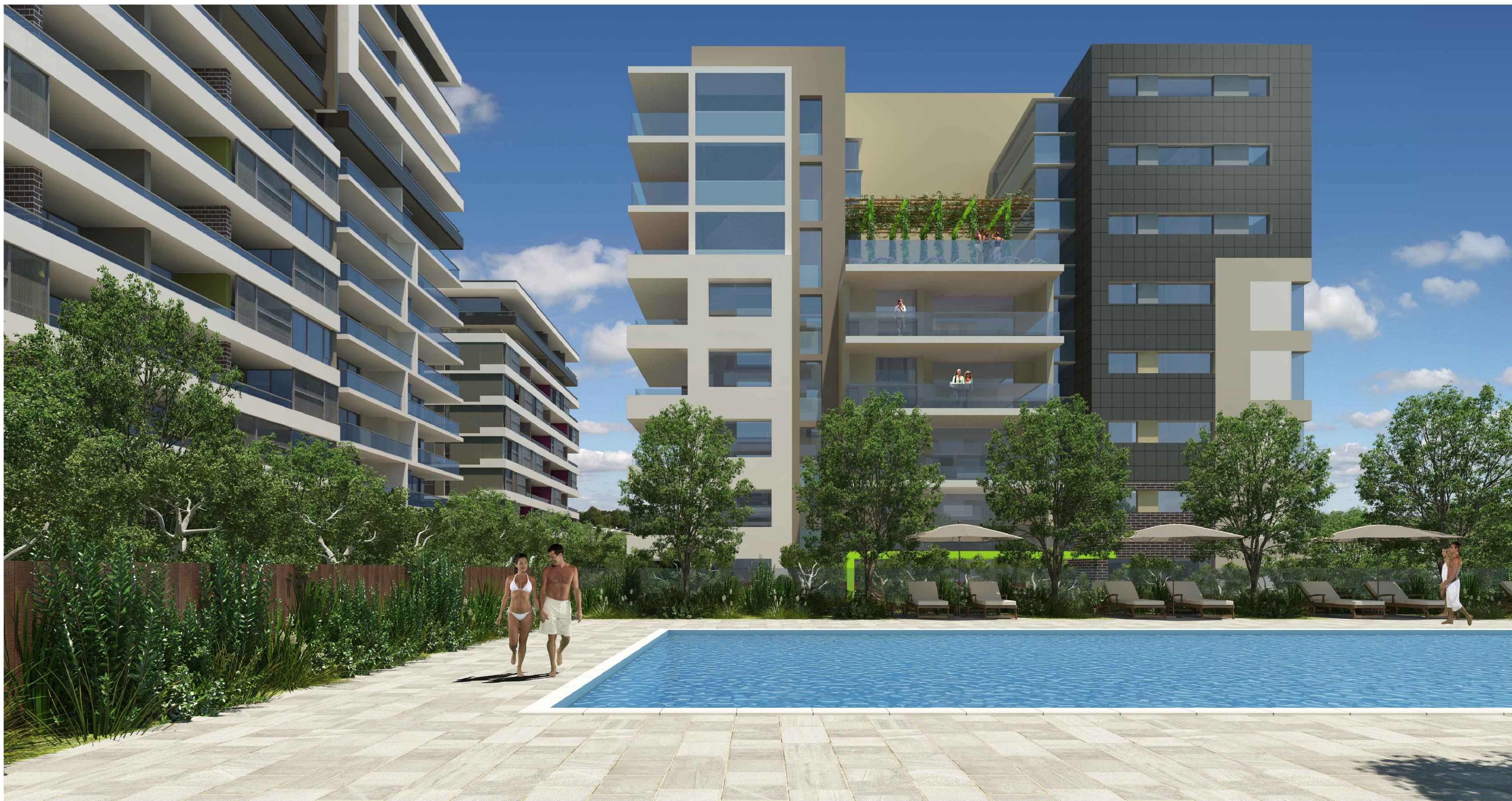
8 VIEW OVER POOL GARDEN LOOKING NORTH WEST NTS