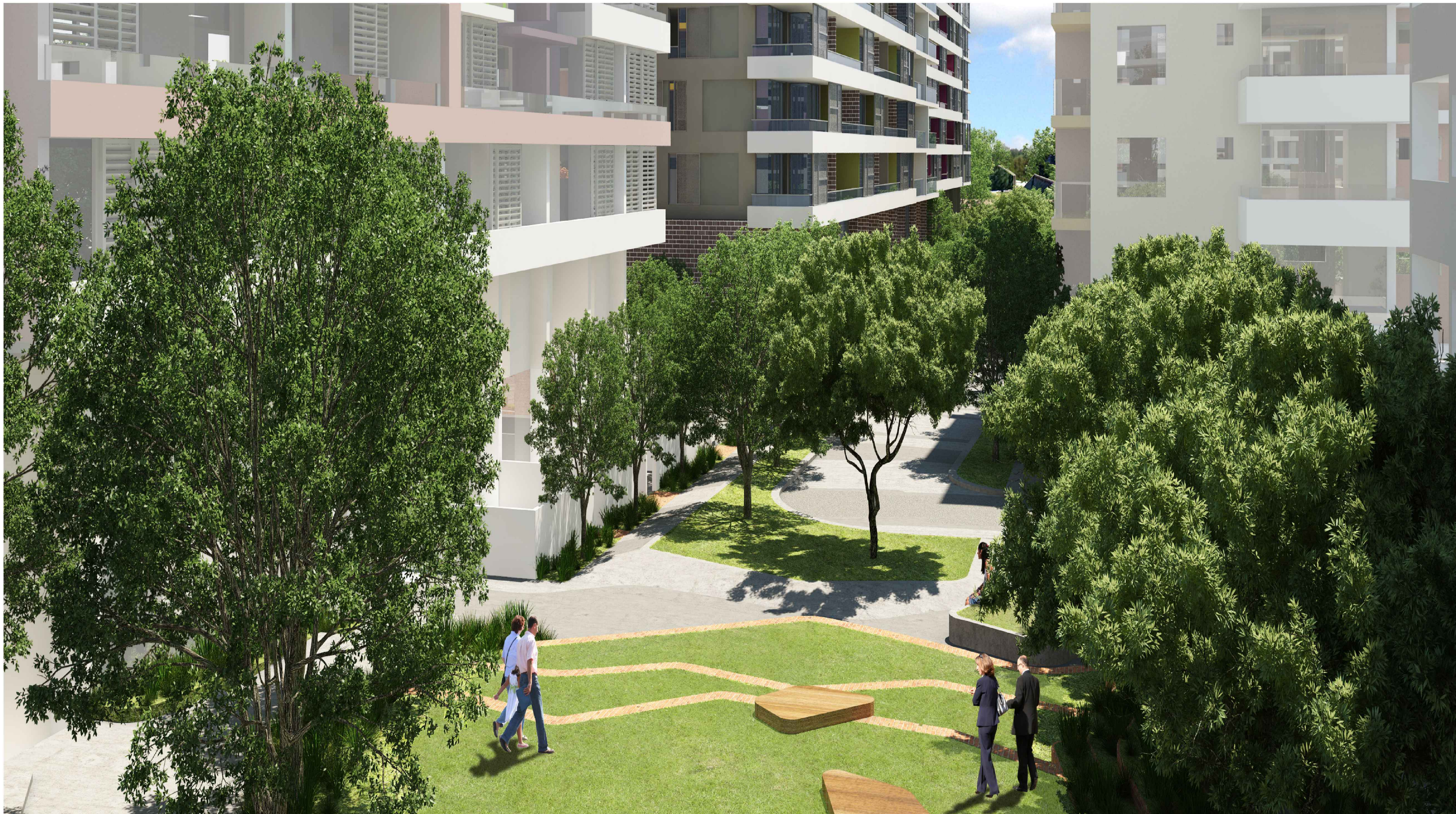
8 INTERNAL VIEW LOOKING WEST NTS