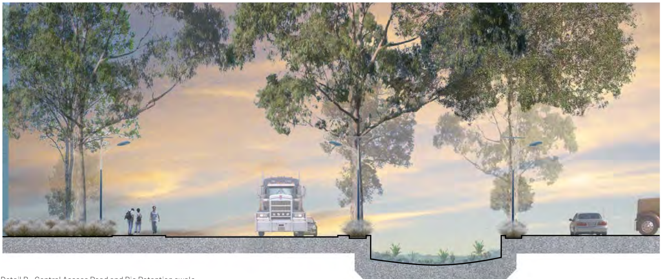
Detail B - Central Access Road and Bio Retention swale

Whilst achieving a primary function any requirement of water filtration and bio retention, the plantings proposed to the swales are to remain consistent with the overarching site wide objectives of uniform species use, endemic planting character, native landscape language and a variety of experiences and visual connections for the users of the development.