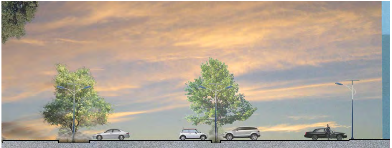
Detail C - Boundary Treatment and Vehicular Carpark