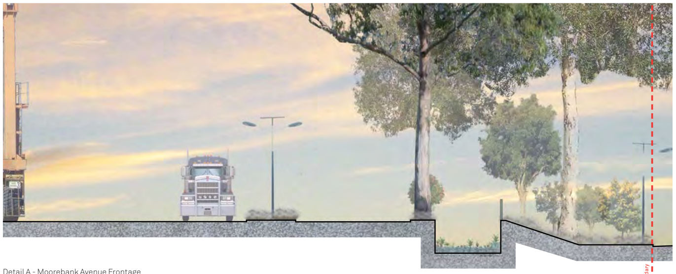
Detail A - Moorebank Avenue Frontage

Key nodal points along Moorebank Avenue, specifically at vehicle entry zones, will include additional feature planting to highlight the arrival experience and embellish the native planting character established elsewhere along the road frontage.