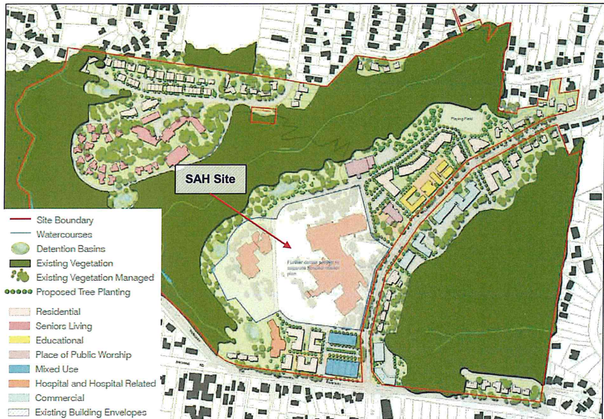
Figure 1: Approved Concept Plan Layout

The concept plan has been modified on three other occasions, details of which are provided at Appendix A. These concept plan modifications are unrelated to the current modification to the project application.