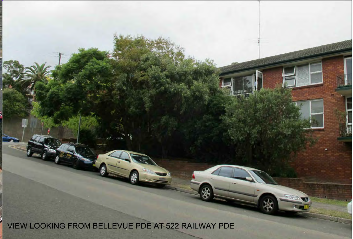
VIEW LOOKING FROM BELLEVUE PDE AT 522 RAILWAY PDE