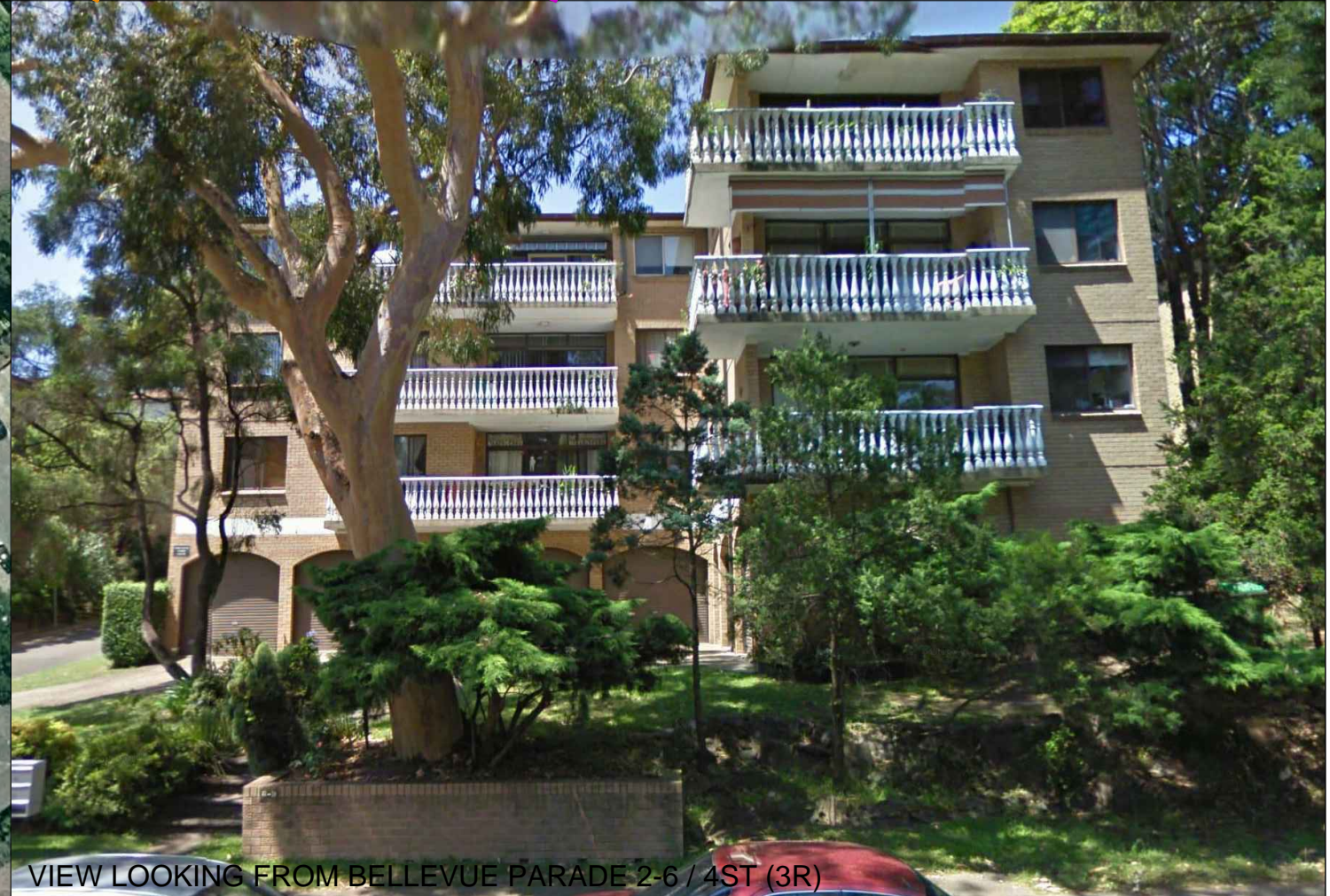
VIEW LOOKING FROM BELLEVUE PARADE 2-6 / 4ST (3R)