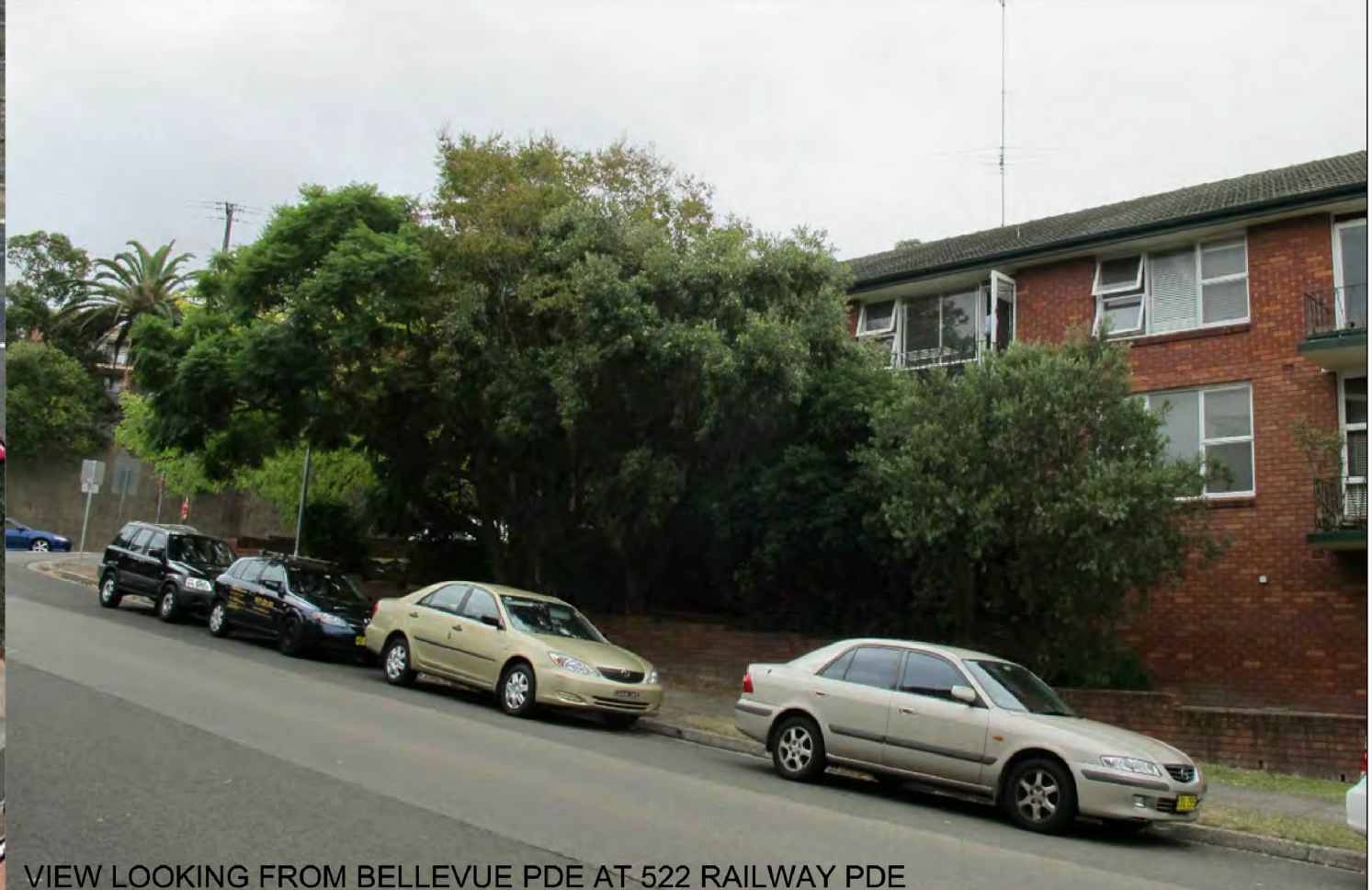
VIEW LOOKING FROM BELLEVUE PDE AT 522 RAILWAY PDE