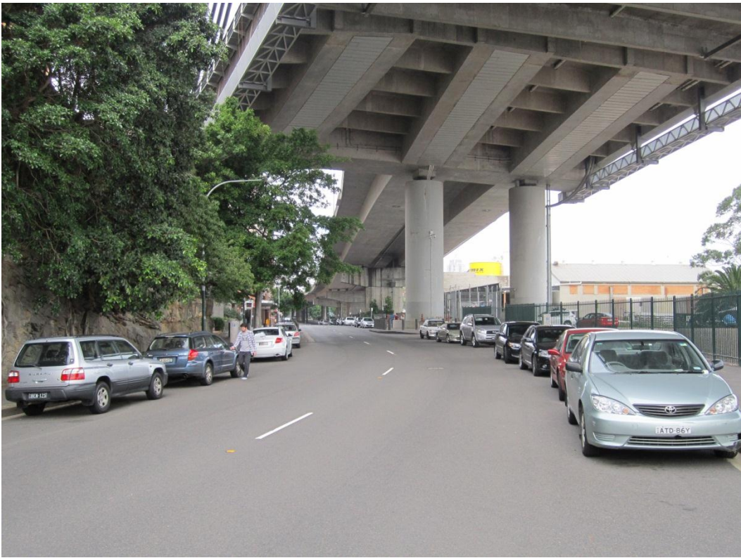
Figure 3. On-street parking utilisation on Bank Street adjacent subject site