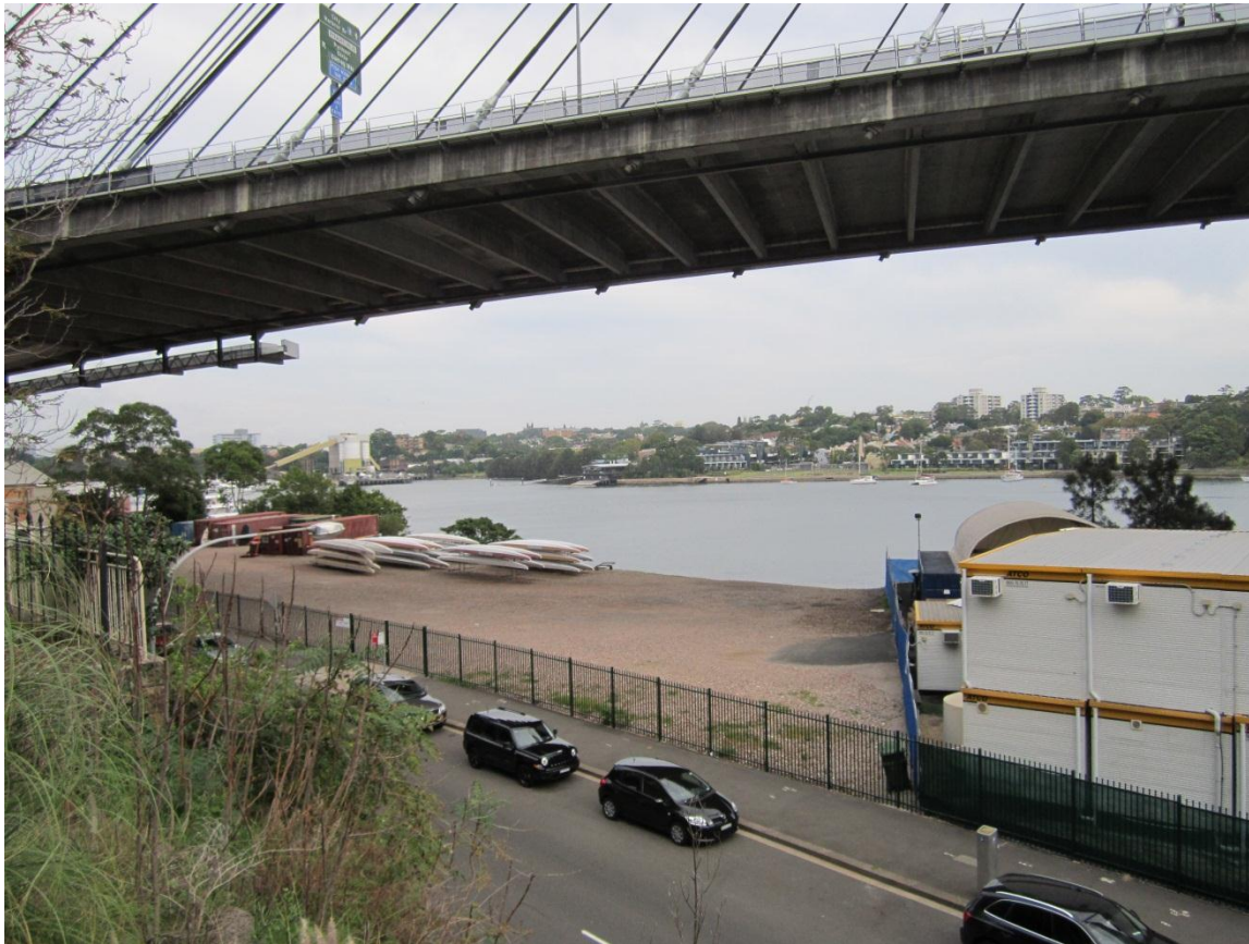
Figure 1. Subject site, view from North to South

The subject site is on Bank Street, Pyrmont beneath the Anzac Bridge, and is shown in Figure 1.