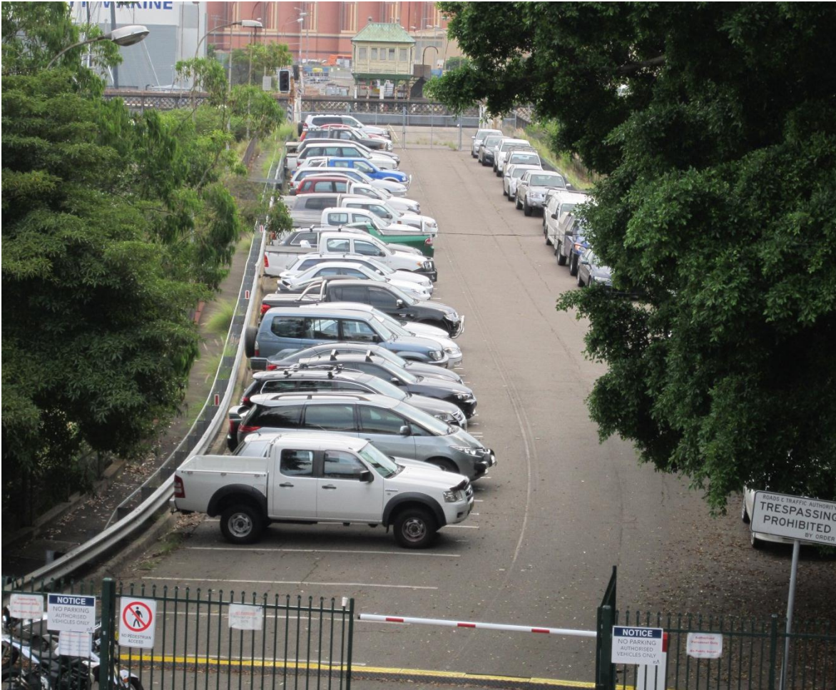
Figure 4. Parking on Old Glebe Island Bridge eastern abutment for Anzac Bridge maintenance project

The abutment is already set out as a formal car park. As noted in the EA report however, no commitment has been made by RMS that this area will be turned over at some time in the future either as a dedicated car park for the SHF development or as a public parking area.