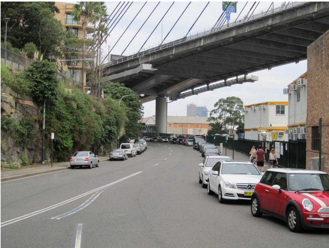
Figure 2. On-street parking utilisation on Bank Street adjacent subject site