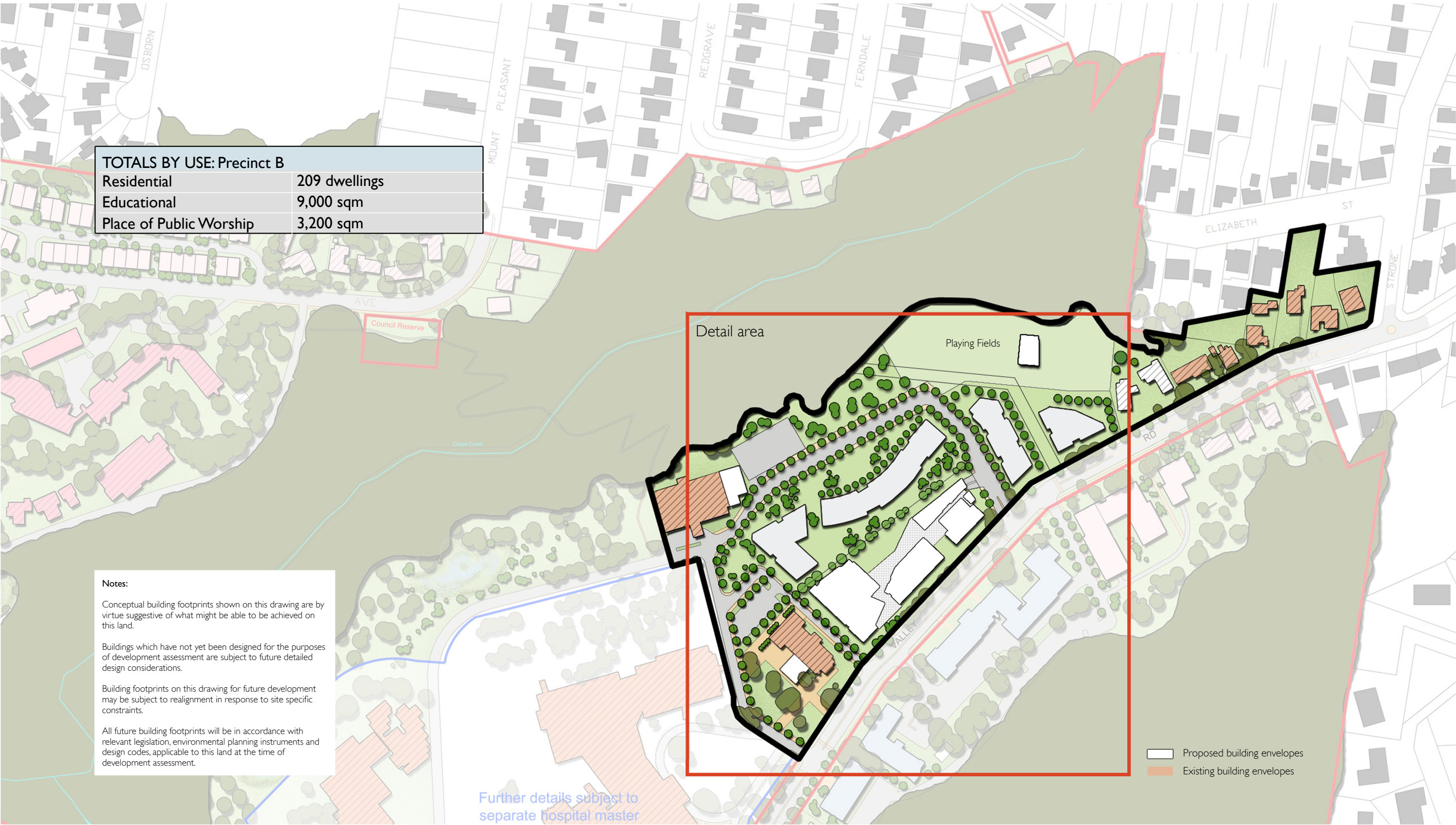
figure 45(A) - precinct B: central church revised (refer to page 60 of the Final Preferred Project Report & Concept Plan)