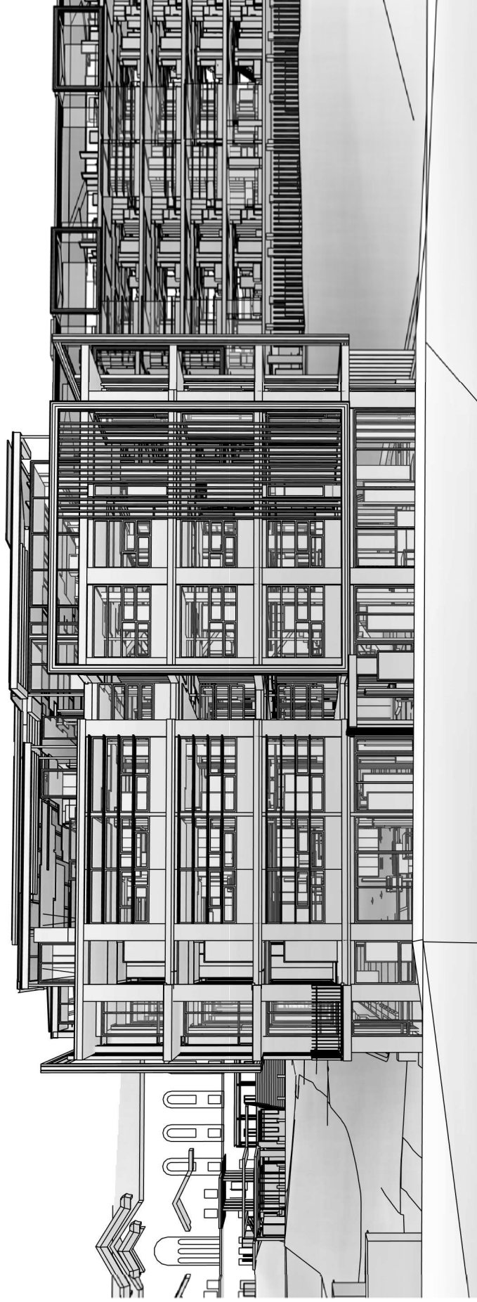
VIEW NORTH ALONG WILLIAM STREET TOWARDS BUILDING B2 & B3