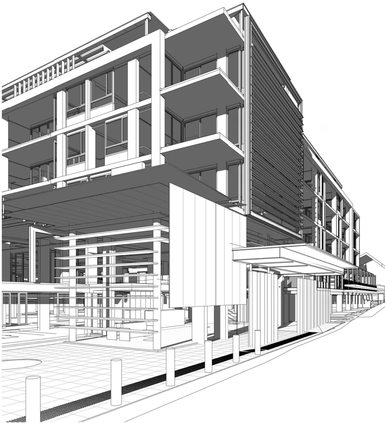
VIEW FROM THE NORTH WESTERN EDGE OF THE VILLAGE GREEN TOWARDS BUILDING B4