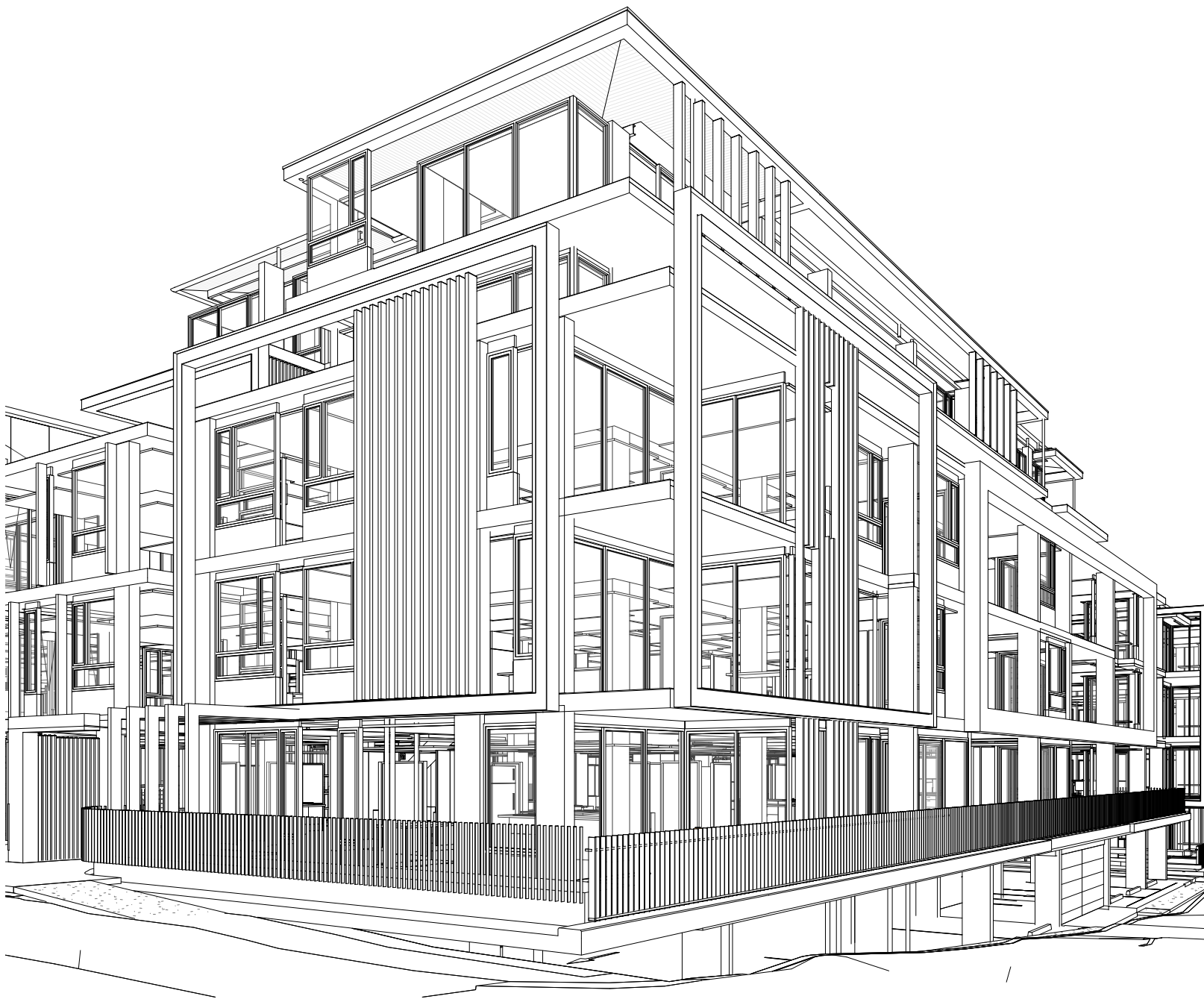
VIEW FROM THE NORTH WESTERN EDGE OF THE VILLAGE GREEN TOWARDS BUILDING B4