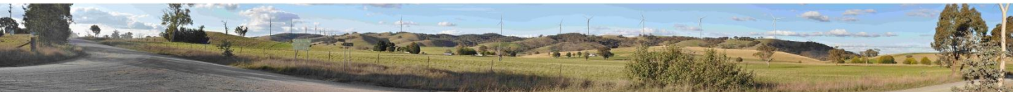
Preliminary wind farm photomontage at the corner of Cooks Hill Road and Dalton Road