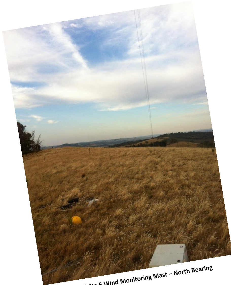
Rye Park No 5 Wind Monitoring Mast – North Bearing