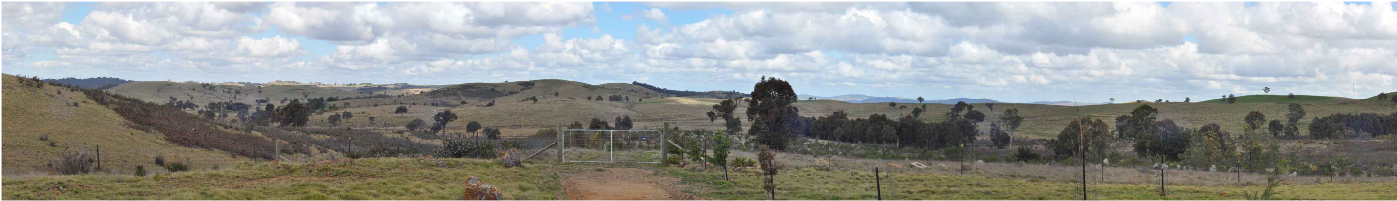
Uninvolved residential dwelling R1- Existing view south east to west south west. Photo coordinate Easting:677551 Northing:6187037 (MGAz55 )