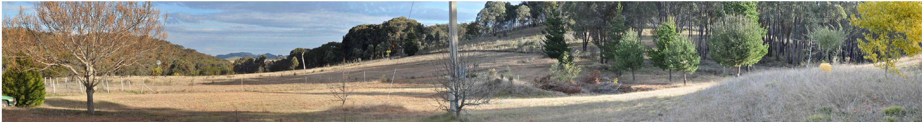
Uninvolved residential dwelling R9- Existing view south to west north west. Photo coordinate Easting:682545 Northing:6183840 (MGAz55)