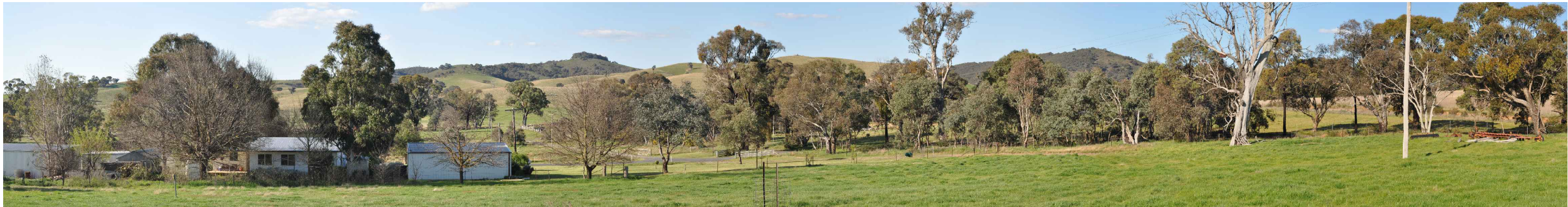
Uninvolved residential dwelling R17- Existing view north to east south east. Photo coordinate Easting:676148 Northing:6181529 (MGAz55)