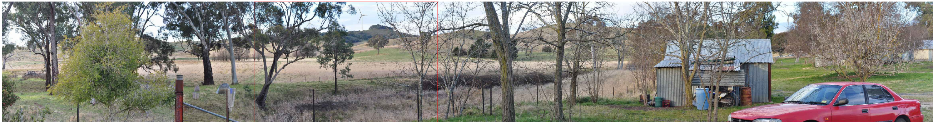
Uninvolved residential dwelling R20 - Existing view through 120°. Approximate distance to closest visible Rye Park wind turbine 1,870 m

Composite panorama photograph taken with a Nikon D90 digital SLR camera with 50 mm prime lens. Individual panorama photograph coordinate map datum is MGAz55 to ± 5 m. Extent of potential wind turbine visibility and directional bearing illustrated on each photomontage is indicative only.