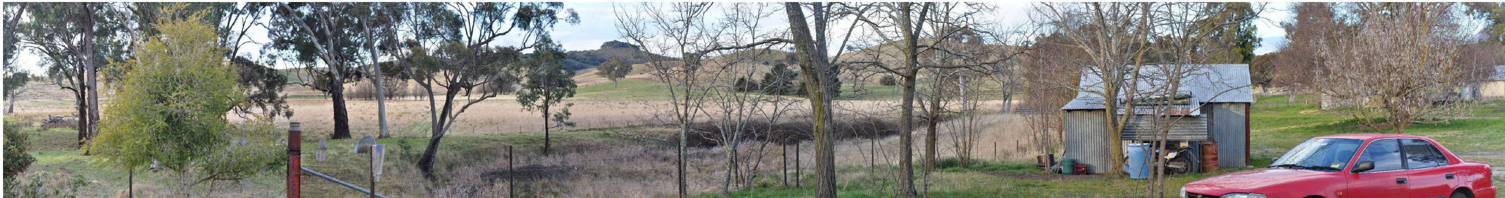
Uninvolved residential dwelling R20 - Existing view north to east south east. Photo coordinate Easting:676044 Northing:6181745 (MGAz55)