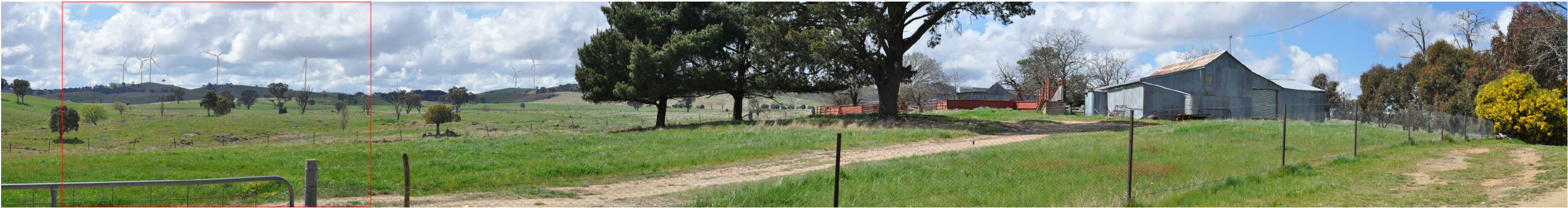
Uninvolved residential dwelling R24- Proposed view through 120°. Approximate distance to closest visible wind turbine 2,150 m

Composite panorama photograph taken with a Nikon D90 digital SLR camera with 50 mm prime lens. Individual panorama photograph coordinate map datum is MGAz55 to ± 5 m. Extent of potential wind turbine visibility and directional bearing illustrated on each photomontage is indicative only.