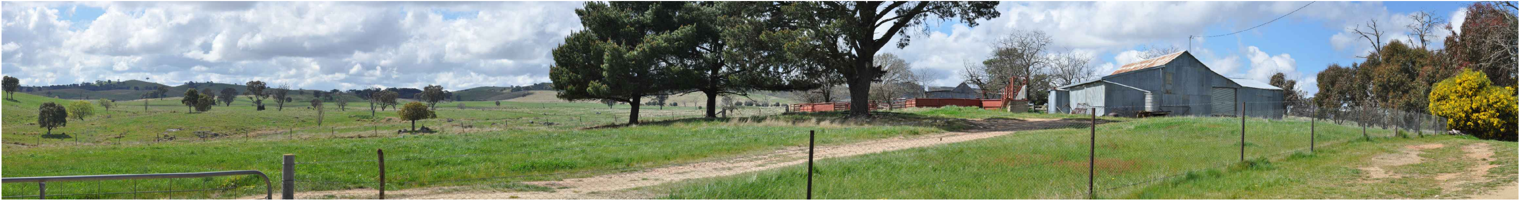
Uninvolved residential dwelling R24- Existing view north north east to south east. Photo coordinate Easting:674884 Northing:6183559 (MGAz55)