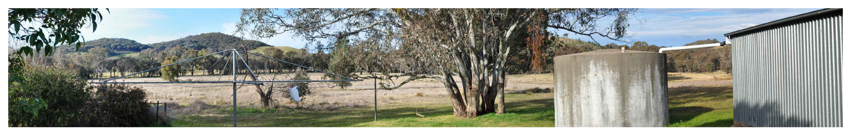
Uninvolved residential dwelling R29- Existing view north to south east. Photo coordinate Easting:676445 Northing:6177895 (MGAz55)