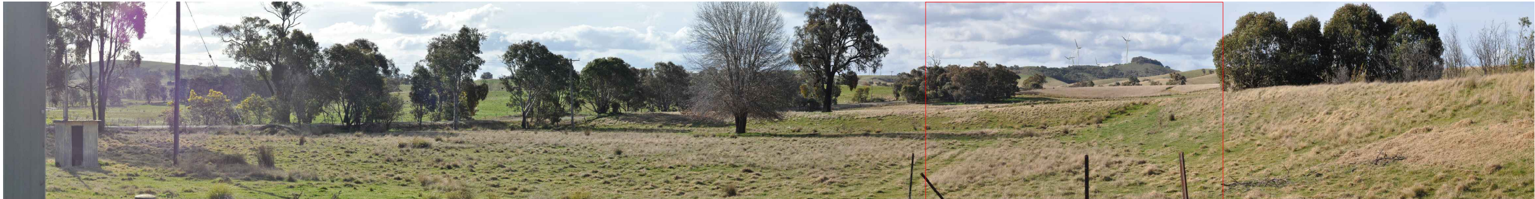
Uninvolved residential dwelling R22- Proposed view through 120°. Approximate distance to closest visible wind turbine 1,850 m

Composite panorama photograph taken with a Nikon D90 digital SLR camera with 50 mm prime lens. Individual panorama photograph coordinate map datum is MGAz55 to ± 5 m. Extent of potential wind turbine visibility and directional bearing illustrated on each photomontage is indicative only.