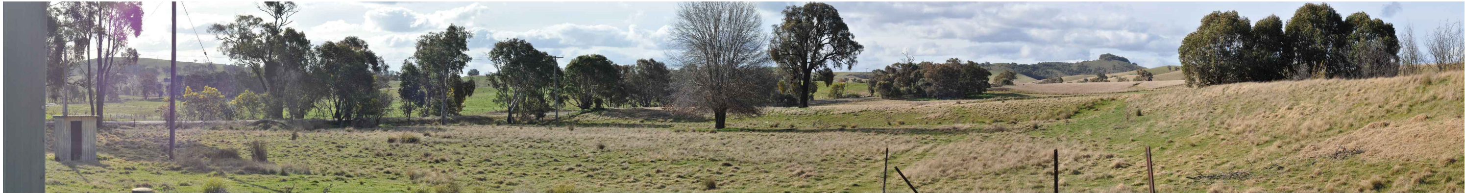
Uninvolved residential dwelling R22- Existing view north west to north east. Photo coordinate Easting:676120 Northing:6181058 (MGAz55)