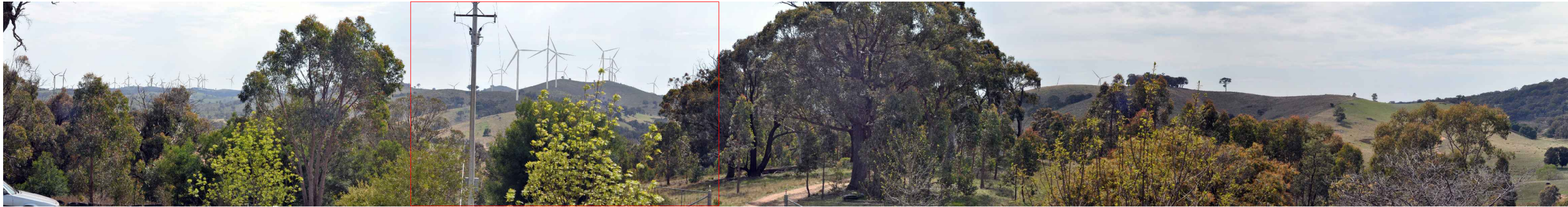
Uninvolved residential dwelling R38- Proposed view through 120°. Approximate distance to closest visible wind turbine 1,400 m

Composite panorama photograph taken with a Nikon D90 digital SLR camera with 50 mm prime lens. Individual panorama photograph coordinate map datum is MGAz55 to ± 5 m. Extent of potential wind turbine visibility and directional bearing illustrated on each photomontage is indicative only.