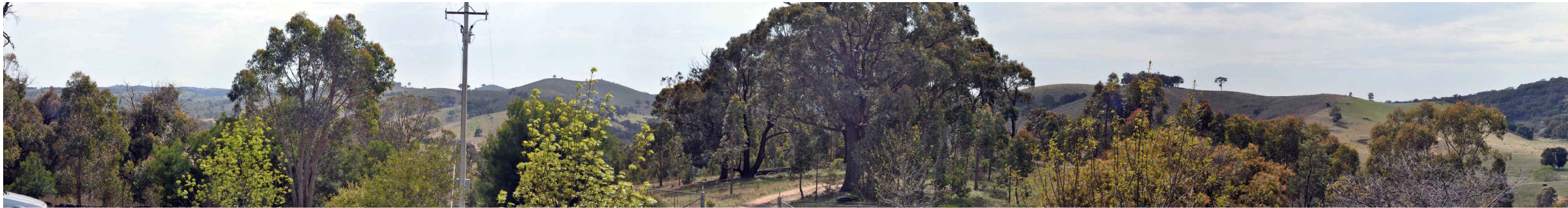
Uninvolved residential dwelling R38- Existing view north north west to east. Photo coordinate Easting:679632 Northing:6173617 (MGAz55)