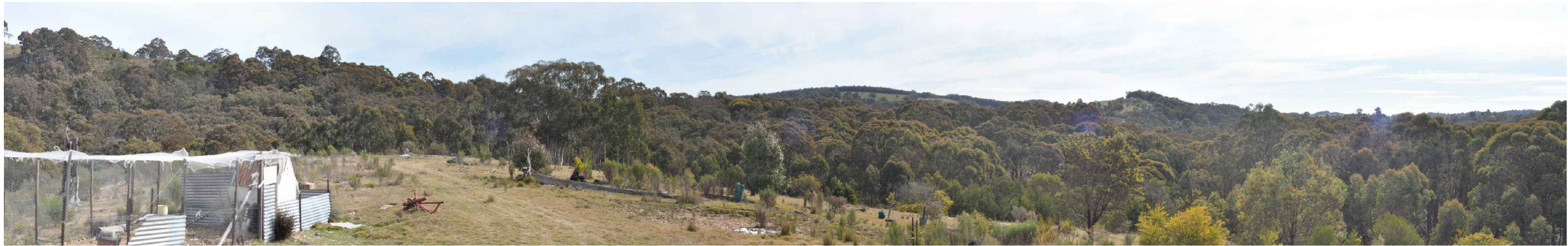
Uninvolved residential dwelling R45- Existing view west to north. Photo coordinate Easting:682827 Northing:6165276 (MGaz55)