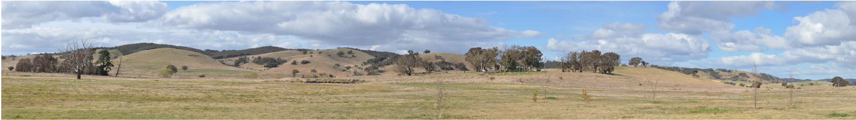
Uninvolved residential dwelling R48- Existing view north to south east. Photo coordinate Easting:679826 Northing:6162660 (MGAz55)