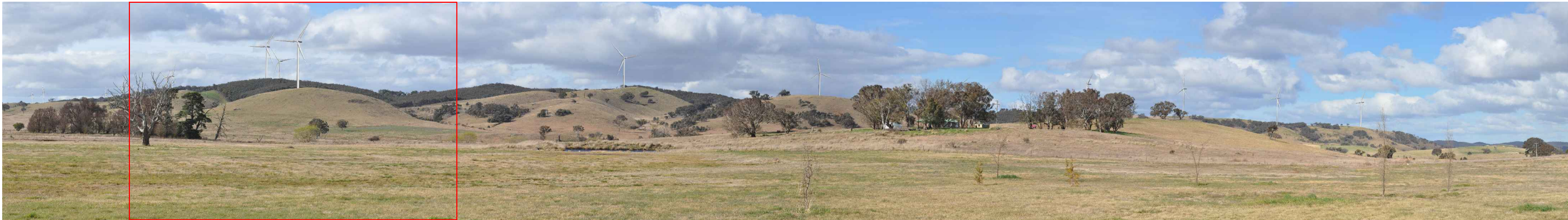
Uninvolved residential dwelling R48- Proposed view through 120°. Approximate distance to closest visible wind turbine 1,236 m

Composite panorama photograph taken with a Nikon D90 digital SLR camera with 50 mm prime lens. Individual panorama photograph coordinate map datum is MGAz55 to ± 5 m. Extent of potential wind turbine visibility and directional bearing illustrated on each photomontage is indicative only.