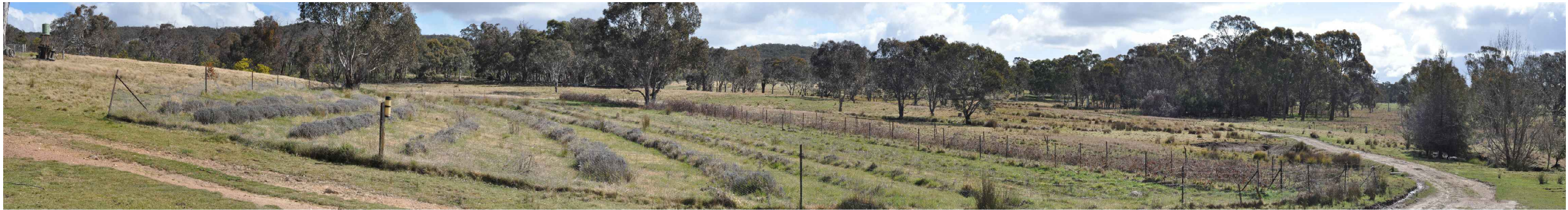
Uninvolved residential dwelling R55- Existing view south west to north west. Photo coordinate Easting:689373 Northing:6154185 (MGAz55)